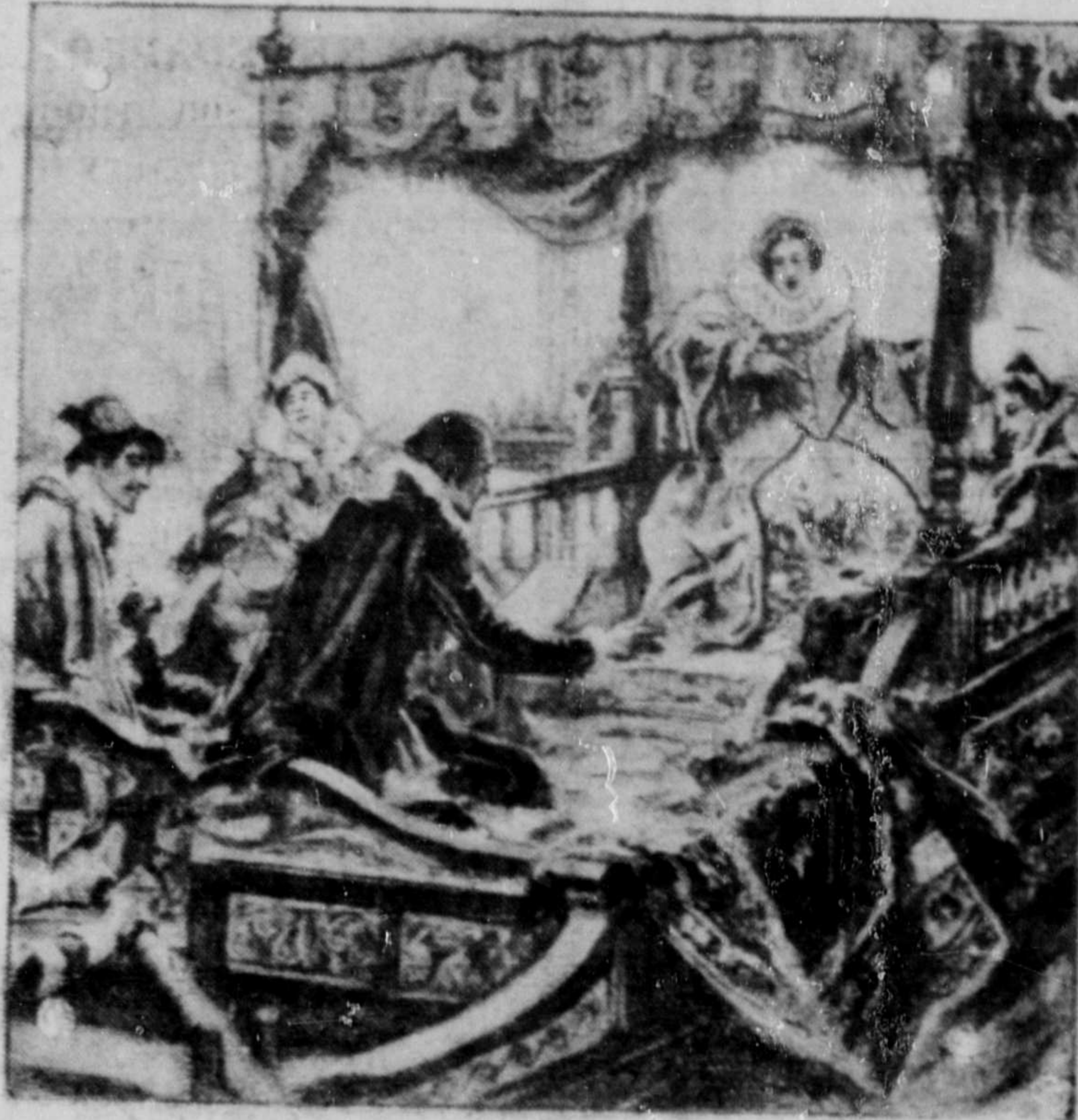
In conformance with annual tradition, we present herewith a picture of Prince of Wales' Christmas card. The picture's subject is Queen Elizabeth giving audience to Shakespeare.