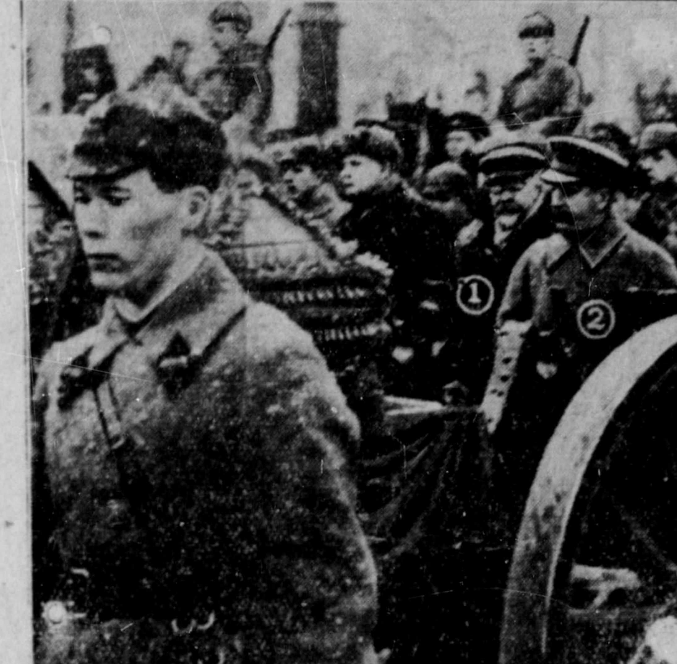
M. I. Kalinin (1), president of the U.S.S.R., and Joseph Stalin (2), dictator, marching in the funeral procession of S. M. Kirov, assassinated chieftain of the Leningrad Soviet.