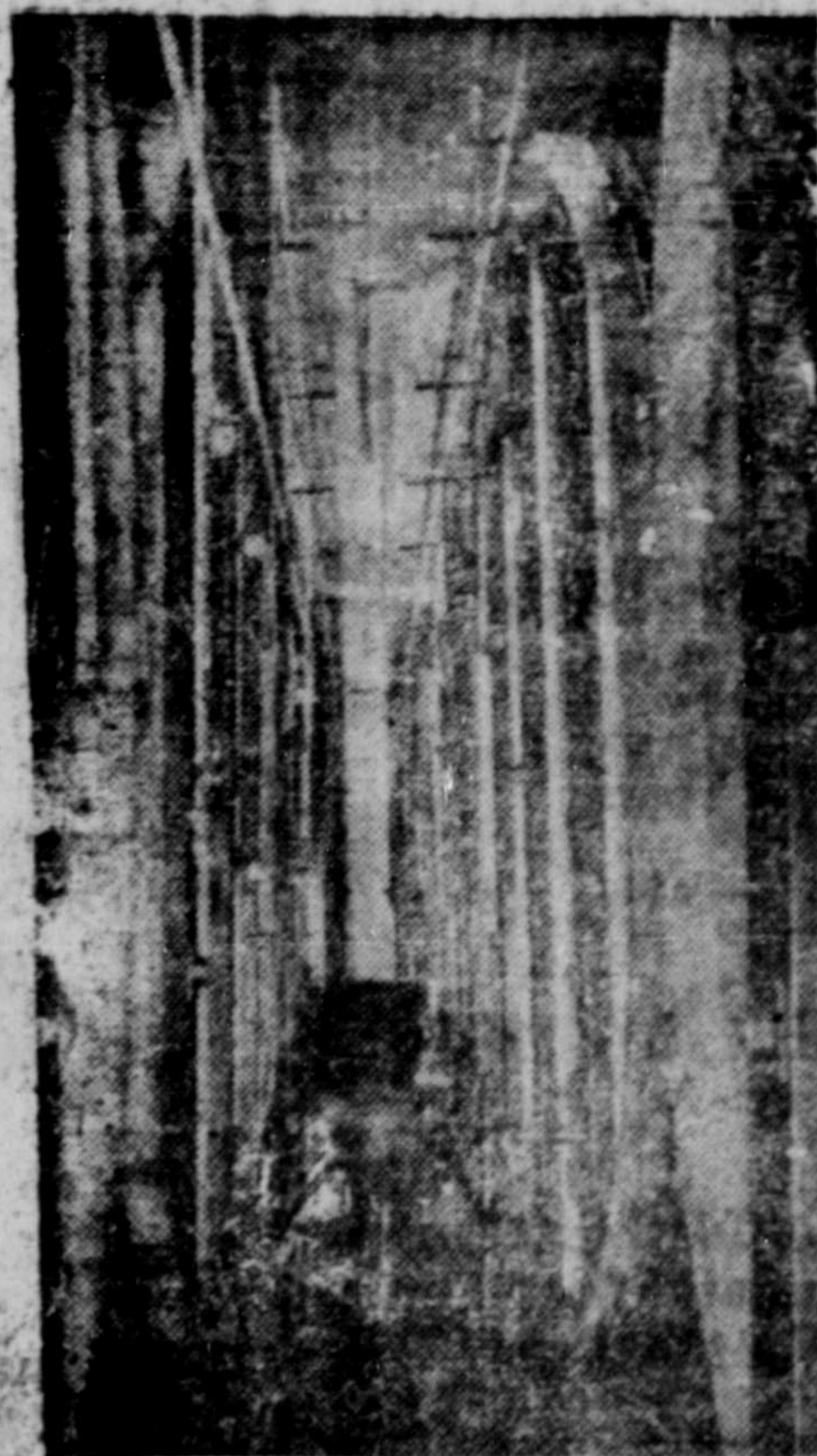
Pictured Above—550 barrels of "Capilano" stored and aged to ultimate perfection.