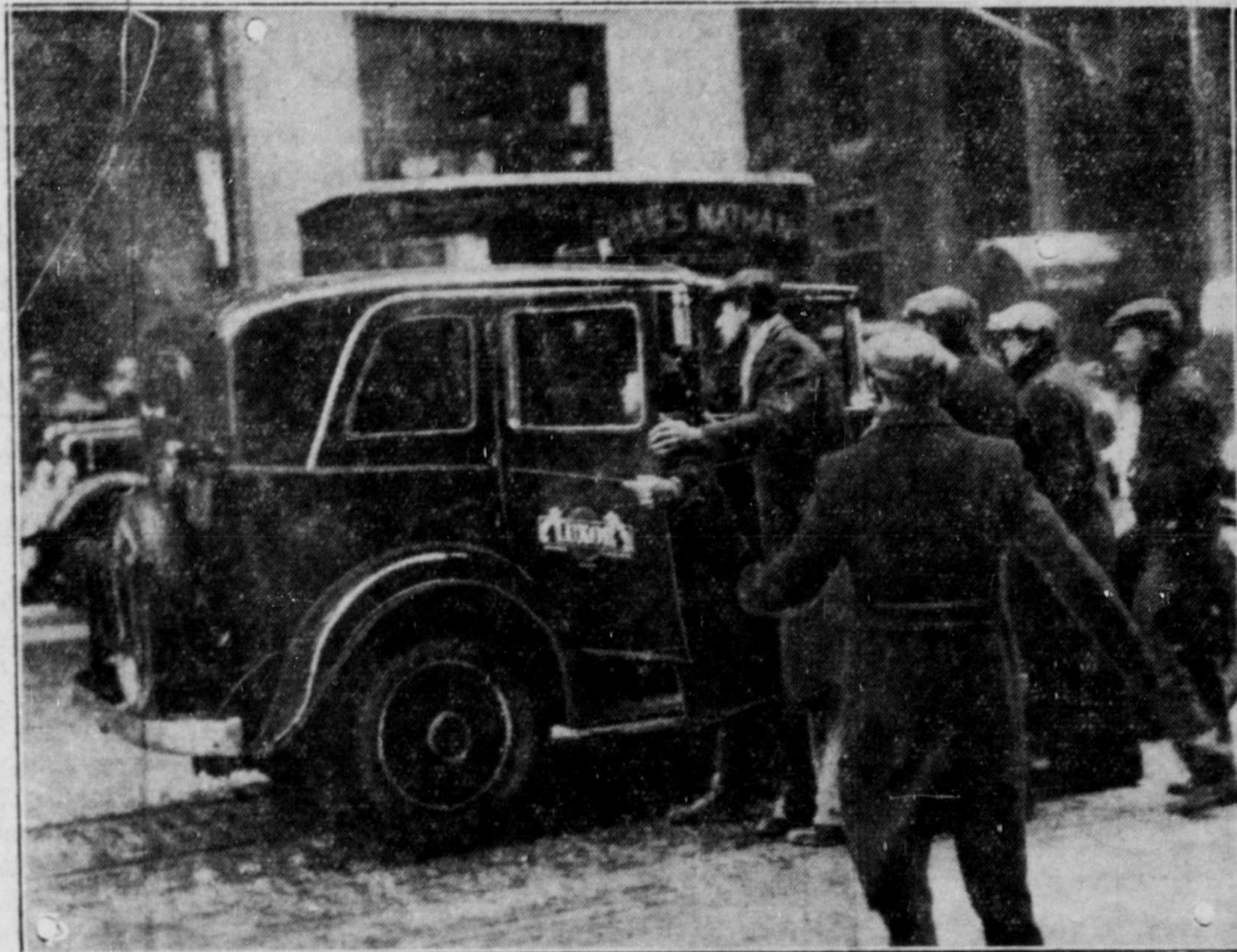
Striking taxi drivers, on picket duty, were snapped in New York as they persuaded an independent chauffeur to take his cab back to the garage. The recent strike of the New York taxi chauffeurs, called to compel action in their favor in the disposal of the 2,000,000 or more extra nickels collected from riders under the "nickel-tax" law that has been declared unconstitutional, was almost a complete tie-up, and even the independents were keeping their cars in the garages until the issue had been settled. There was no violence on either side, and no attempt was made to import strikebreaking chauffeurs by the big companies.