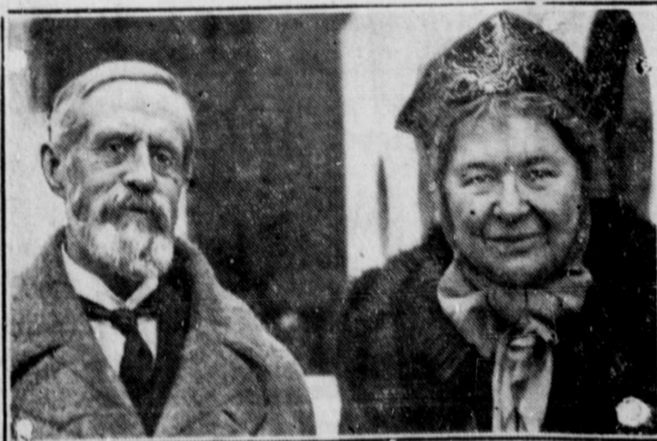
Former Governor General of Canada who passed away yesterday at his home in Edinburgh.