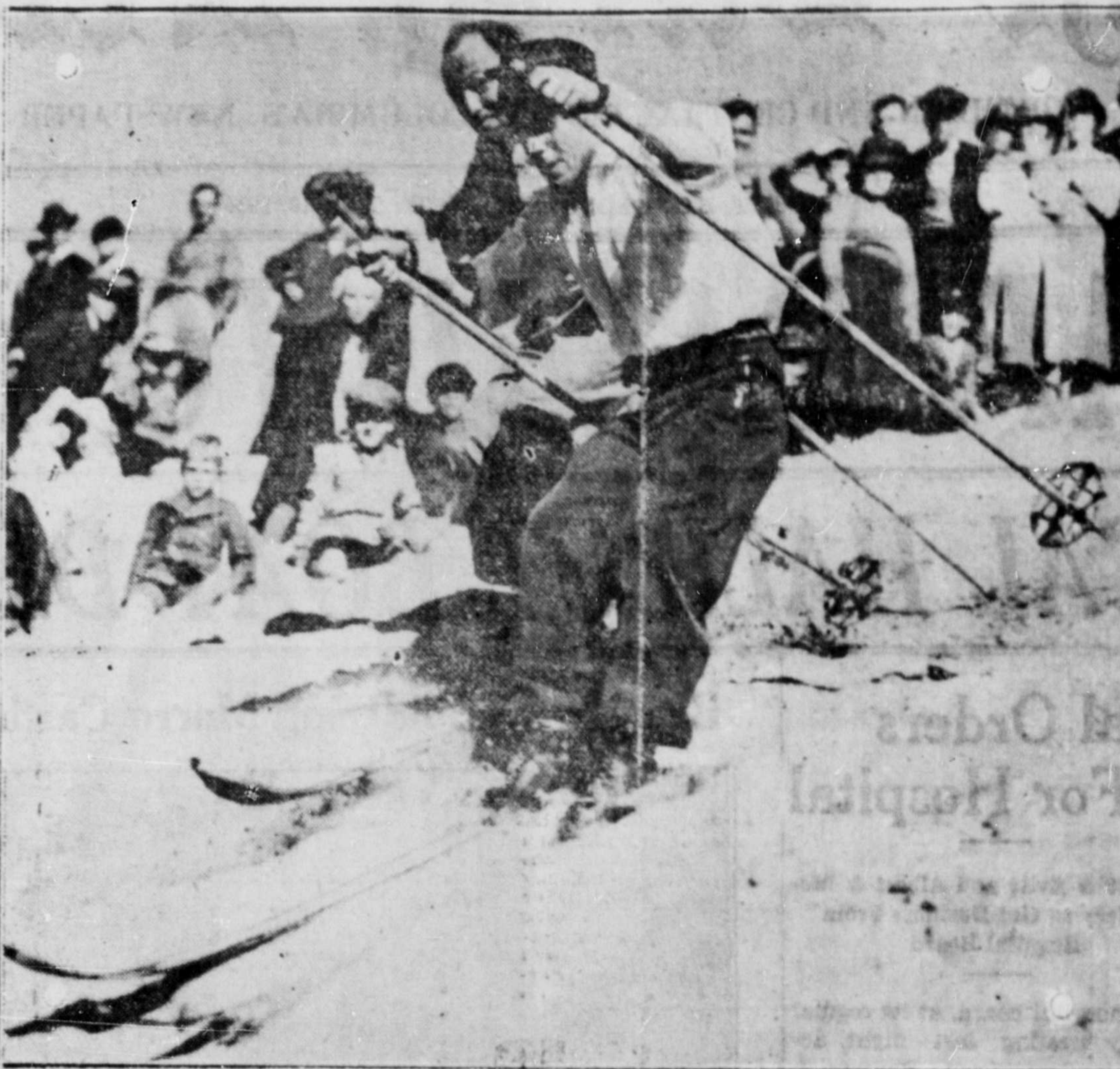
A new sport of skiing on beach sand hills has been introduced at Crumall Beach, Sydney, New South Wales. The chap in the picture certainly seems to be enjoying the new sport.