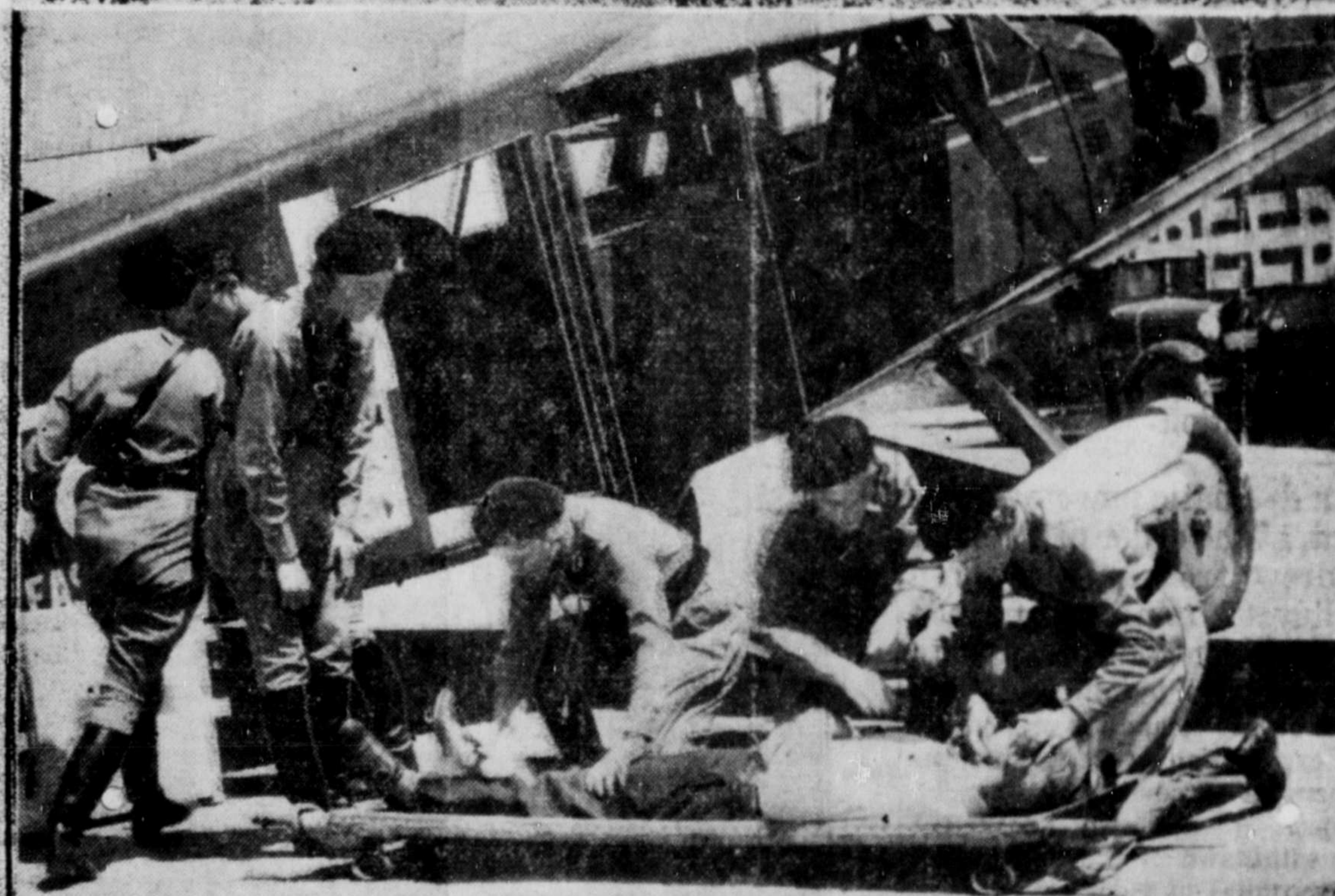
Women will do more than hospital work and tending the home fires in the next war, as these two pictures illustrate. In the upper one we see modern Greek Amazons taking an active interest in the practice of battle tactics. They are members of one of the numerous patriotic organizations in Greece. The lower picture shows the newly organized medical detachment of the women's air reserve as they are put through first practice beside their ambulance aeroplane under the direction of Lieut. Emma Kittridge, standing.