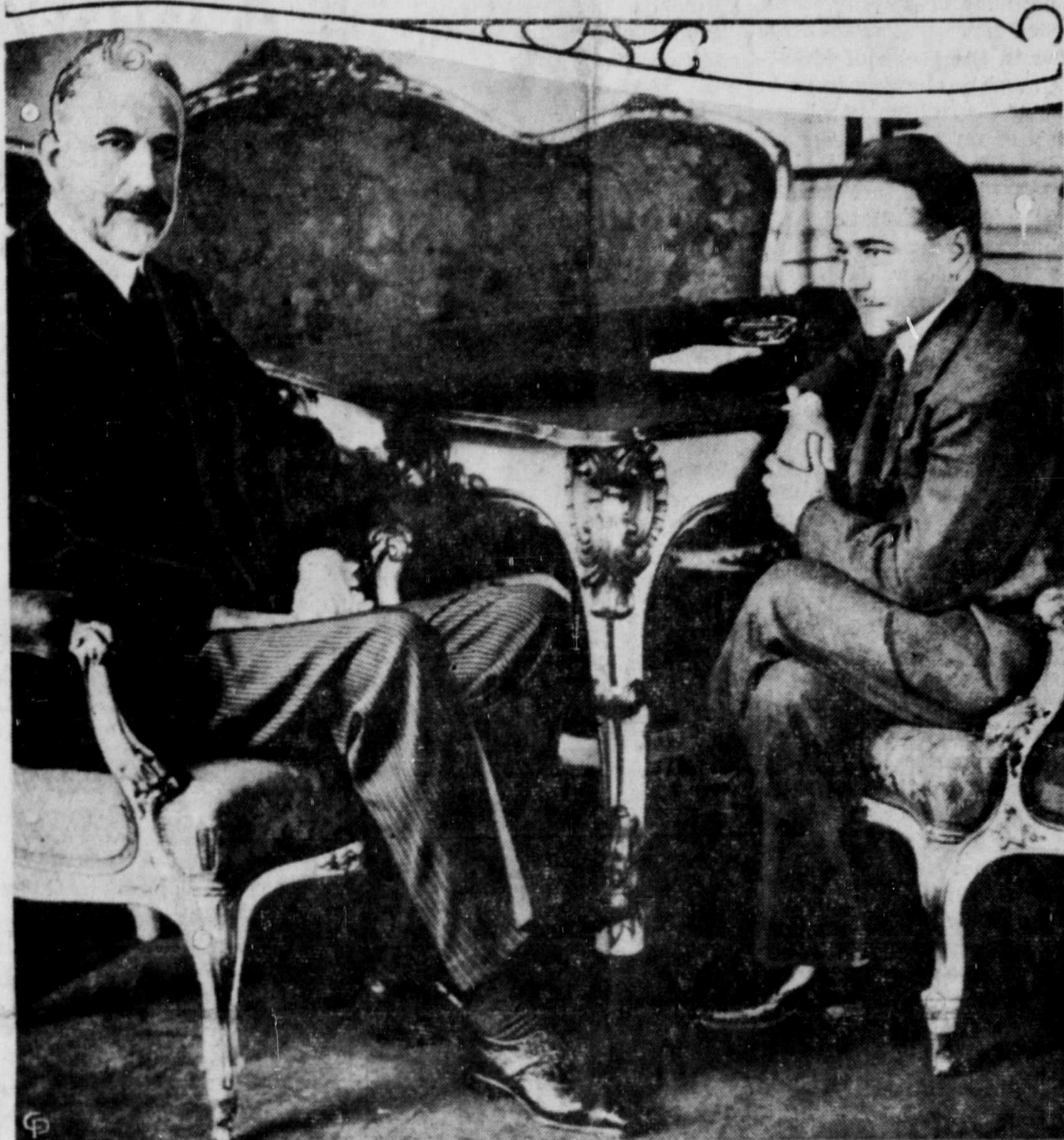
The Archduke Eugene (Left) has an interview with Chancellor Dollfuss as he returns to his native country for the first time in 15 years. He is the first Hapsburg to re-enter Vienna. The archduke went into self-imposed exile in Switzerland after refusing to relinquish his imperial claim. He was greeted with enthusiasm by the people.