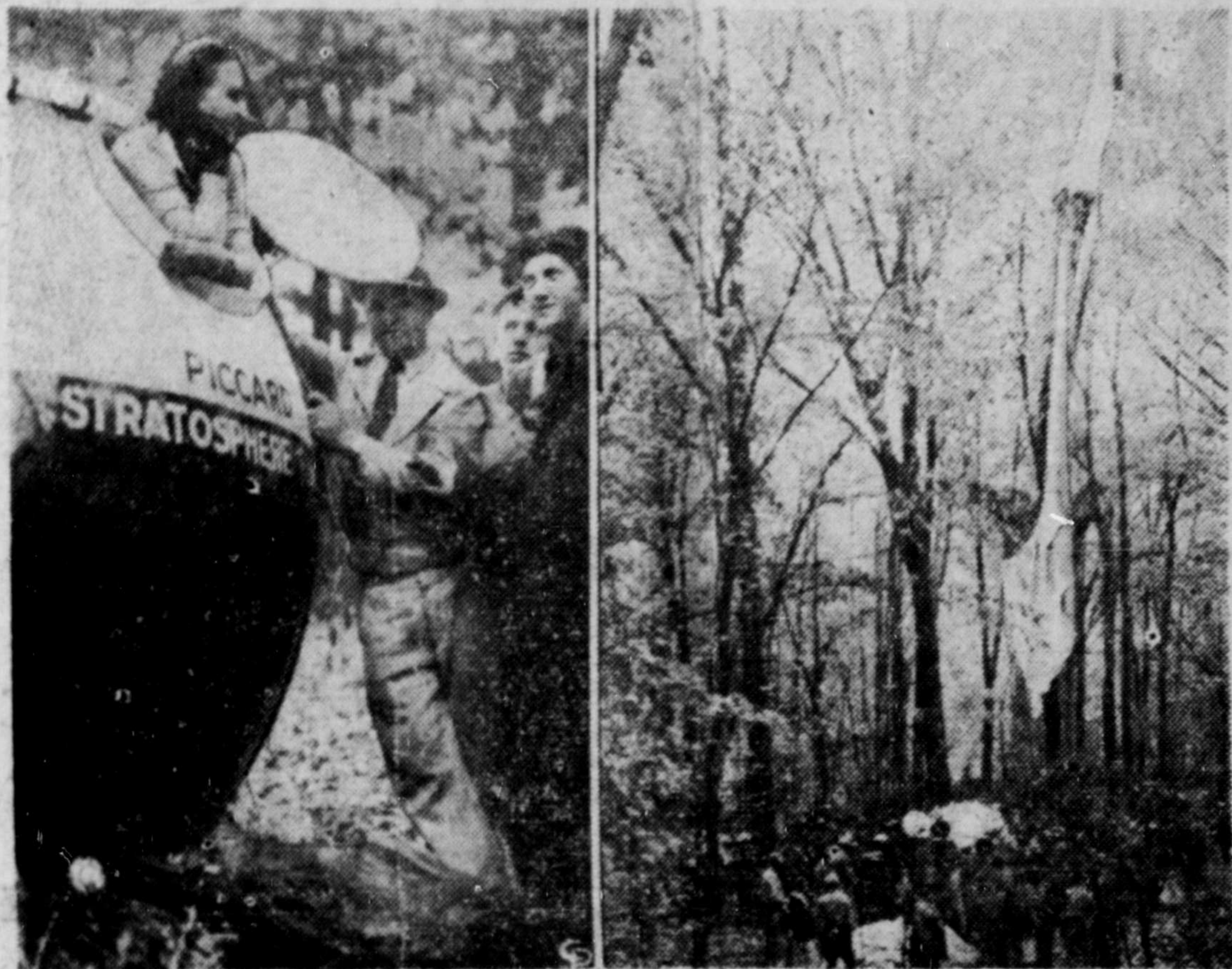
Drifting more than 200 miles from their Detroit take-off, Dr. Jean Piccard and his wife, Jeannette, as assistant pilot, sent their balloon soaring 10 miles into the stratosphere, during the first flight ever attempted by a woman, before their gondola dropped into a wood near Cadiz, O. Left, shows Mrs. Piccard leaning out of the aluminum car for cameramen after her lofty adventure; right, a view of the silk bag hanging from the trees.