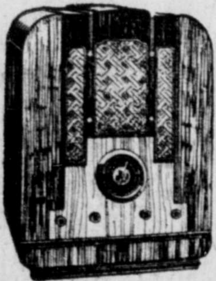
Victor Model 122 Selective Wave $89.50 Complete with tubes

Learn the joys of cruising the world by radio, with these new selective-wave Victor models. Here, at a remarkable price, is a receiver that really makes European and North American short-wave daylight reception a regular part of your home entertainment... a receiver that covers all broadcast programs, whether short or long wave. Easy terms.