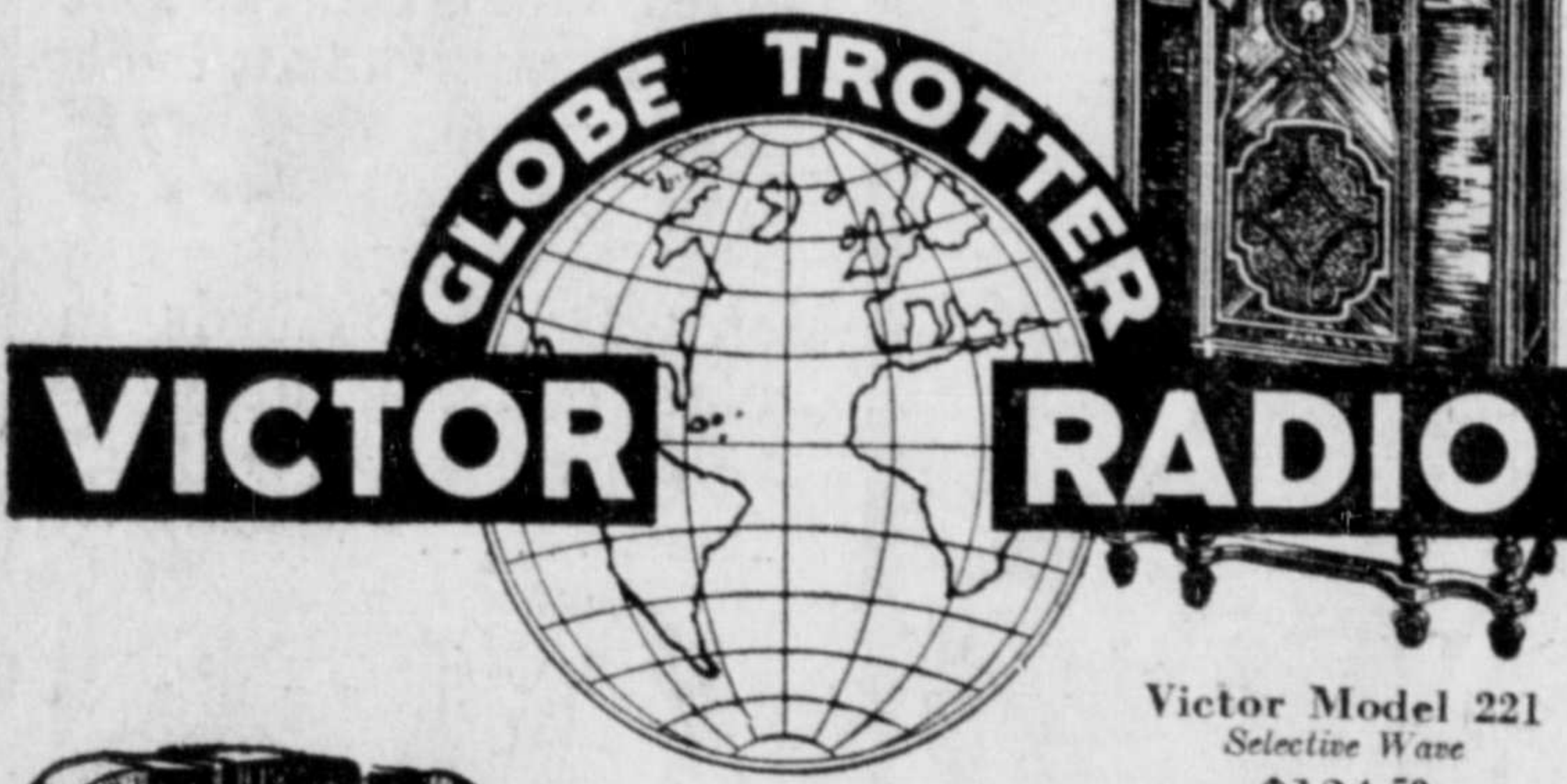
Victor Model 221 Selective Wave $124.50 Complete with tubes