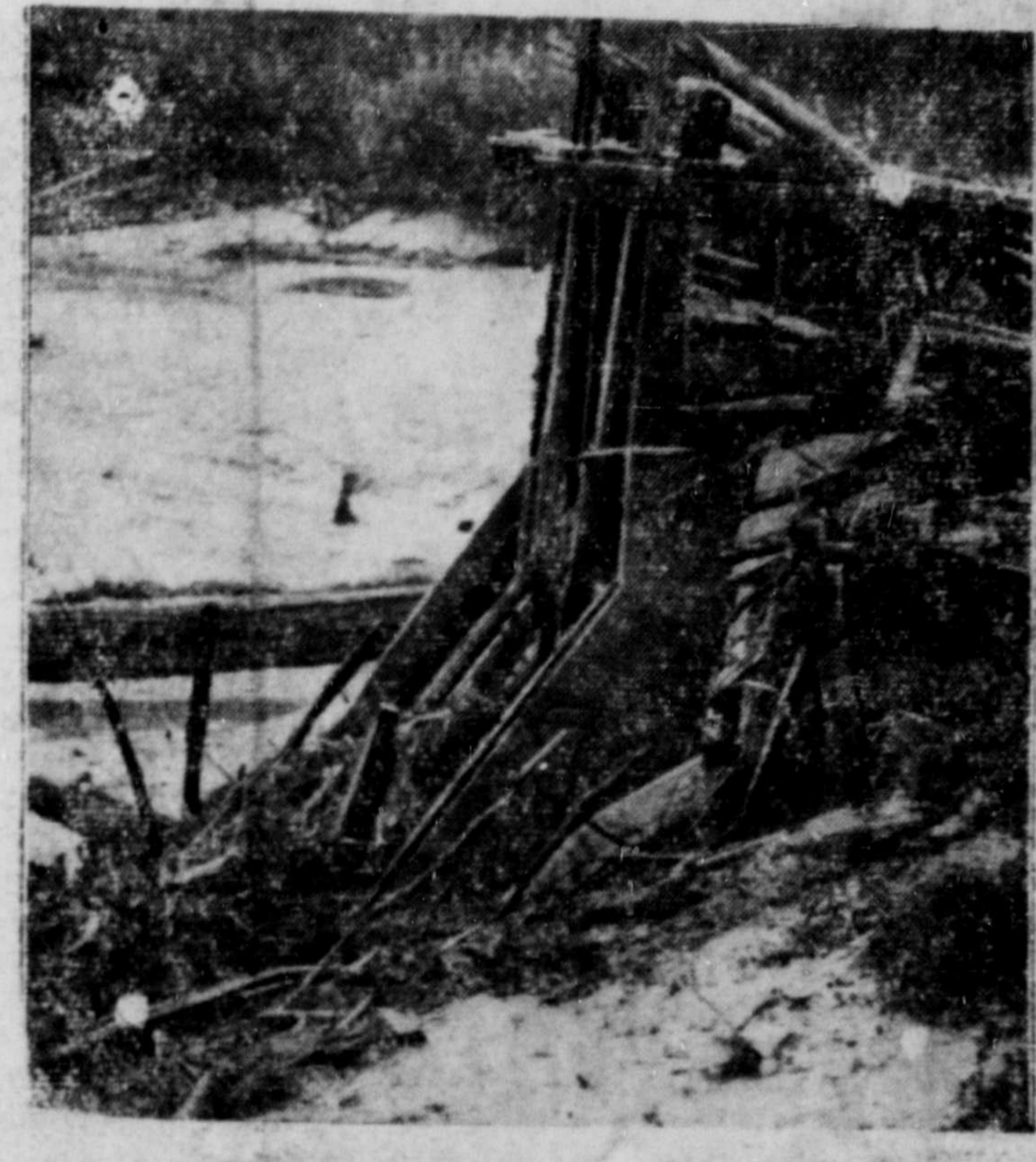
All that remains of a mill dam at Kettleby, Ont., after flood waters, caused by heavy rains, tore it apart, washing out fences, gardens and most of the nearby road.