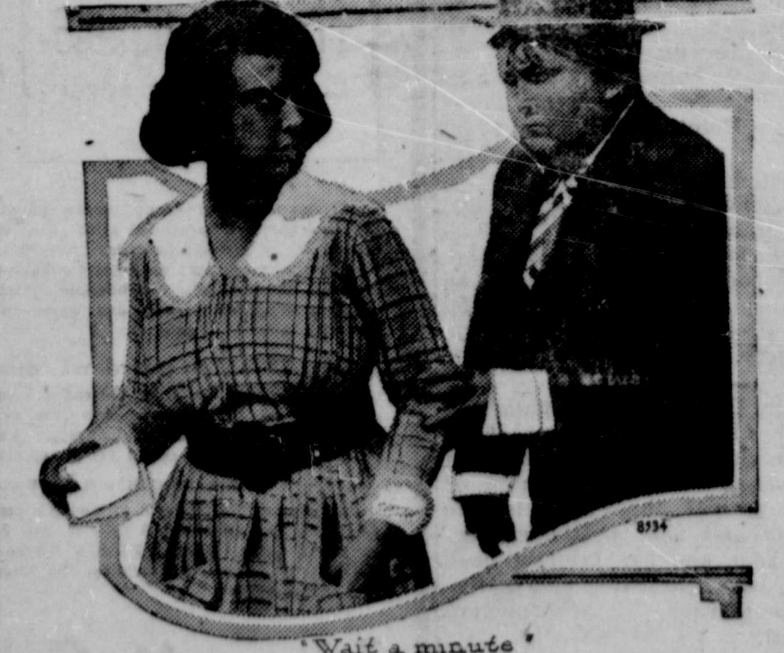
"Wait a minute" Dorothy Dalton presents DOROTHY DALTON in "Hard Boiled" A Paramount Picture Starring tonight at the Westholme Theatre.

The "Garland" Boarding House 416 Sixth Avenue East Near Drydock Board by Month or Week. Phone Red 111.