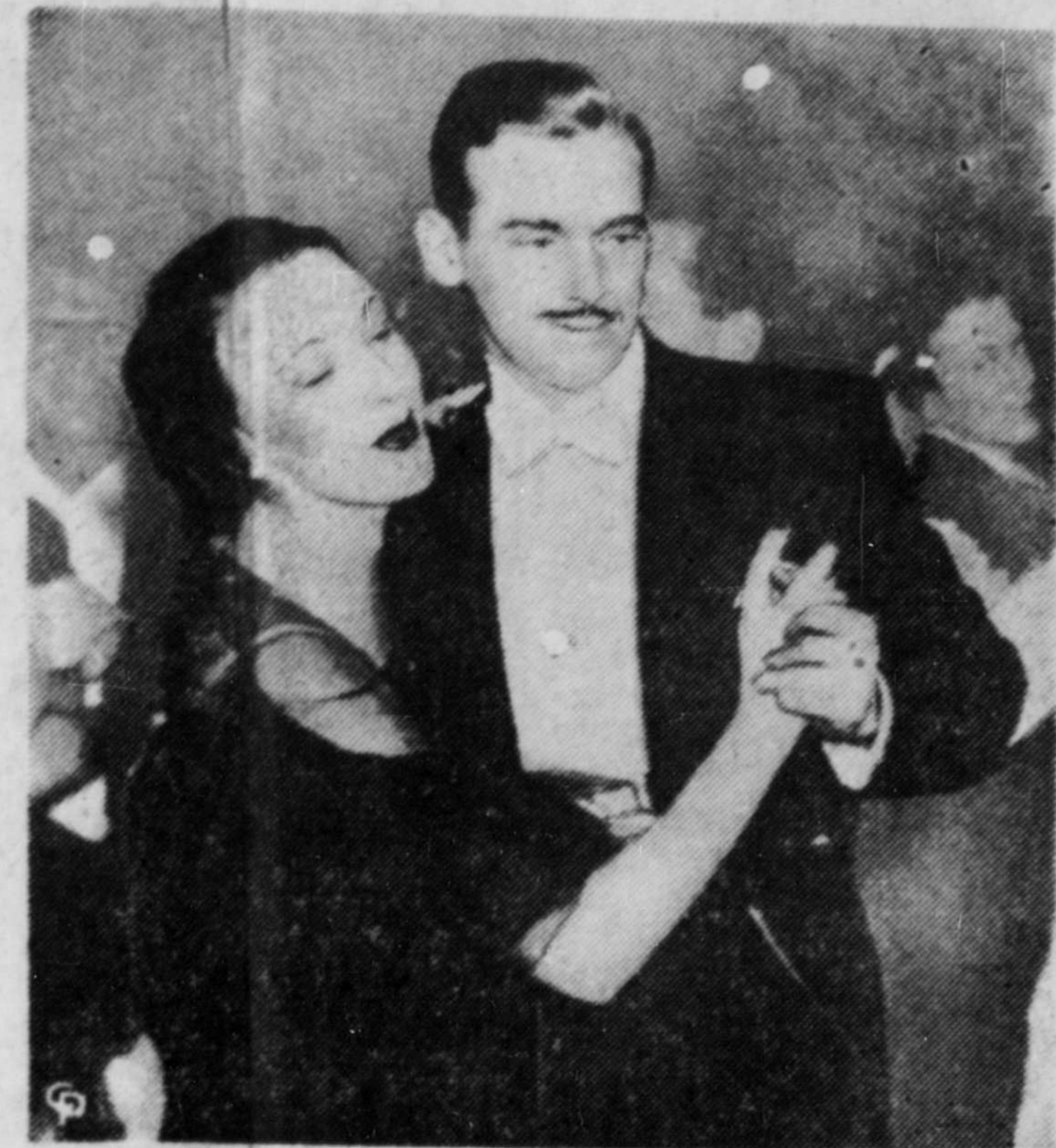
Apparently caring little for the wagging tongues of gossips who assert they are engaged, Douglas Fairbanks, Jr., American movie star, and Gertrude Lawrence, famous English star of the stage, are snapped while dancing at a club in London where Fairbanks is vacationing. Reports are that young Douglas and Miss Lawrence may consider matrimony when his divorce from Joan Crawford, film star, becomes final. Meanwhile Doug sr. is in another part of London.