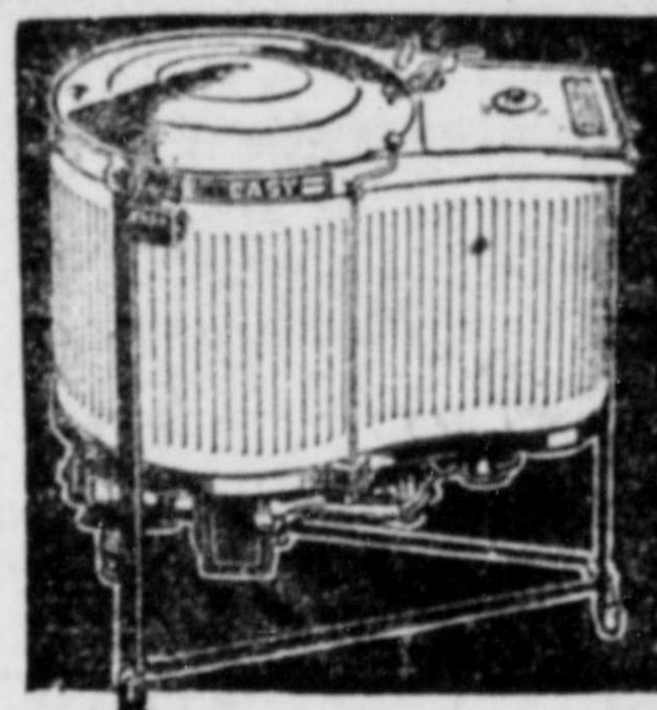
Easy Spin-Dry Vacuum-Cup Electric Washer

Stop the costly toll which obsolete laundry methods take of your fine linens and laces, your delicate lingerie and your family's apparel. The new EASY Spin-Dry Washer washes without friction—dries without ringing—and does both more thoroughly and carefully than any washer has ever done before. Save your share of the $500,000, with EASY... the only washer with vacuum-cup washing action and centrifugal wringerless drying.