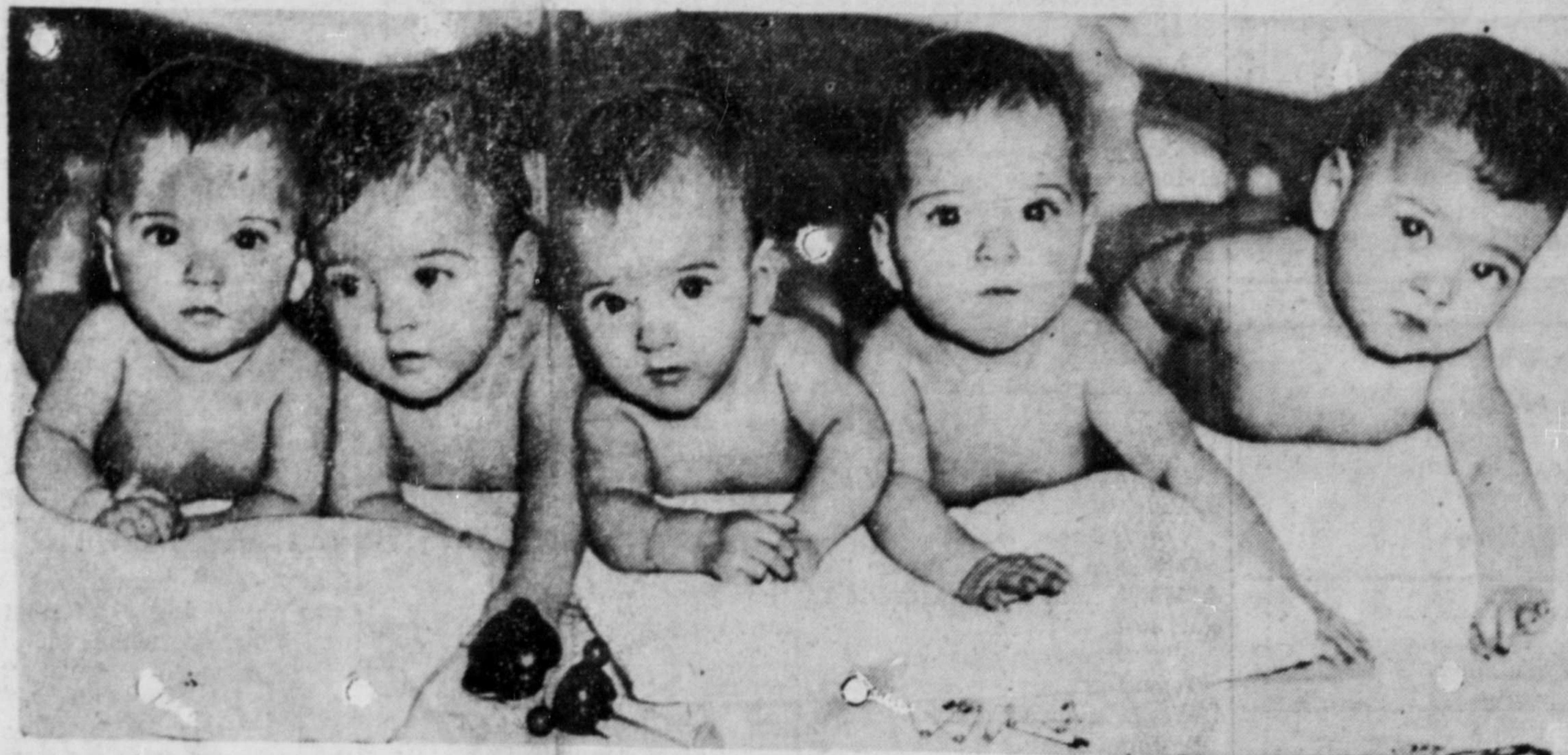
WINDSOR, Ontario, February 23—Mr. and Mrs. Oliva Dionne engaged a lawyer here yesterday and propose to institute legal proceedings towards securing full control of their quintuplet daughters as well as funds being held in trust for them. The children are now in the status of wards of the Canadian government. (Above is one of the latest pictures of the quintuplets—left to right) Emilie, Annette, Marie, Cecile and Yvonne.