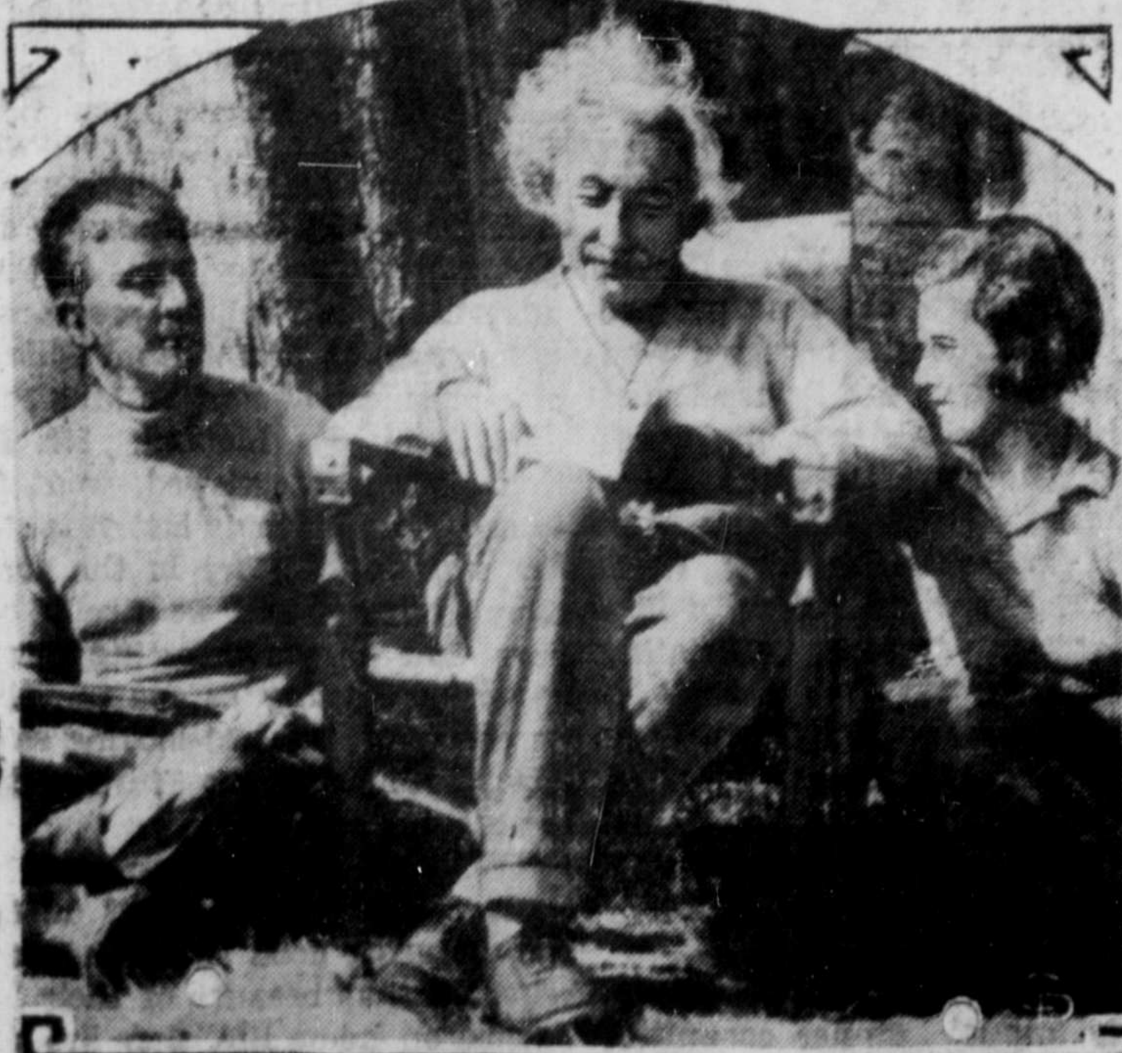
In exile from his native Germany, Professor Albert Einstein, world-famous scientist, is pictured as he rested at the summer camp of Commander Oliver Locker-Lampson, British statesman, who sponsored the professor's visit to England. Following reports of Nazi threats against Einstein, Commander Locker-Lampson (left) does this morning with a shotgun across his knees.