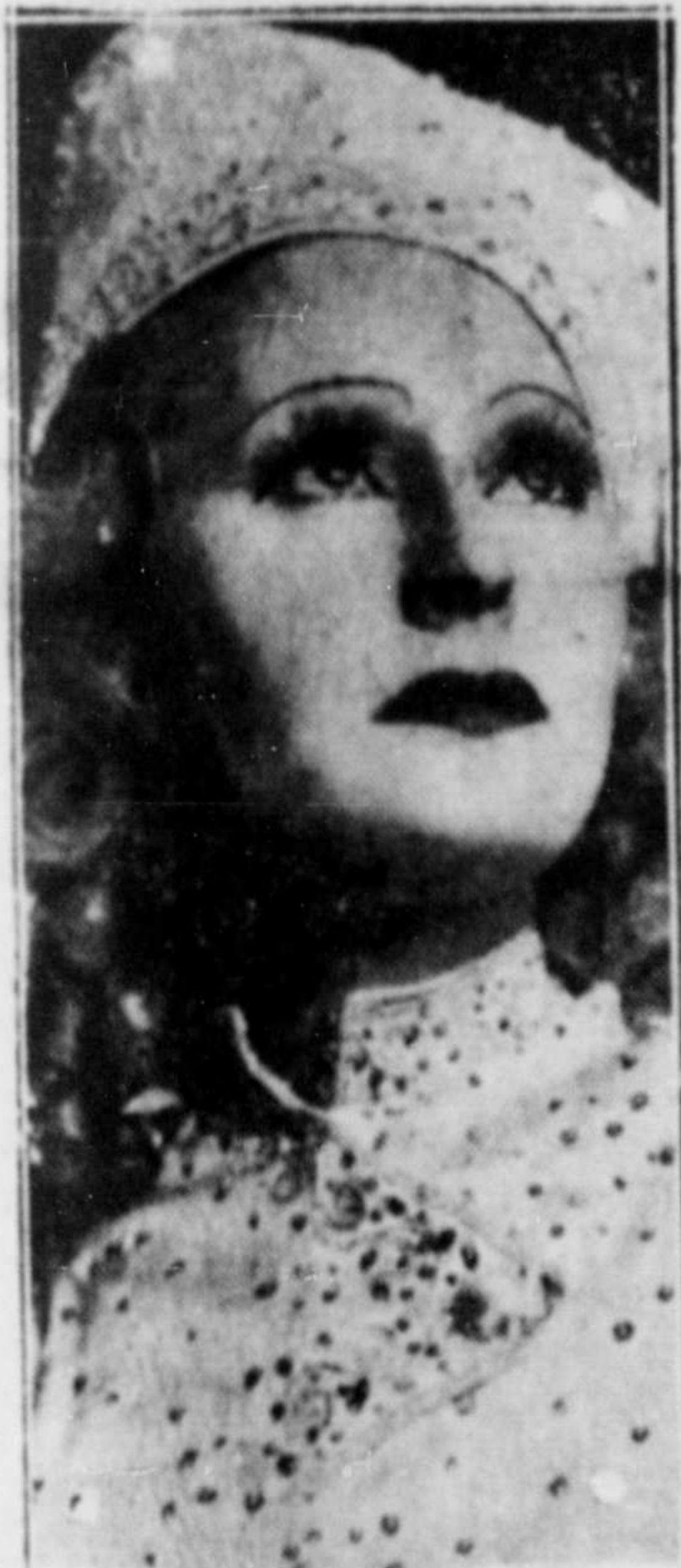
Late picture of famous Swedish screen star.