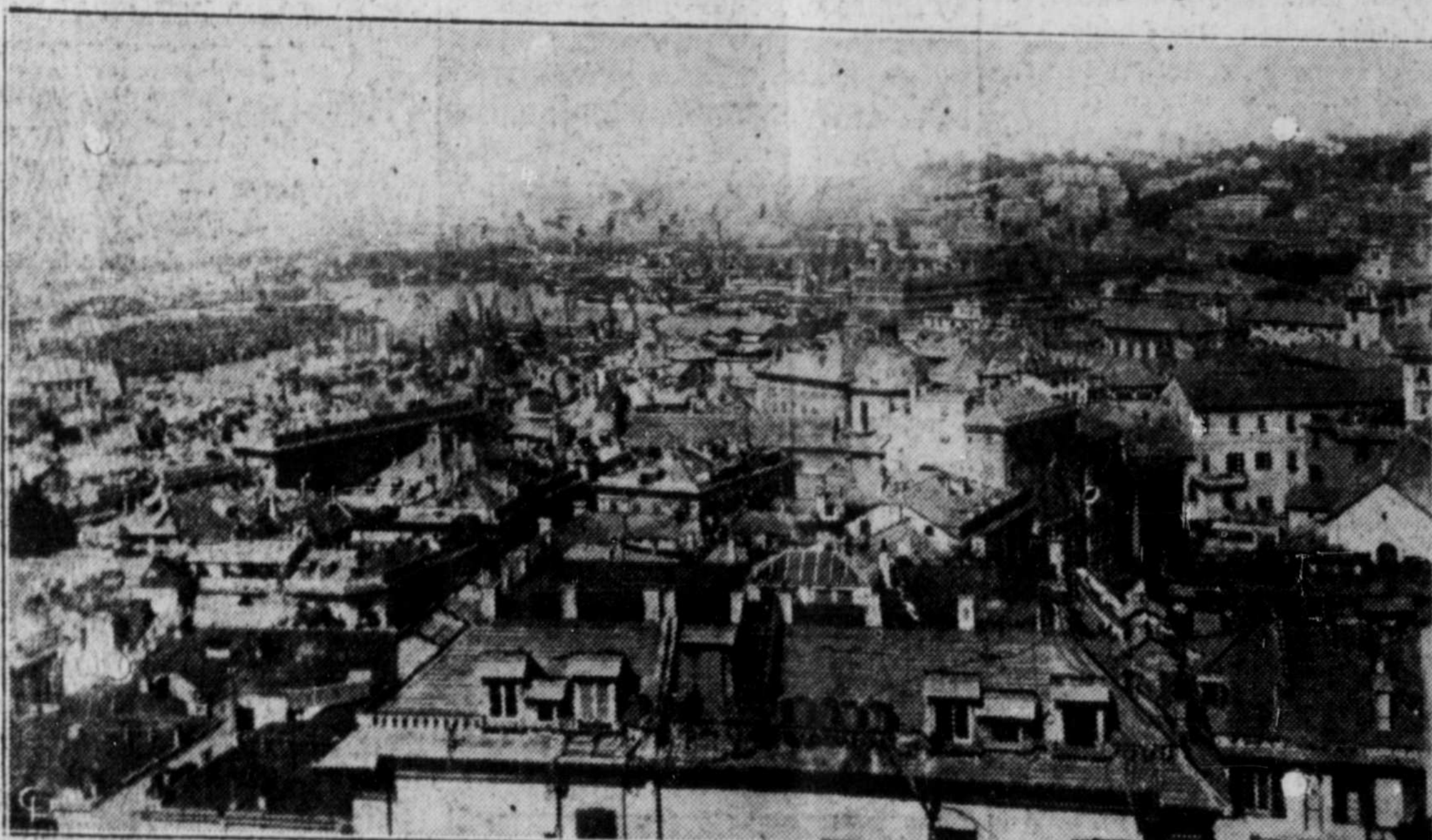
View of the historical seaport city of Genoa, in northern Italy, which was swept by a devastating tidal wave, leaving an unknown toll of death and enormous property damage. Electrical power plants were smashed, putting the city in darkness. Houses were blown apart by the terrific gale which carried the huge wall of water down upon the city. Ships being loaded with war supplies for Africa were torn from their moorings and crushed against the piers. Troops and black-shirts rushed to the city, searched the debris with torchlights for victims throughout the night.