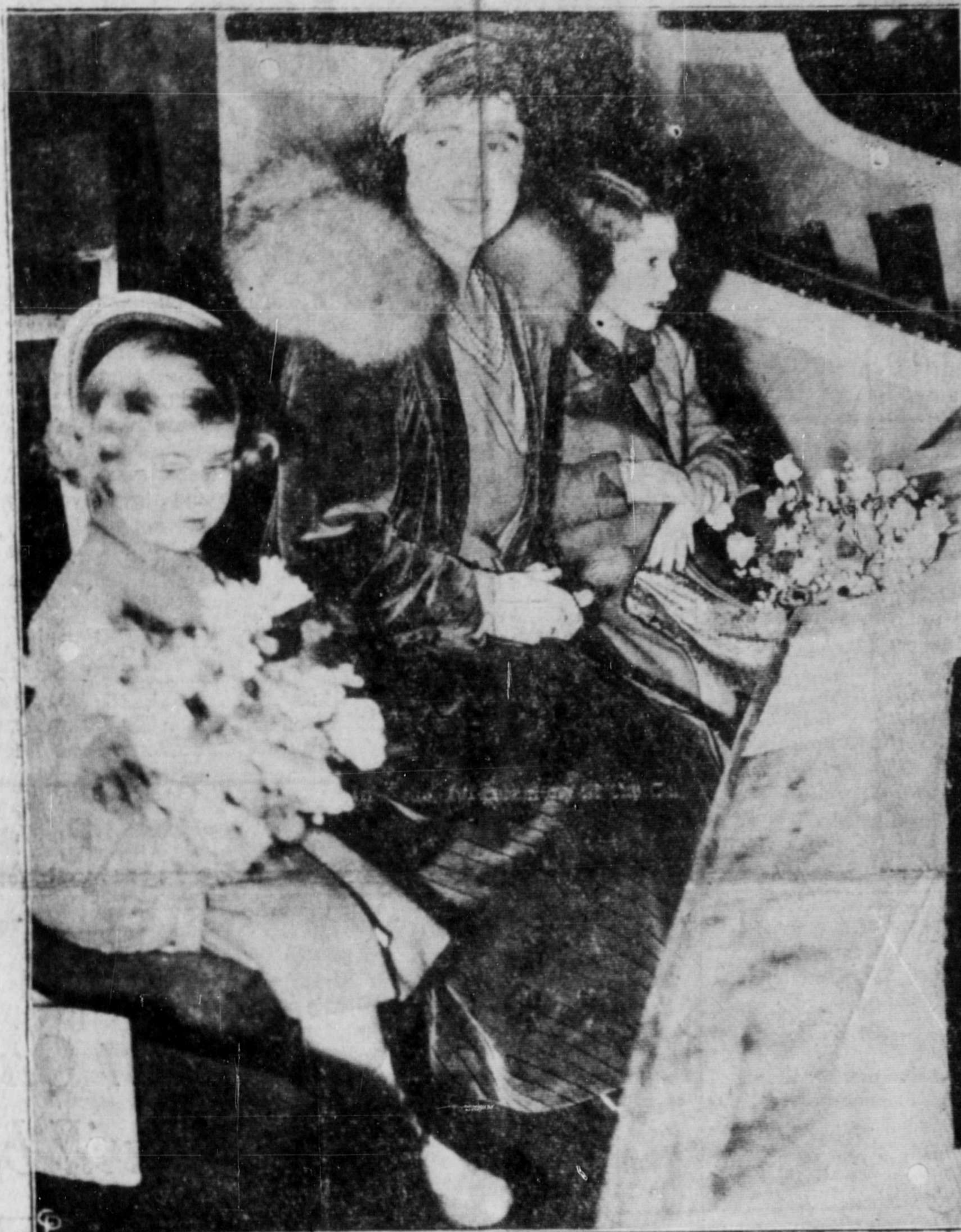
Here is a charming study of H.R.H. the Duchess of York and T. R. H. Princess Elizabeth and Princess Margaret Rose as they attended a concert at Royal Albert Hall, London. Princess Margaret Rose is nearest camera.