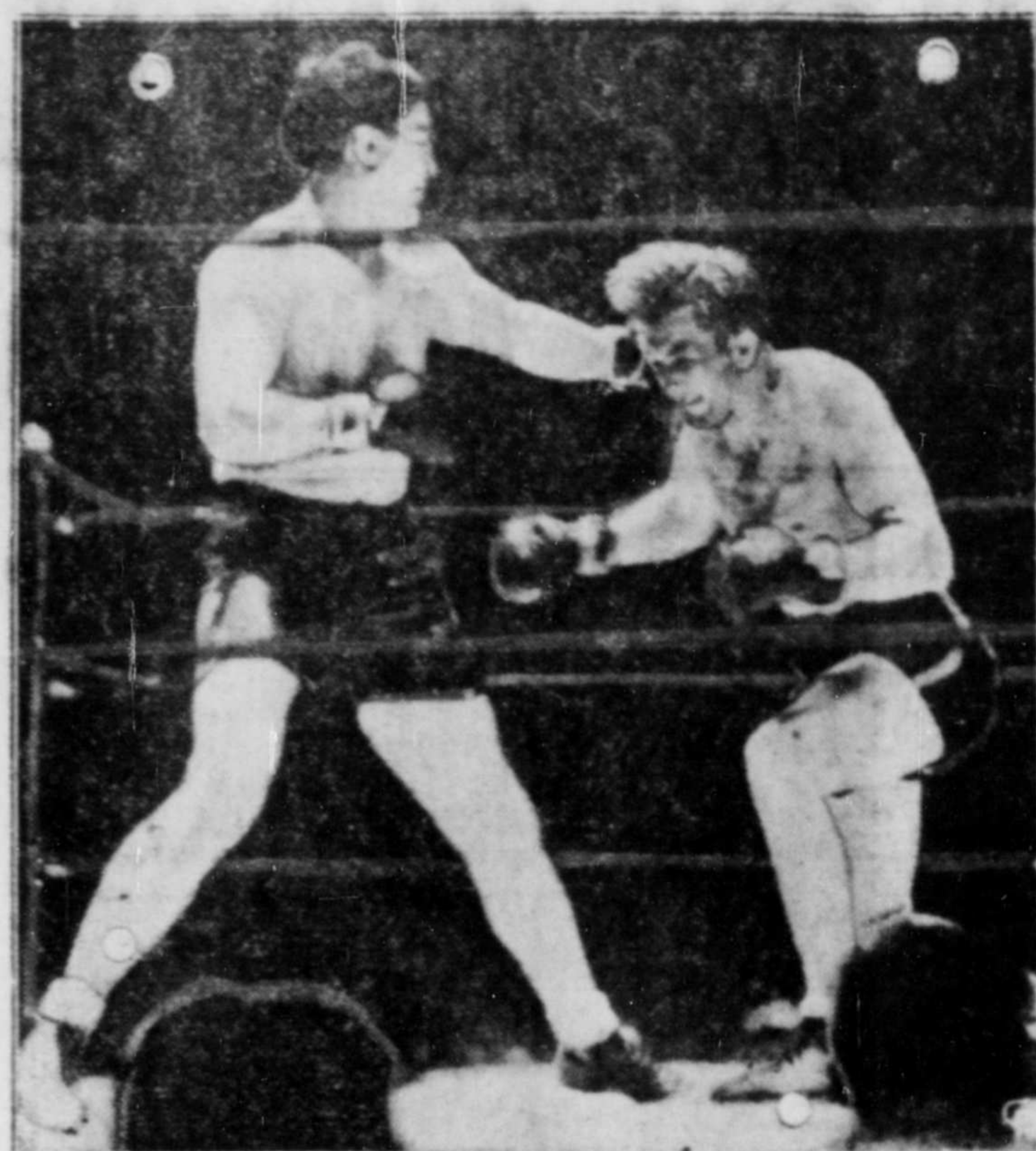
Walter Neusel, German heavyweight contender, down in a bout with Tommy Loughran.