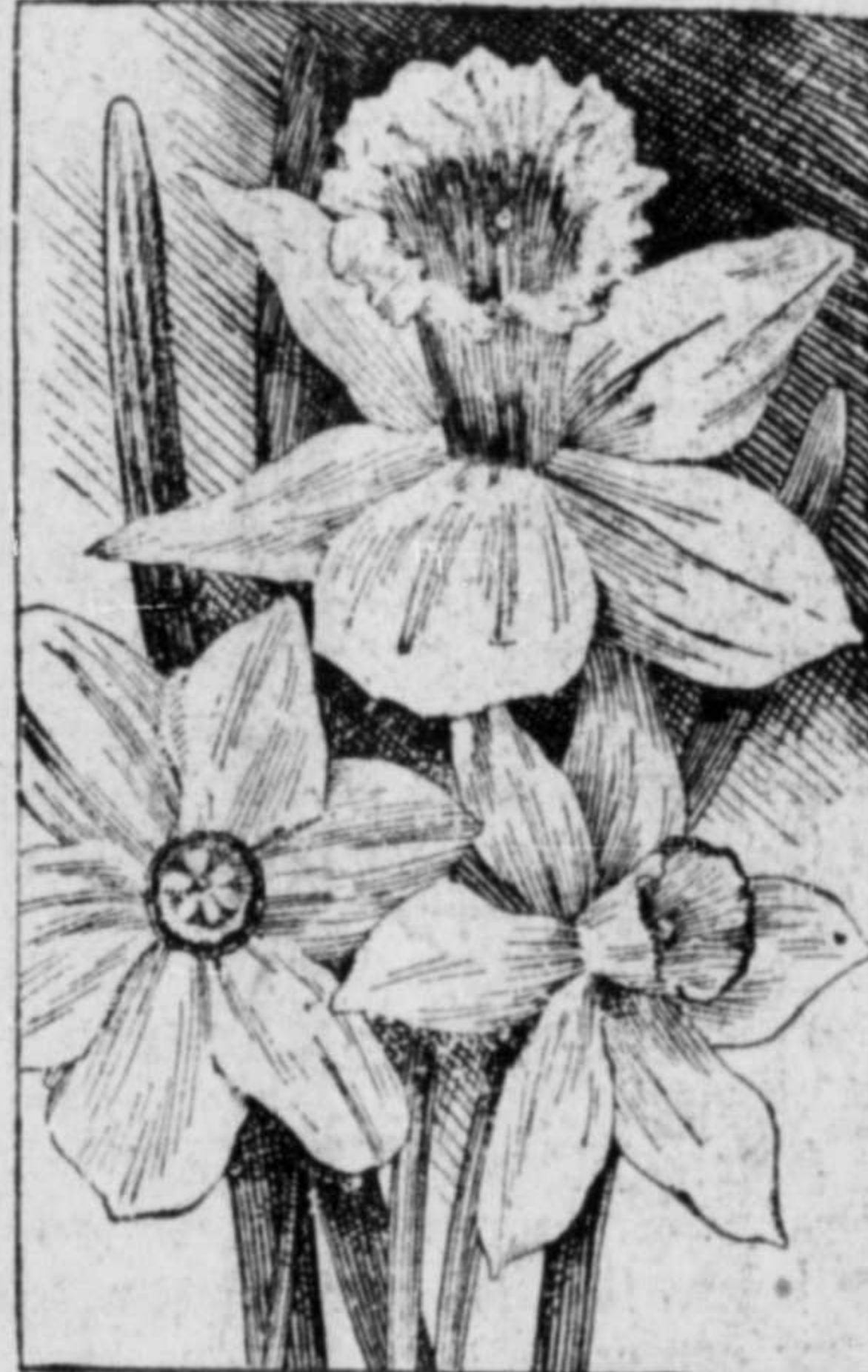
Excellent flowers for display or early cutting.

bowls or glasses. While it is late to expect bloom by Christmas, depending upon what heat is given them, they will be available before winter is over if planted at once. Crocuses planted in a bowl of moss give a very nice effect.