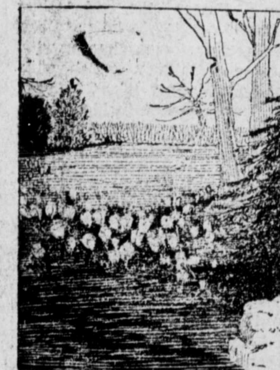
Crocuses growing in lawn before grass is cut.

planted just as they were found on the ground. Of course that would not do for formal beds but in gardens where an attempt is made to secure a natural landscape feature, straight rows should be avoided.