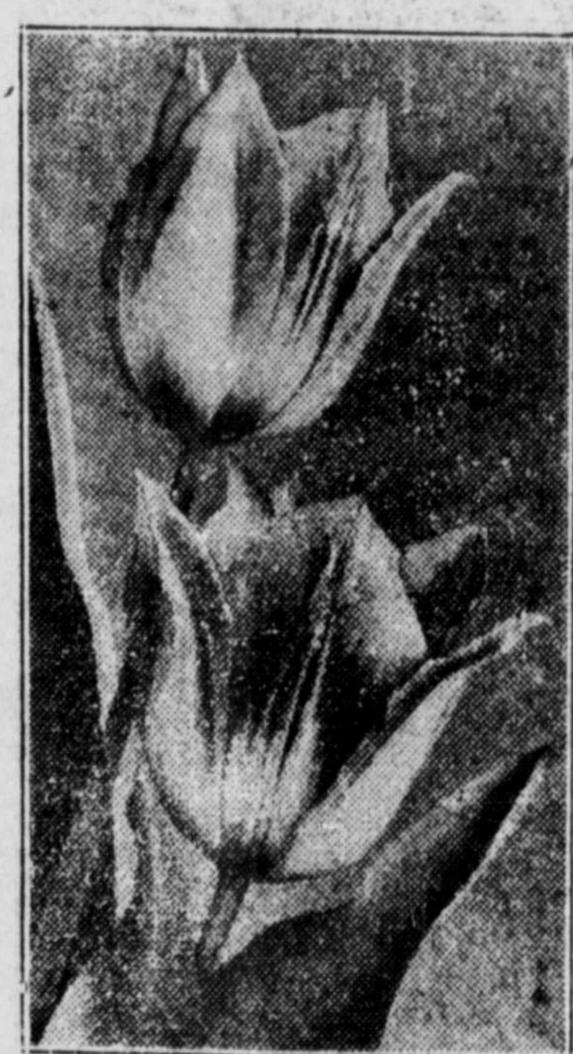
Planted now, the garden will be gay with color in the spring.

ferred to the more formal flower. The chief objection to the Romans is that they are expensive. Evidently there is a great demand for