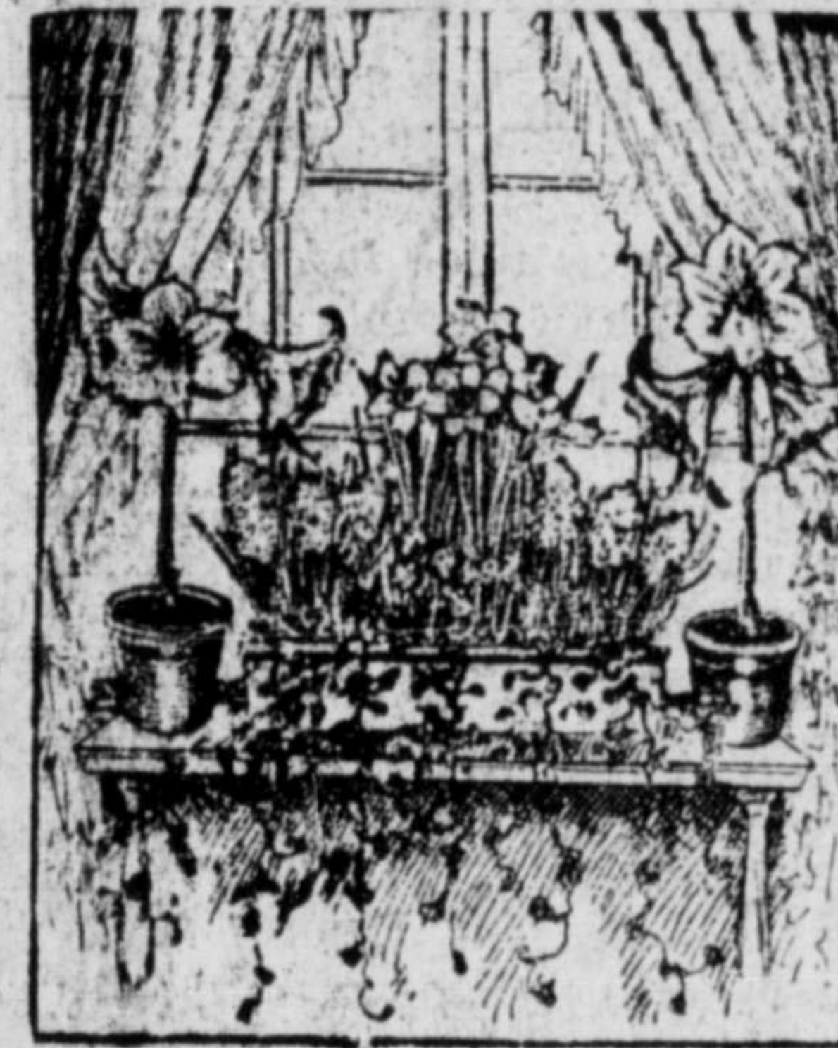
Hyacinths, lilies of the valley, daffodils, ivy and a large aramylis at each end.

in rows than in such a way as to give the flowers a natural appearance. Nature abhors straight lines. I have seen a number of pictures lately where the tulips looked as if the bulbs had been thrown a bowlful at a time and had been