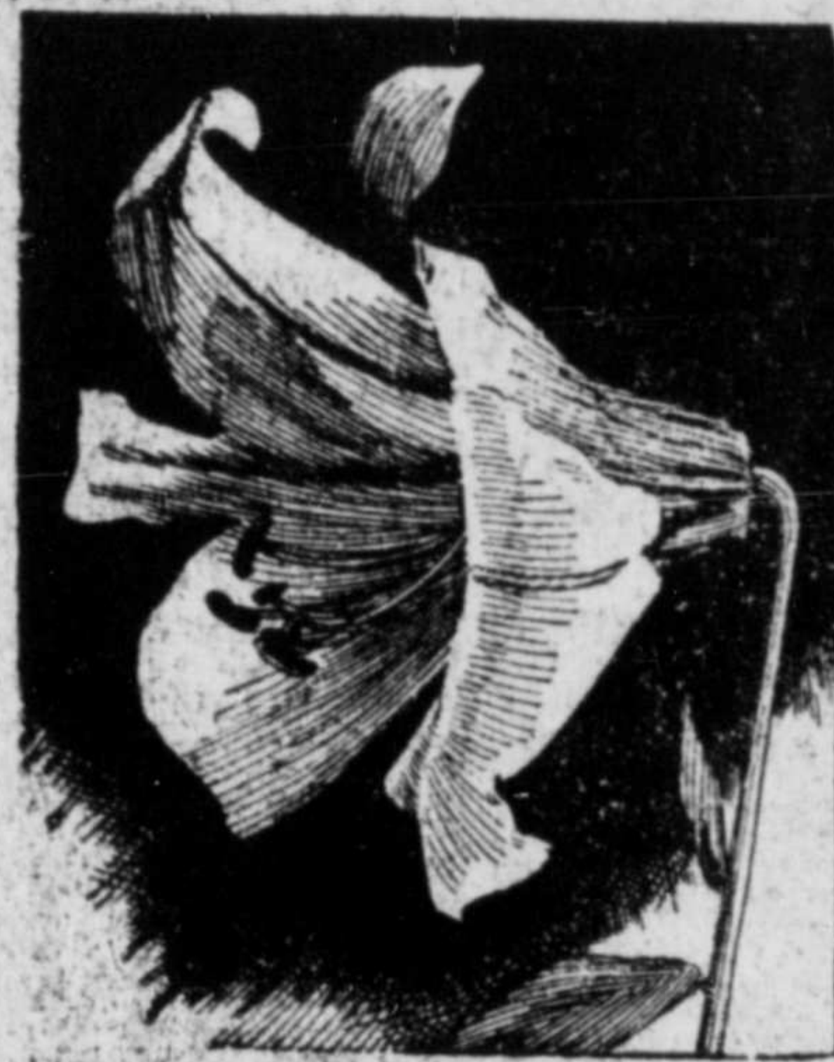
One of the most beautiful and most easily grown of the lilies.

planting of tulips, daffodils, narcissi, crocuses or lilies. The difficulty is to get a time when the soil is dry enough to cultivate.