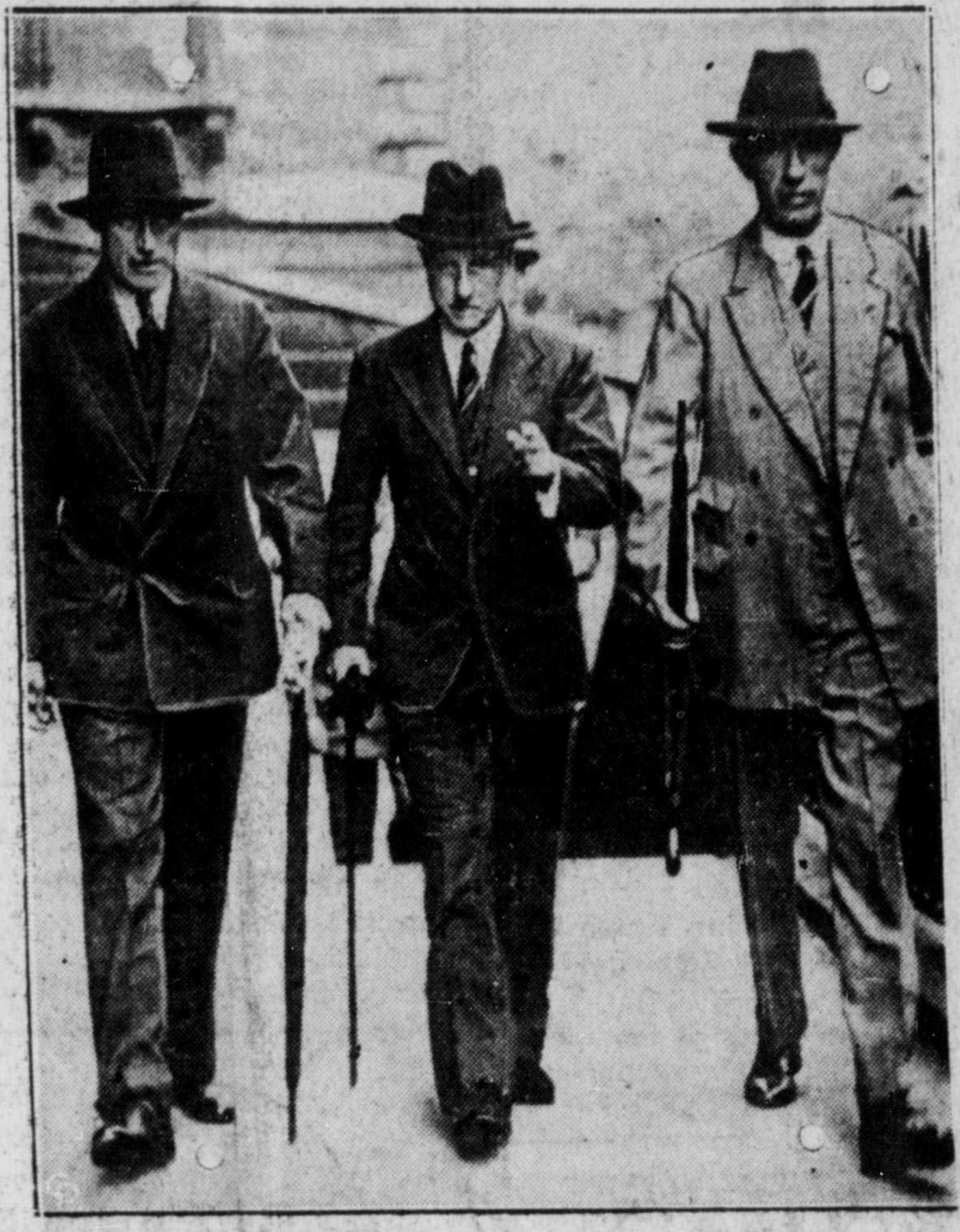
Sir Phillip Cunliffe-Lister, secretary for air; Sir Samuel Hoare, foreign secretary, and Lord Halifax, secretary for war, shown (left to right) as they arrived at No. 10 Downing Street, London, the residence of the premier, for an emergency cabinet session necessitated by the Italo-Ethiopian crisis. Not the grave demeanor of all three men.