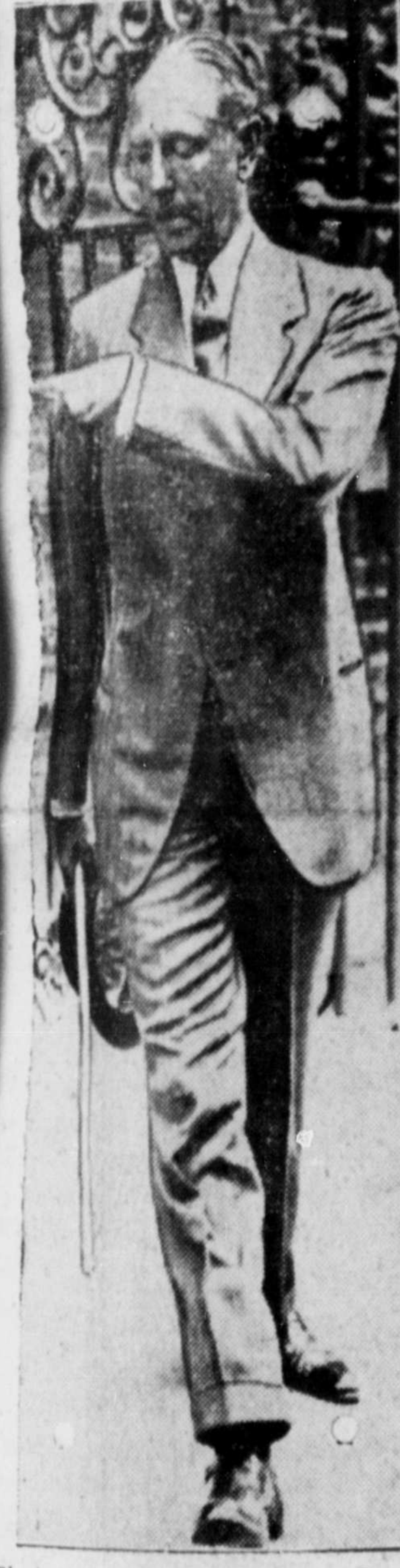
Photo shows Sir Bolton Eyres-Monsell, first lord of the admiralty, as he left No. 10 Downing St. after a five-hour emergency meeting of the 22 members of the British cabinet on the Ethiopian question.

Geneva Hears That Italy Intends to Give Sharp Retort To Sir Samuel Hoare's Statement—May Mean War If Sanctions Exercised—Aggression Will Not be Tolerated