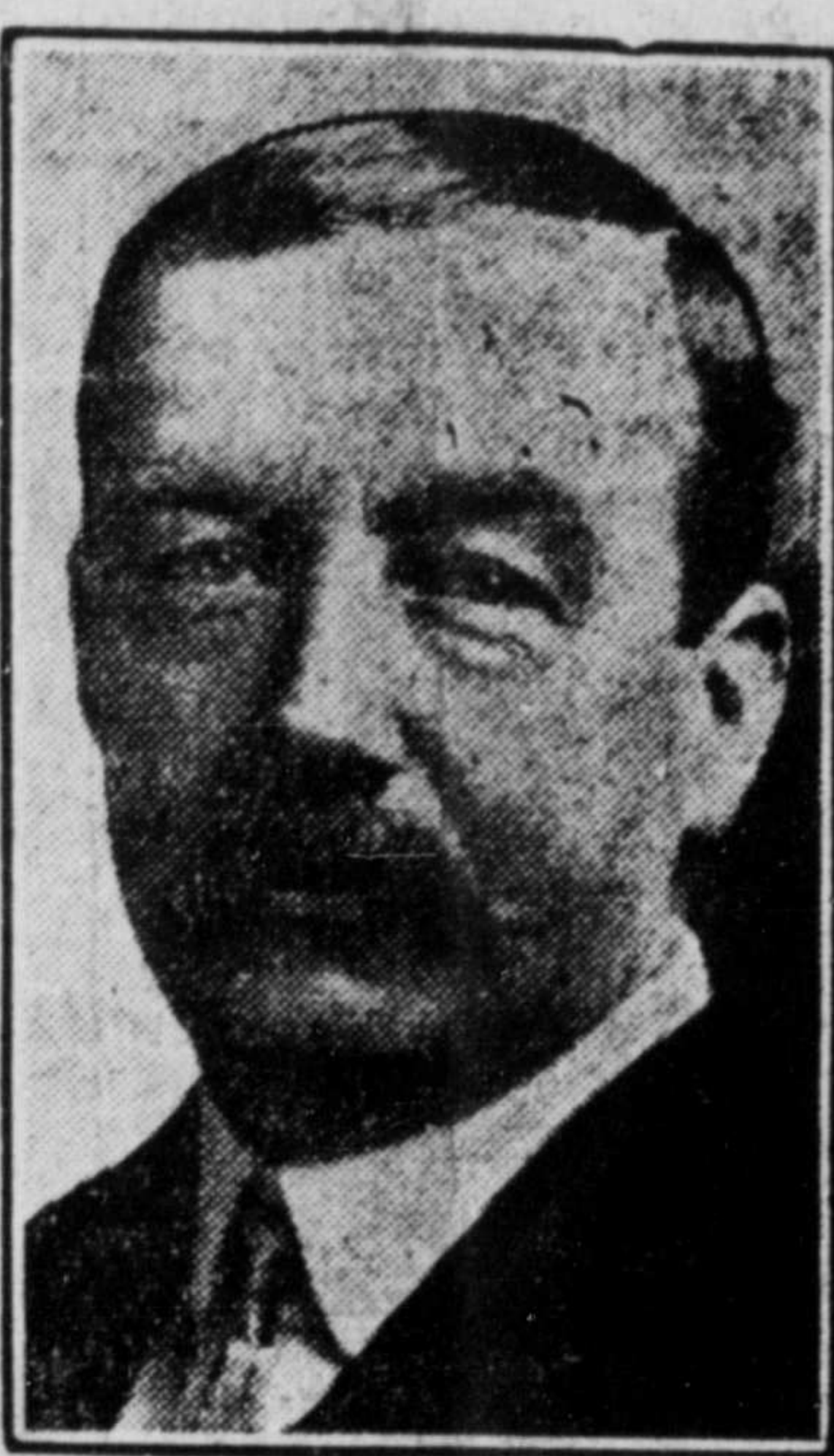
RT. HON. ARTHUR HENDERSON

LONDON, Oct. 18.—Having steadily lost strength following an operation in September, Rt. Hon. Arthur Henderson, former leader of the British Labor Party and former president of the Disarmament Conference, was reported early this morning to be in a critical condition.