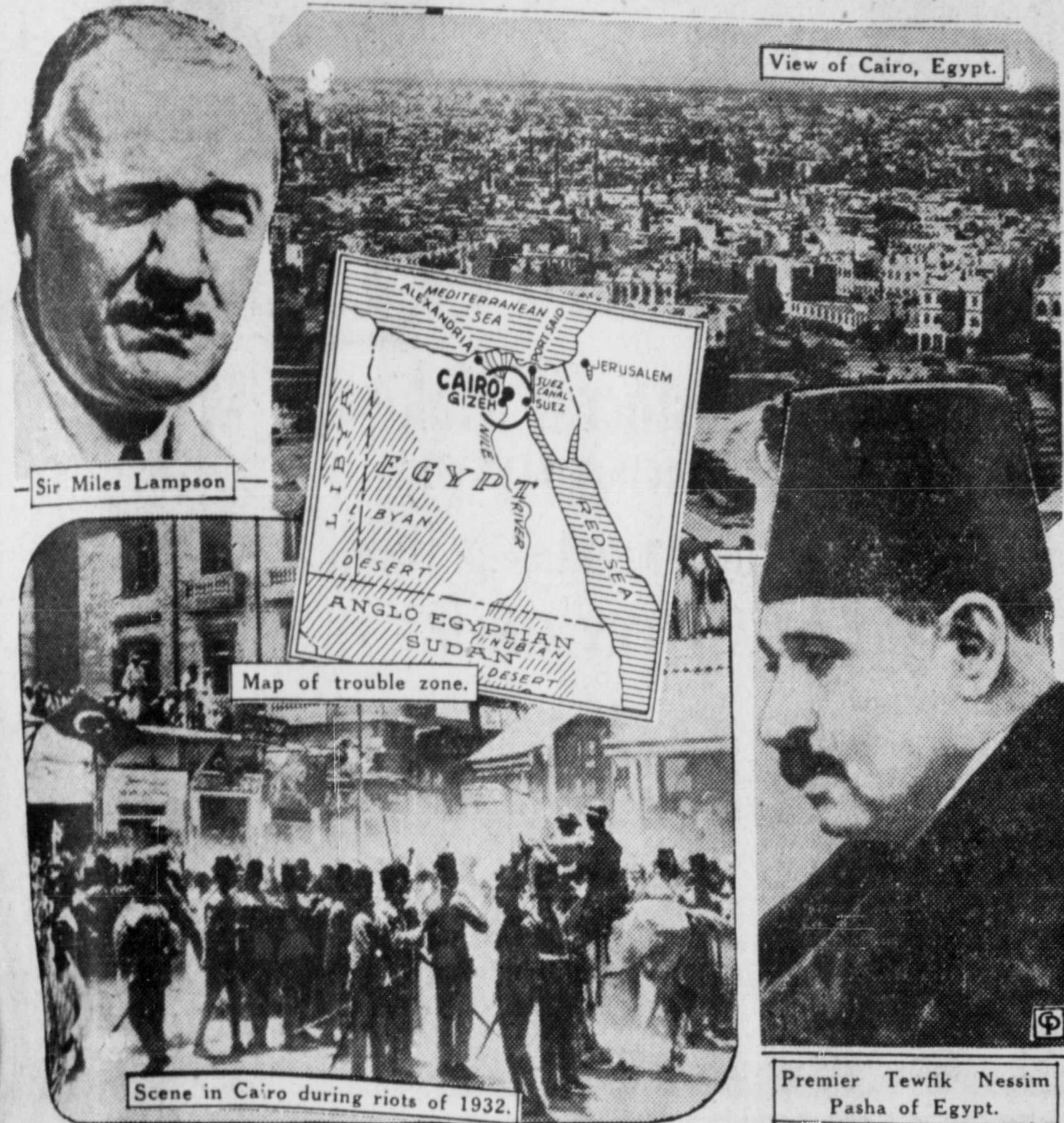
Anti-British rioting that broke out in and about Cairo, Egypt, developed a political situation which had in it grave possibilities for England. It was reported that Premier Nessim Pasha resigned his post following a mass meeting of the Wafd party, Egypt's independence organization. The wafdists, comprising 90 percent of the electorate, have resolved to push a nationwide boycott of everything British in protest against Britain's refusal to give Egypt a constitution. Sir Miles W. Lampson is the British High Commissioner for Egypt and the Soudan.