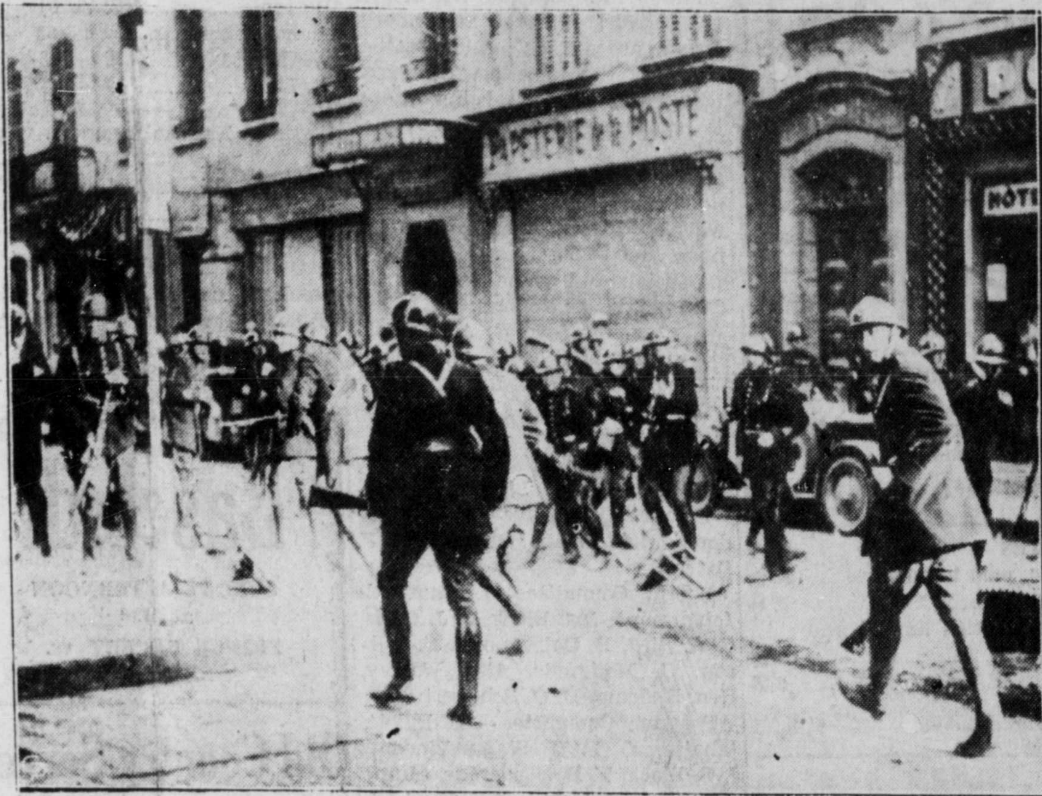
Two were killed at Toulon, France, in the ensuing riot after French navy yard workers staged a walk-out in protest against the recent wage slashes. France's guard mobile, is shown charging the strikers. Notice the chairs that had been hurled at them, still lying in the street.