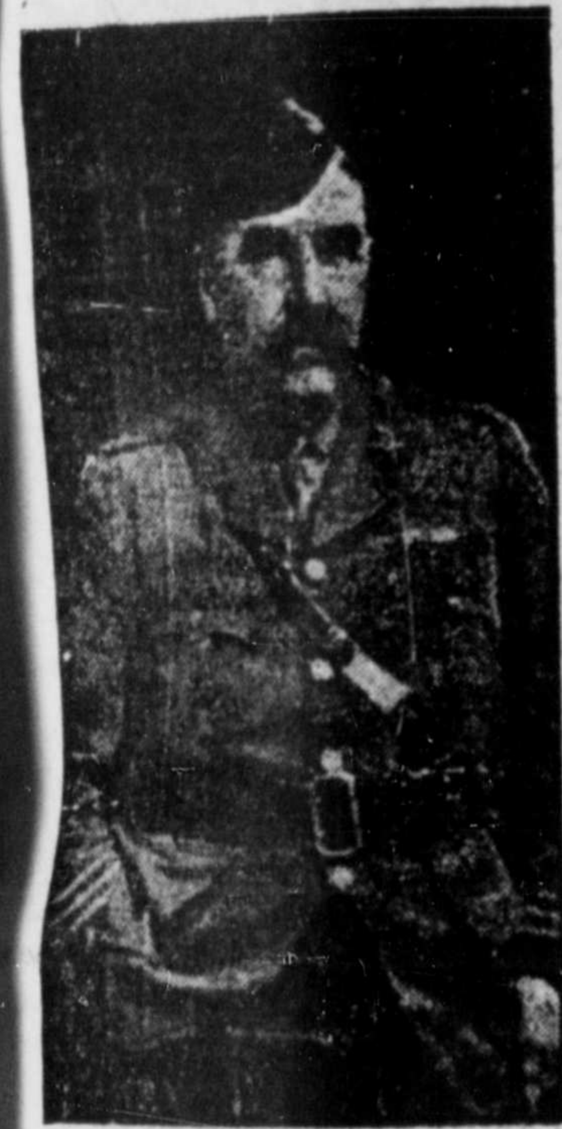
Well known former Prince Rupert Conservative candidate who is now supporting Liberal in the federal election campaign

Closes Deal Which Would Give Over Half of Area of Country to American Concern—England In It Too—Mussolini Wil Not Be Turned Aside