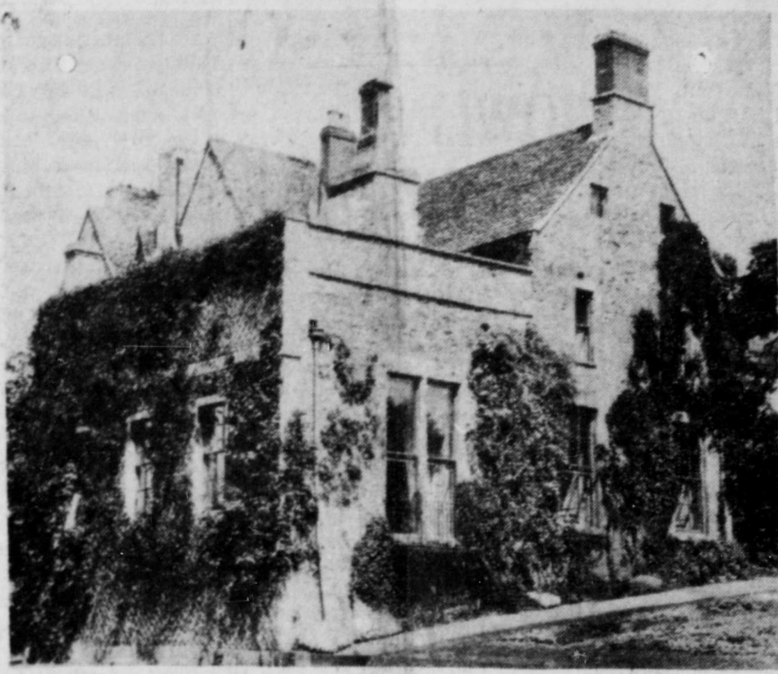
Buchan's Beautiful English Home