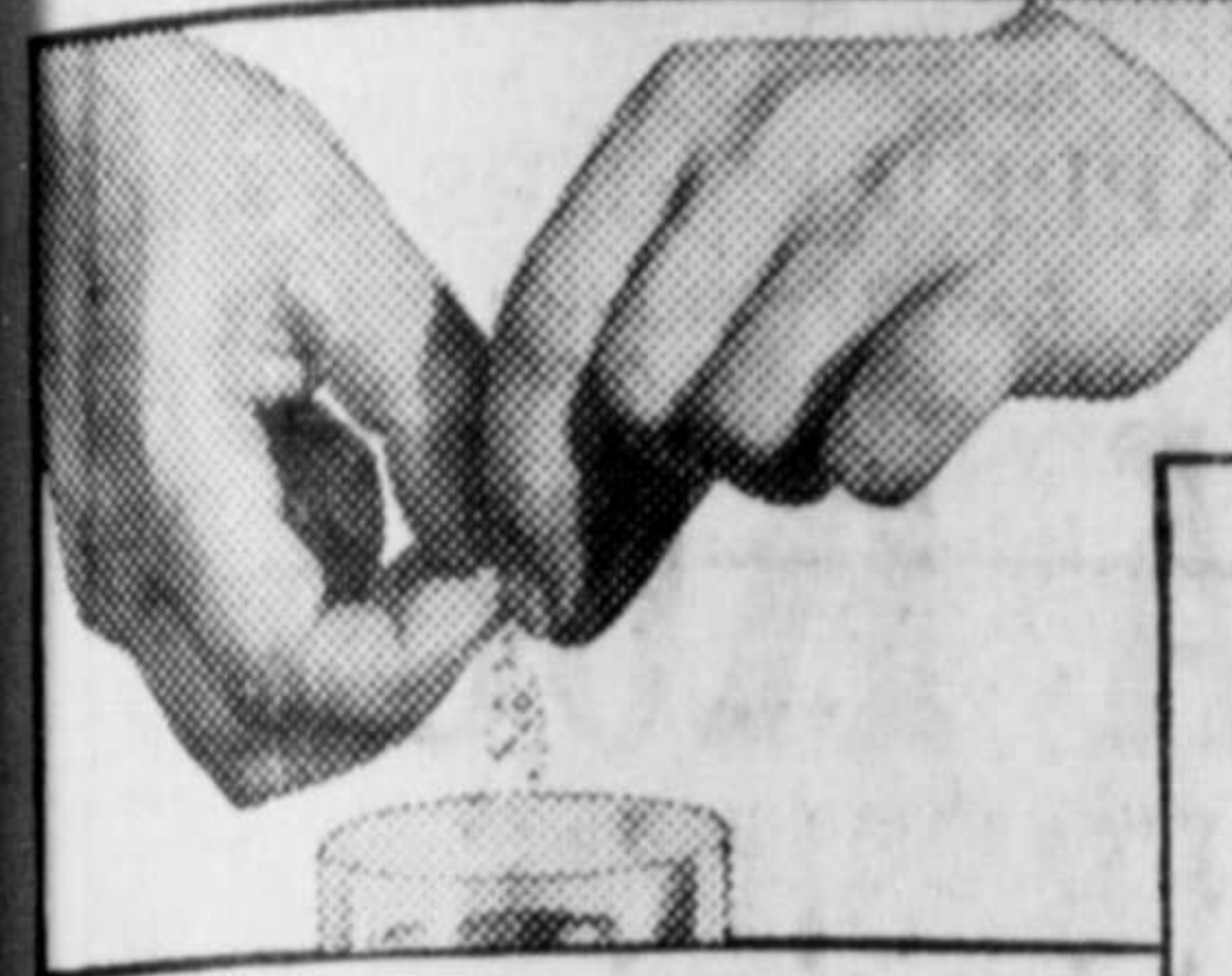
1. Crush and stir 3 "Aspirin" tablets in 1/2 glass of water.