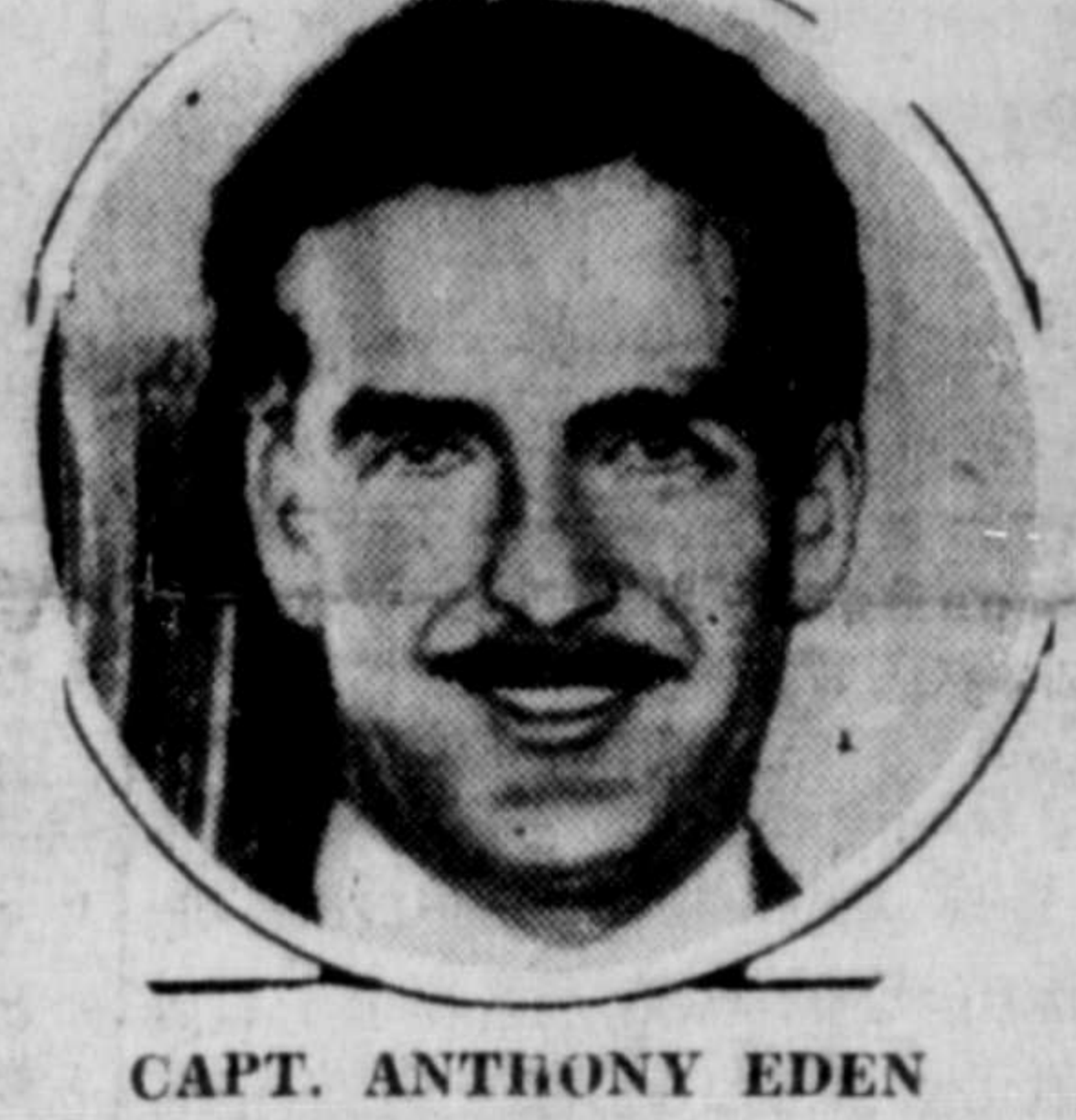
CAPT. ANTHONY EDEN

In reference to the limitation of armaments, Great Britain would not agree, the Foreign Secretary said, to stabilizing armaments, giving permanent advantage to a country which has concentrated on the most extensive rearmament. Great Britain also favored publicity for armament expenditures, Captain Eden added.