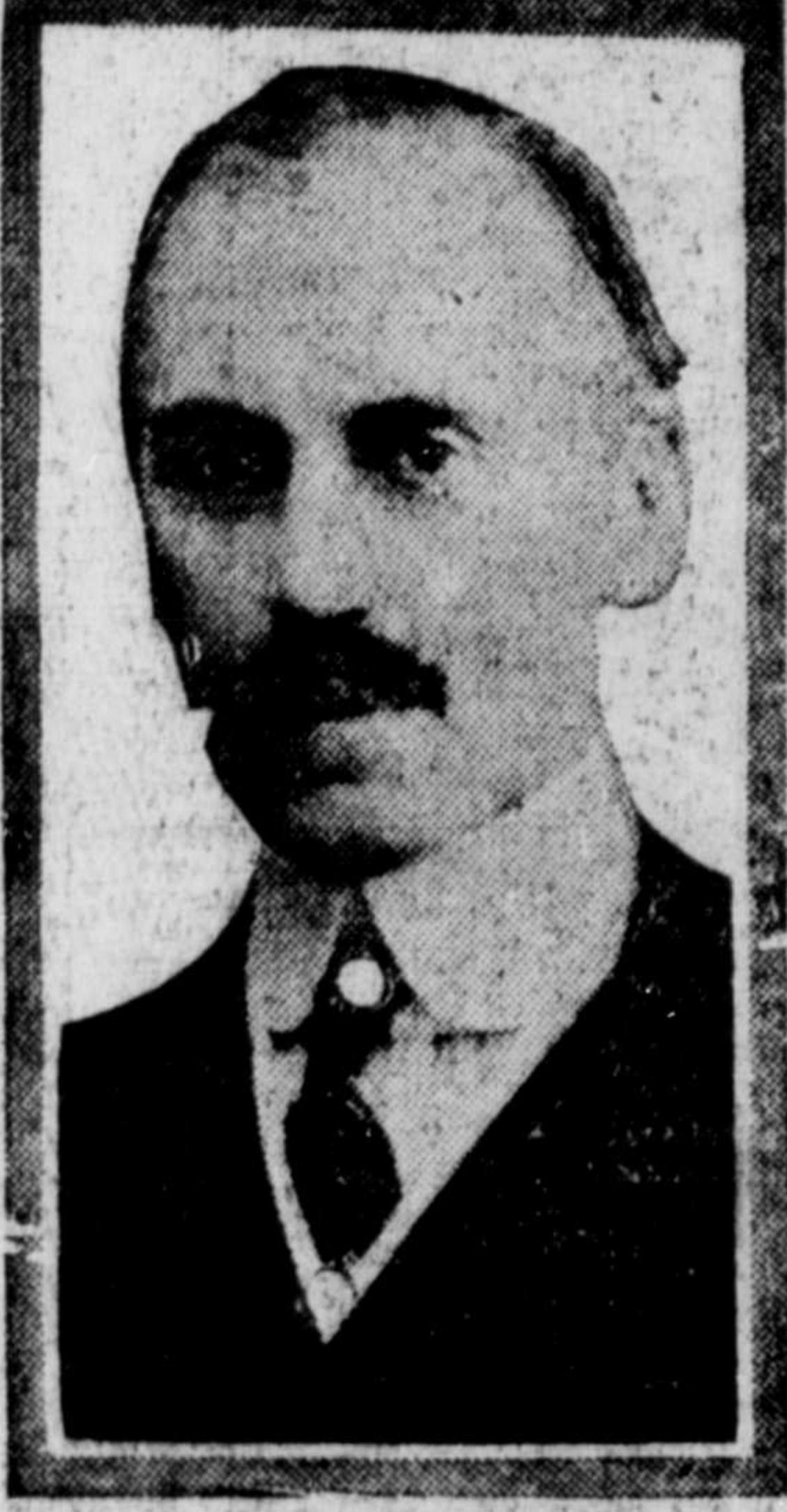
HON. N. W. ROWELL

TORONTO, Sept. 25:—Newton Wesley Rowell K.C., for many years prominent in public life and one of the province's most distinguished barristers, has been appointed to the bench of the Supreme Court of Ontario.