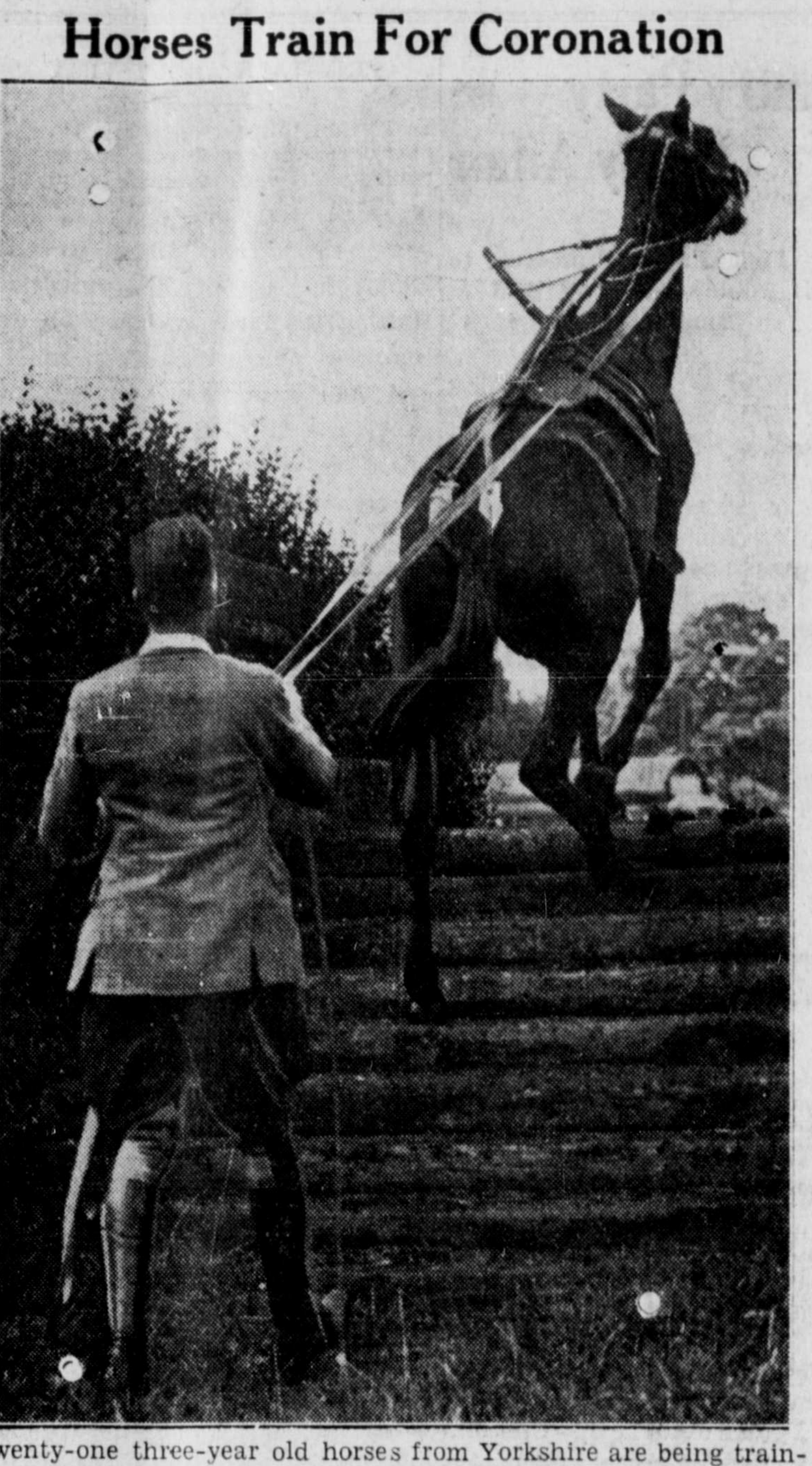
Horses Train For Coronation Twenty-one three-year old horses from Yorkshire are being trained at the Police Riding School, at Imber Court, Surrey, headquarters of the mounted branch of the Metropolitan Police Force, for work in handling the enormous crowds expected at the coronation ceremonies of King Edward next year. Here is one of the horses mounting stairs under long rein control, a part of the training.