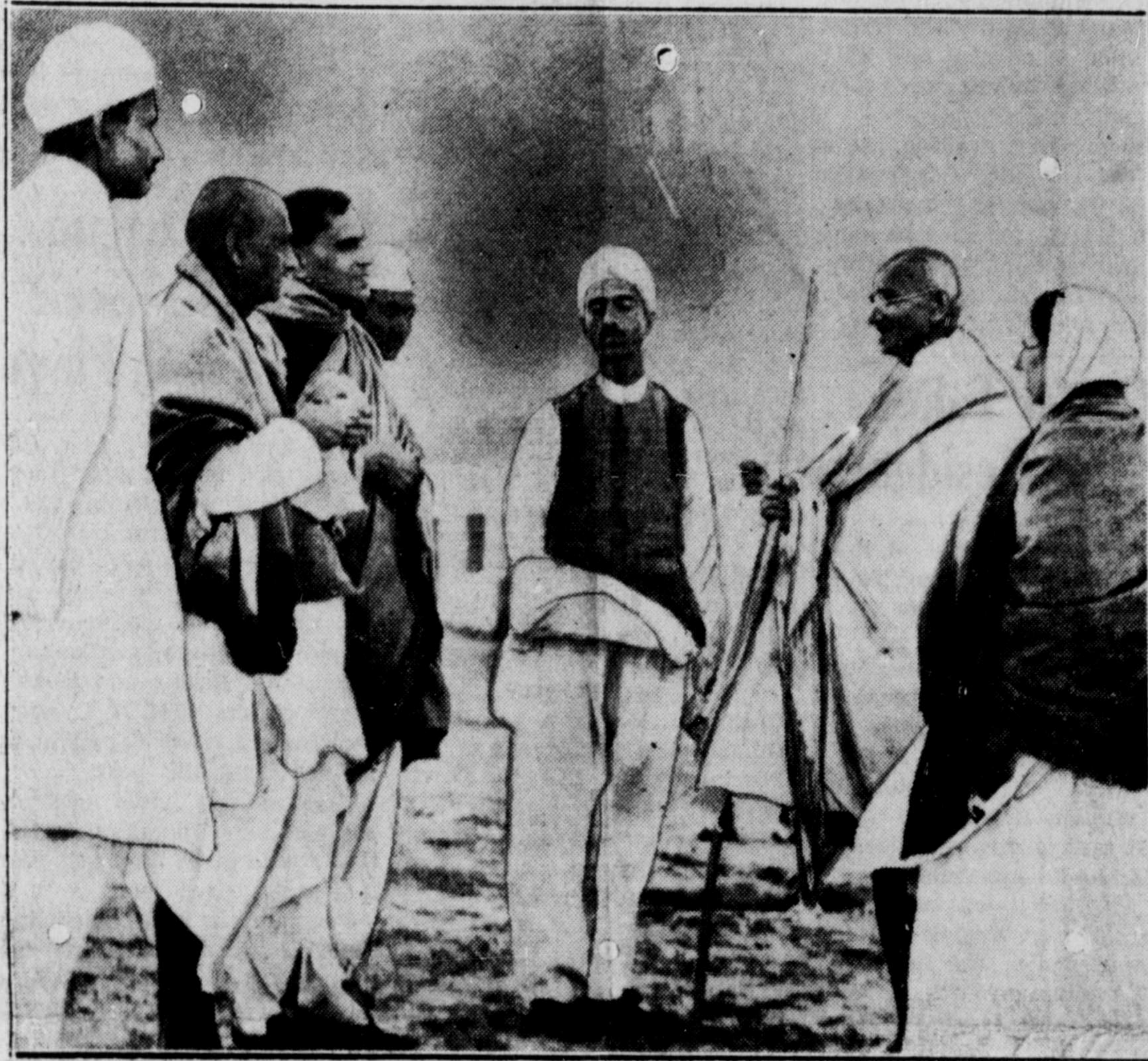
Mahatma Gandhi, who has been ill at Delhi, has recovered sufficient strength to enable him to resume his tours throughout India. He is shown here (right) talking with acquaintances.