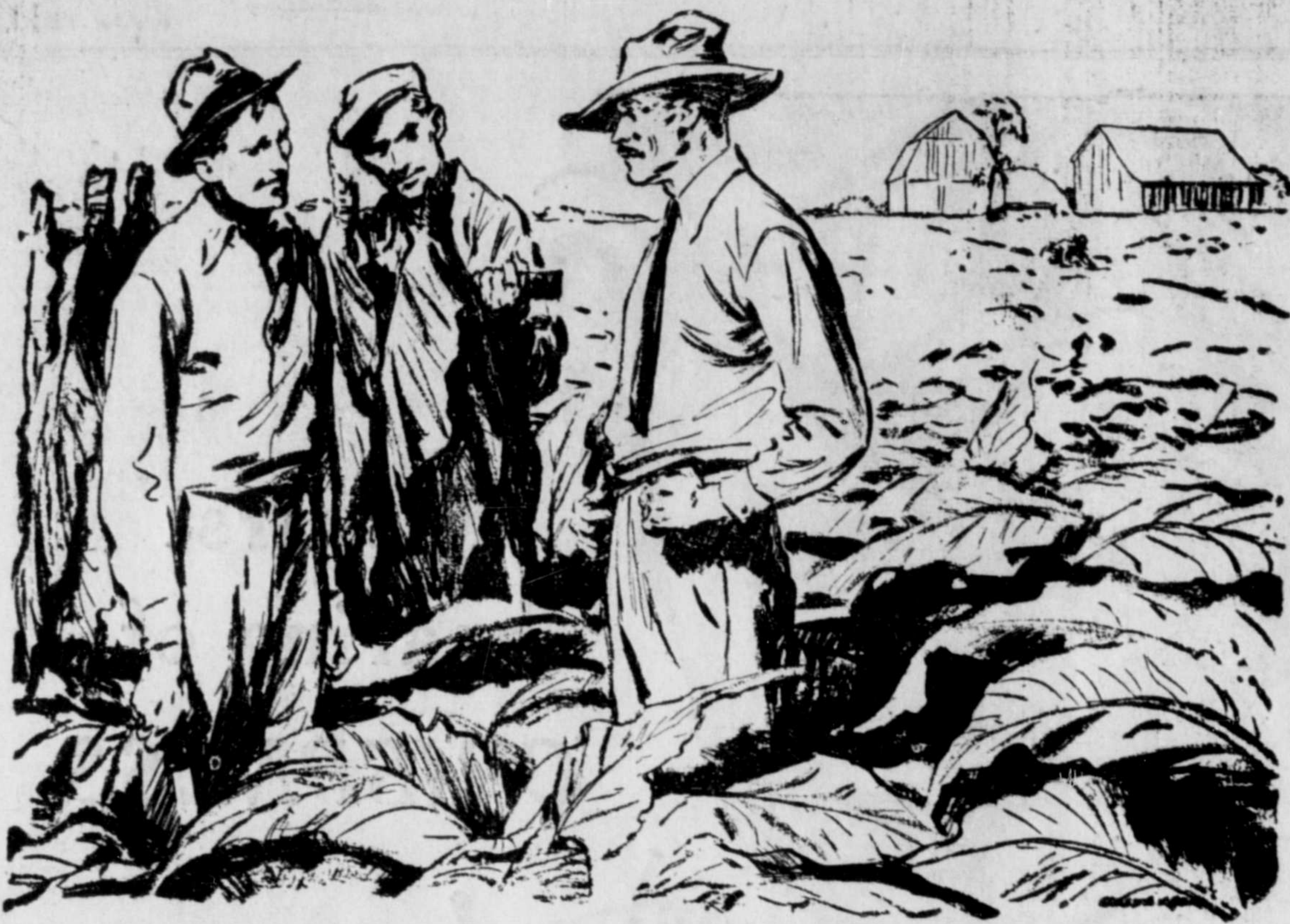
CANADIANS AND THEIR INDUSTRIES—AND THEIR BANK. TOBACCO GROWING.

TOBACCO FARM OWNER: "Henry, you and the other men are doing fine work and I hope you know I appreciate it."