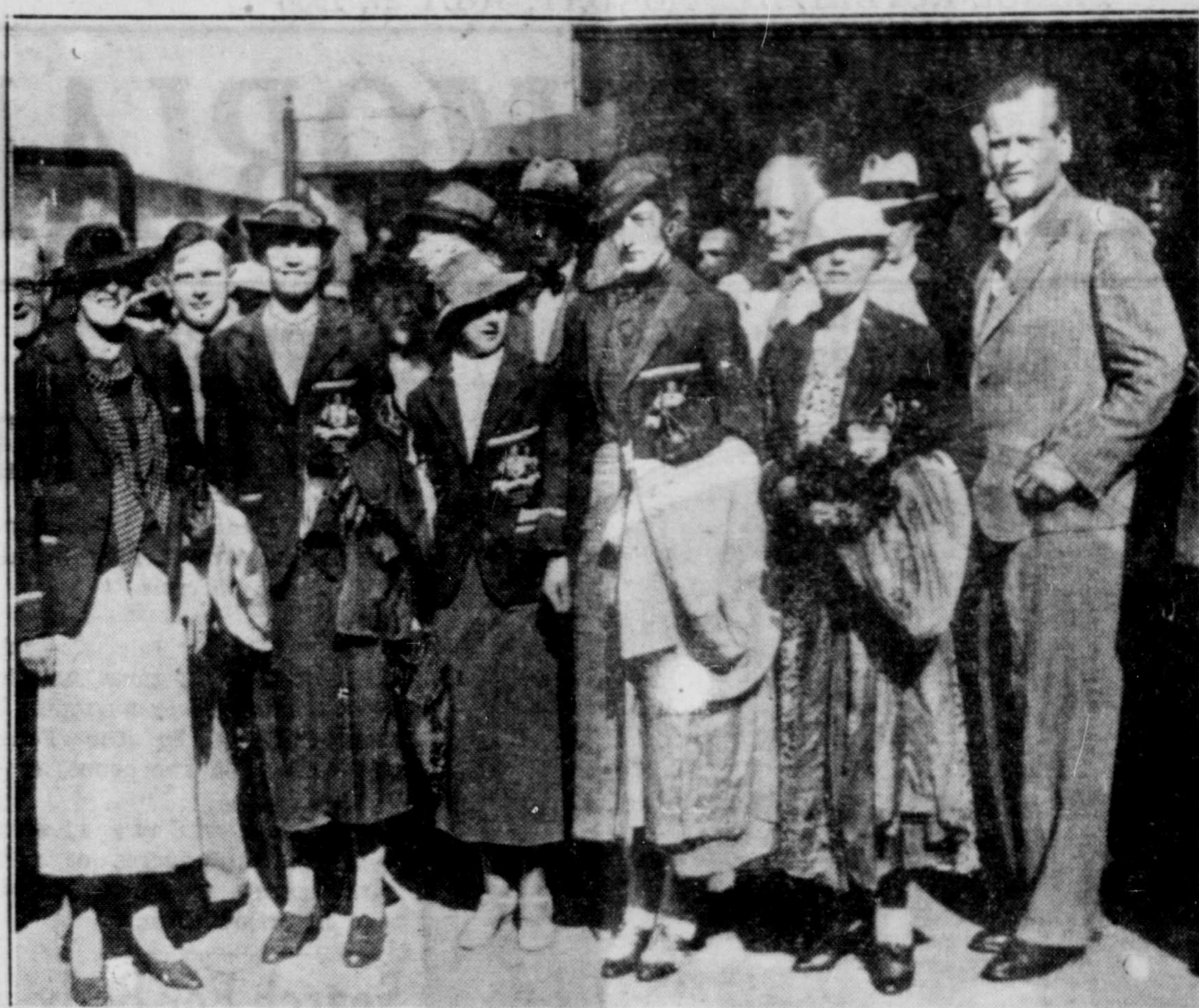
First complete athletic team from any nation to reach Berlin, scene of the 11th Olympic Games, was the Australian delegation, which arrived late in June and went direct to the Olympic village, where they will be quartered during the games. Women members of the team are shown here as they arrived at the German capital and were welcomed by games' executives. The Australians were far ahead of teams from other foreign nations.