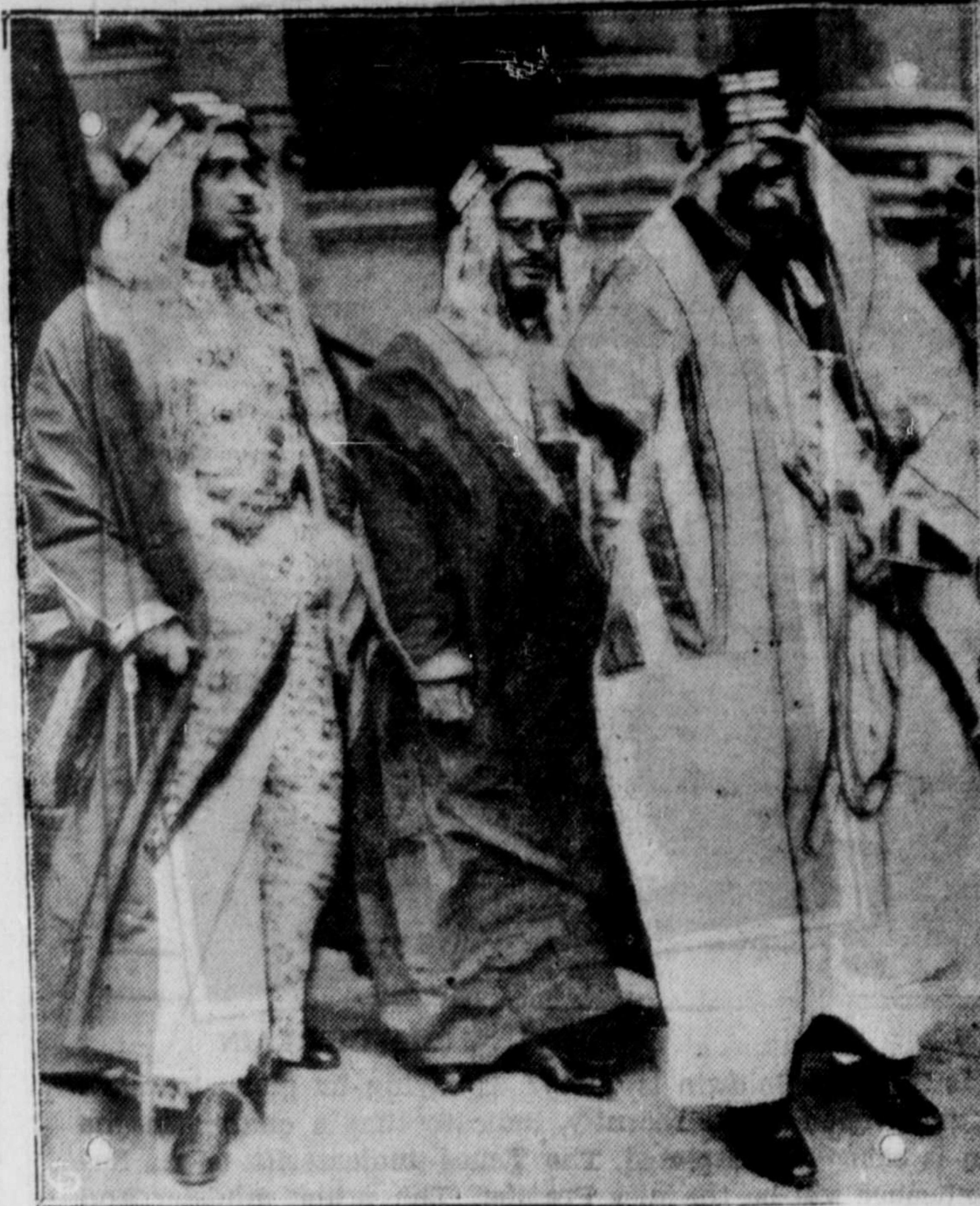
Sir Hamad Ibn Issa Bin Khakifa, ruler of Bahrien, Island of Pearls in the Persian Gulf, leaving the Hyde Park Hotel to make the first of a series of official calls; he is to be received by the King. His pearl fisheries, alone give him a royalty of million and a half a year.