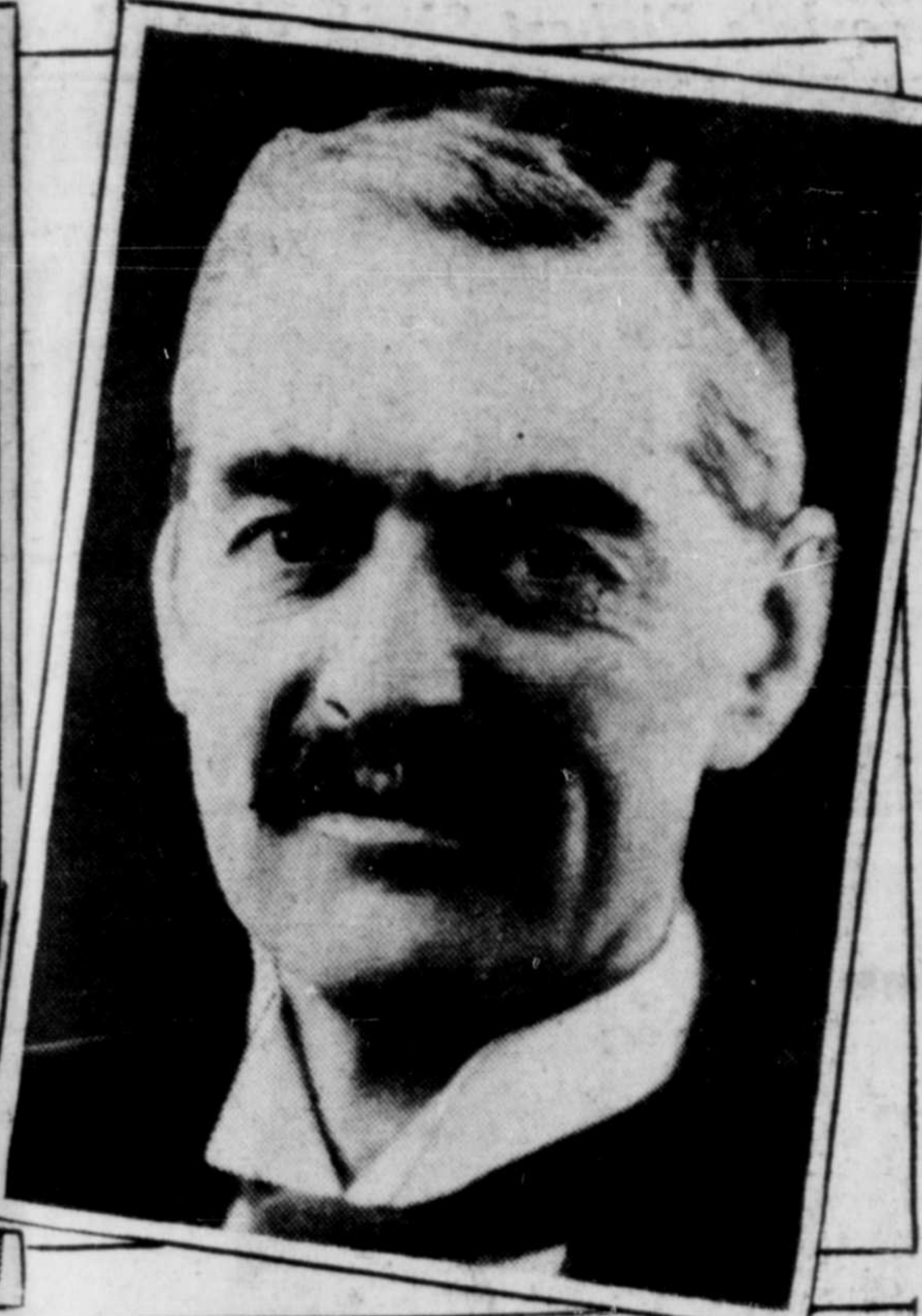
RT. HON. N. CHAMBERLAIN

Reports from England, in which Prime Minister Baldwin is quoted as saying he plans to retire soon, combined with an editorial in the London Times recently, indicate that a change in the leadership of the British government is being contemplated. The Times indicates Rt. Hon. Neville Chamberlain, chancellor of the exchequer will be the new Premier. The prime minister and the chancellor are shown above.