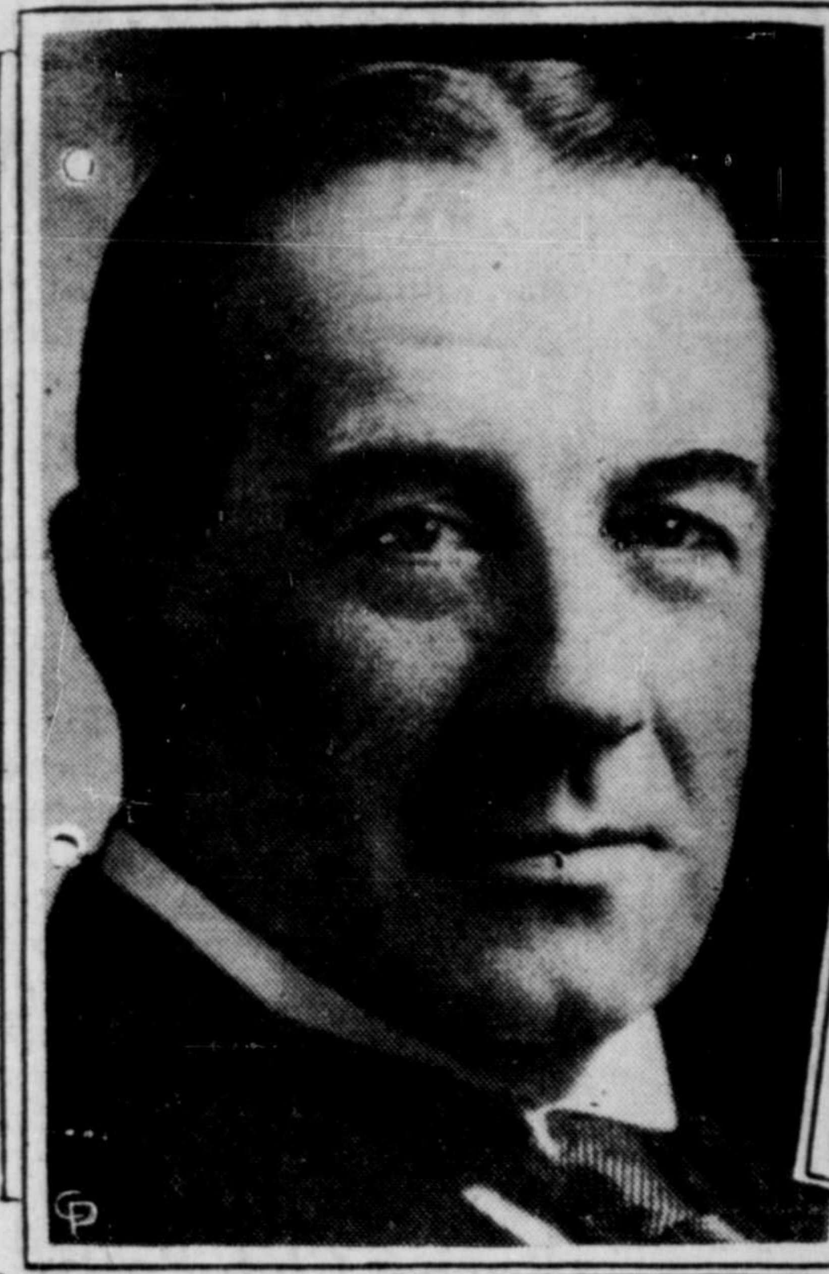
PRIME MINISTER BALDWIN