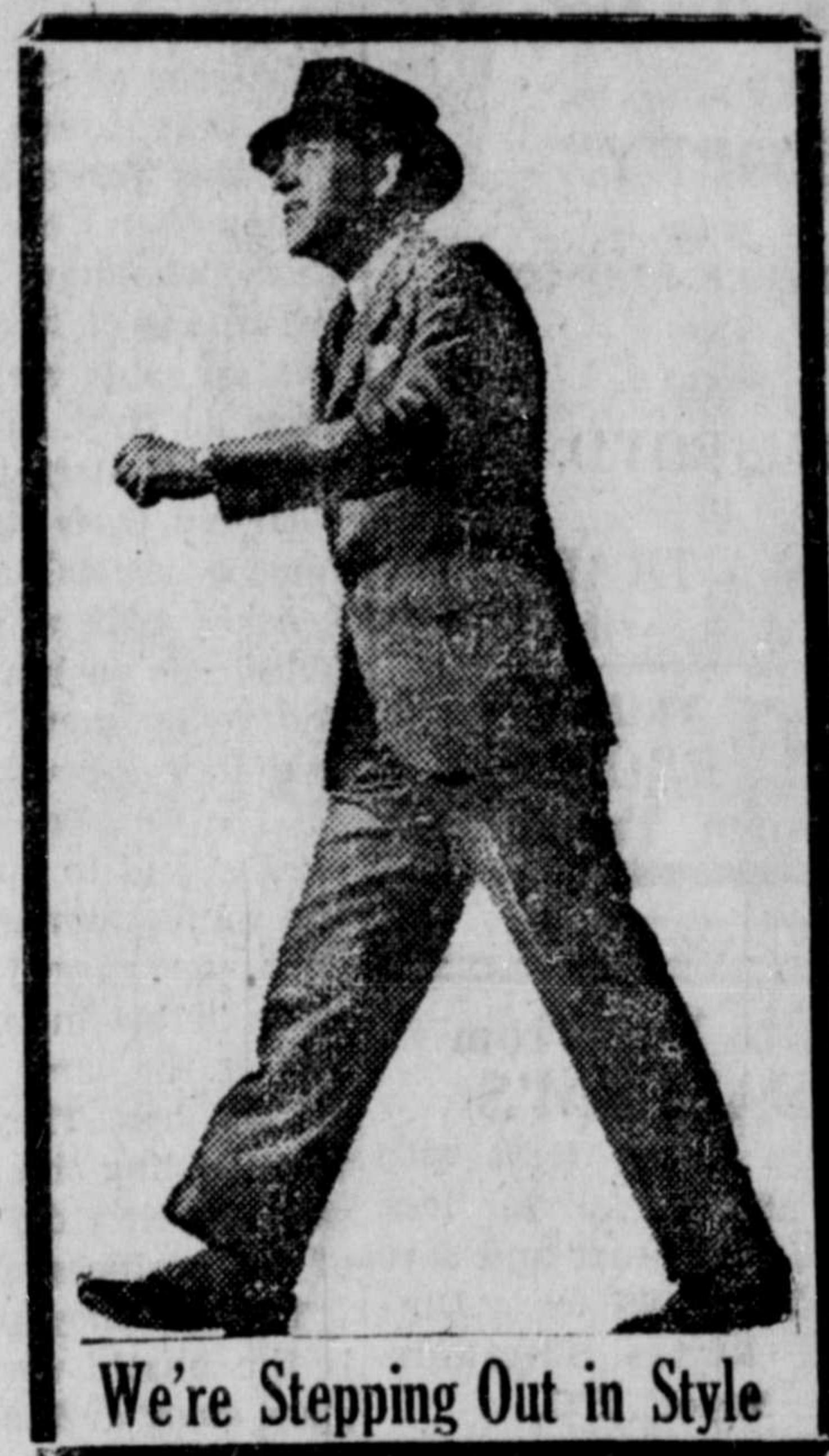
We're Stepping Out in Style

SALE STARTS Friday, August 21st at 9 a.m.