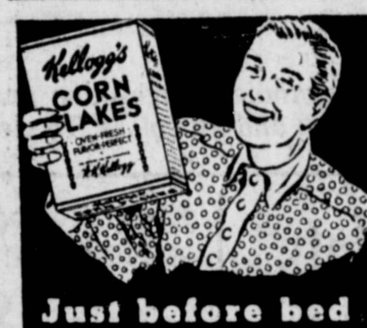
Just before bed