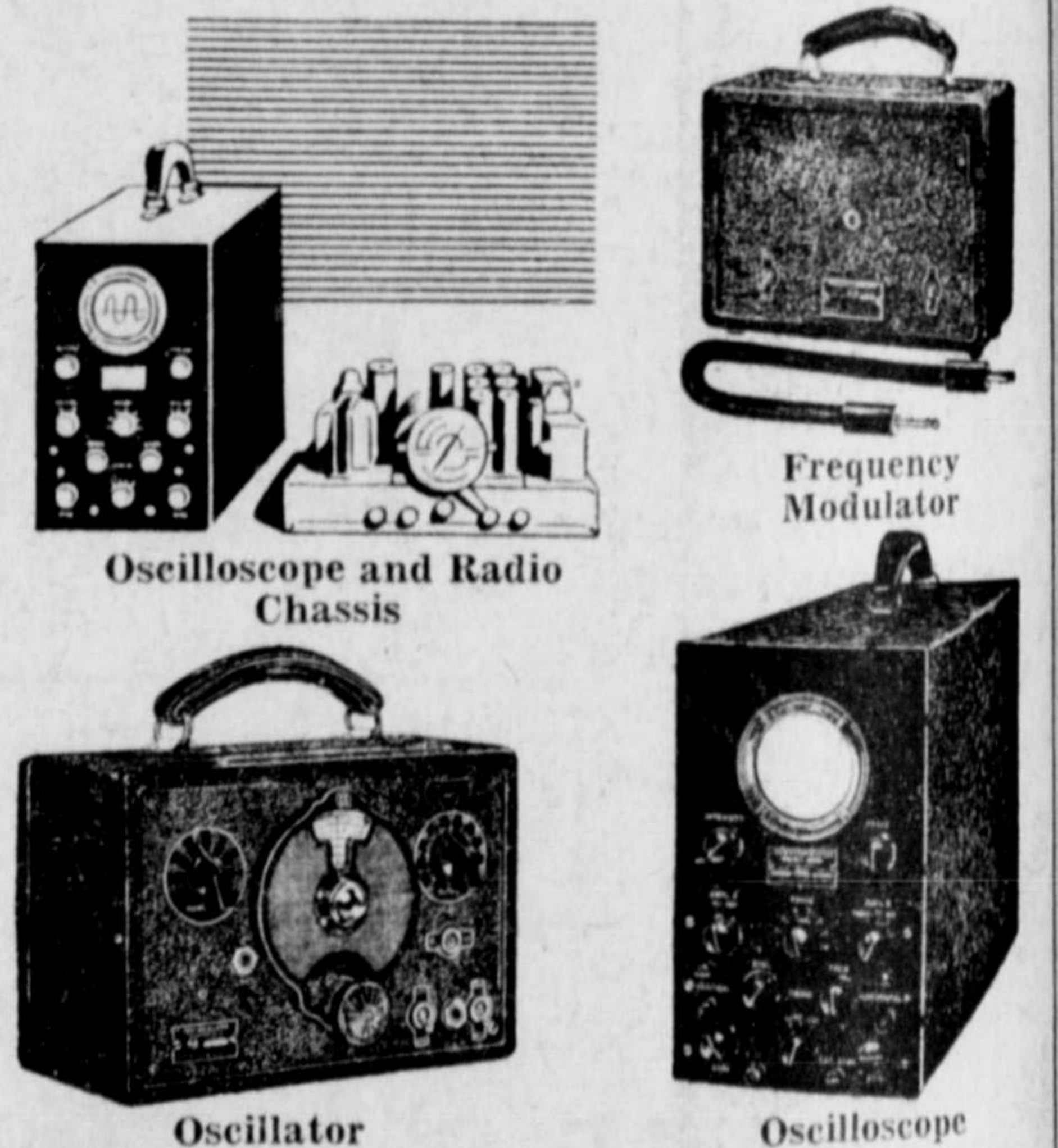
Illustrated above are the latest and biggest developments in radio servicing.

We do not give free service but we do offer you something you need—expert radio service at an honest price. We have the knowledge, equipment and integrity to put your set in perfect condition. If your set is not working at its best—if reception is noisy and poor—phone us now.