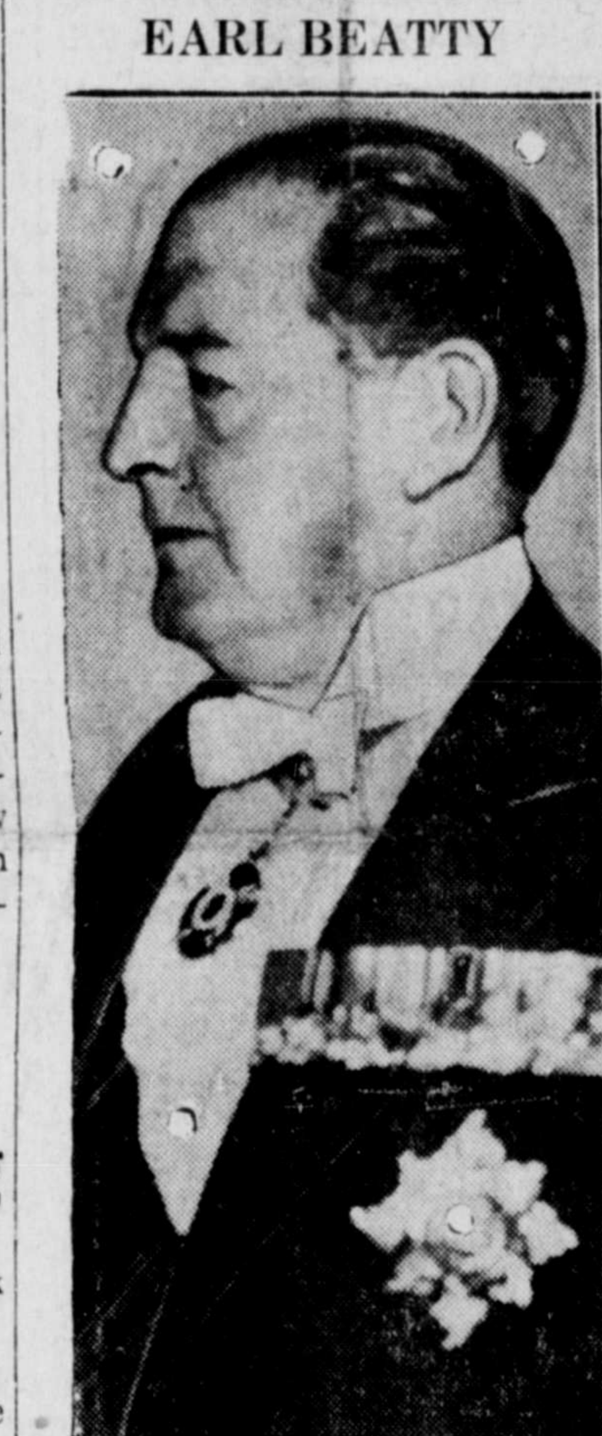
Former Admiral of the Fleet who passed away last night in London.

LONDON, March 11: (CP)—Earl David Beatty, aged 55, former Admiral of the Fleet, passed away last night. He suffered a chill while attending the funeral of the late King George and developed a heart ailment after which his condition became serious. For several days his recovery had been despaired of. He was placed on the retired list last January 17.