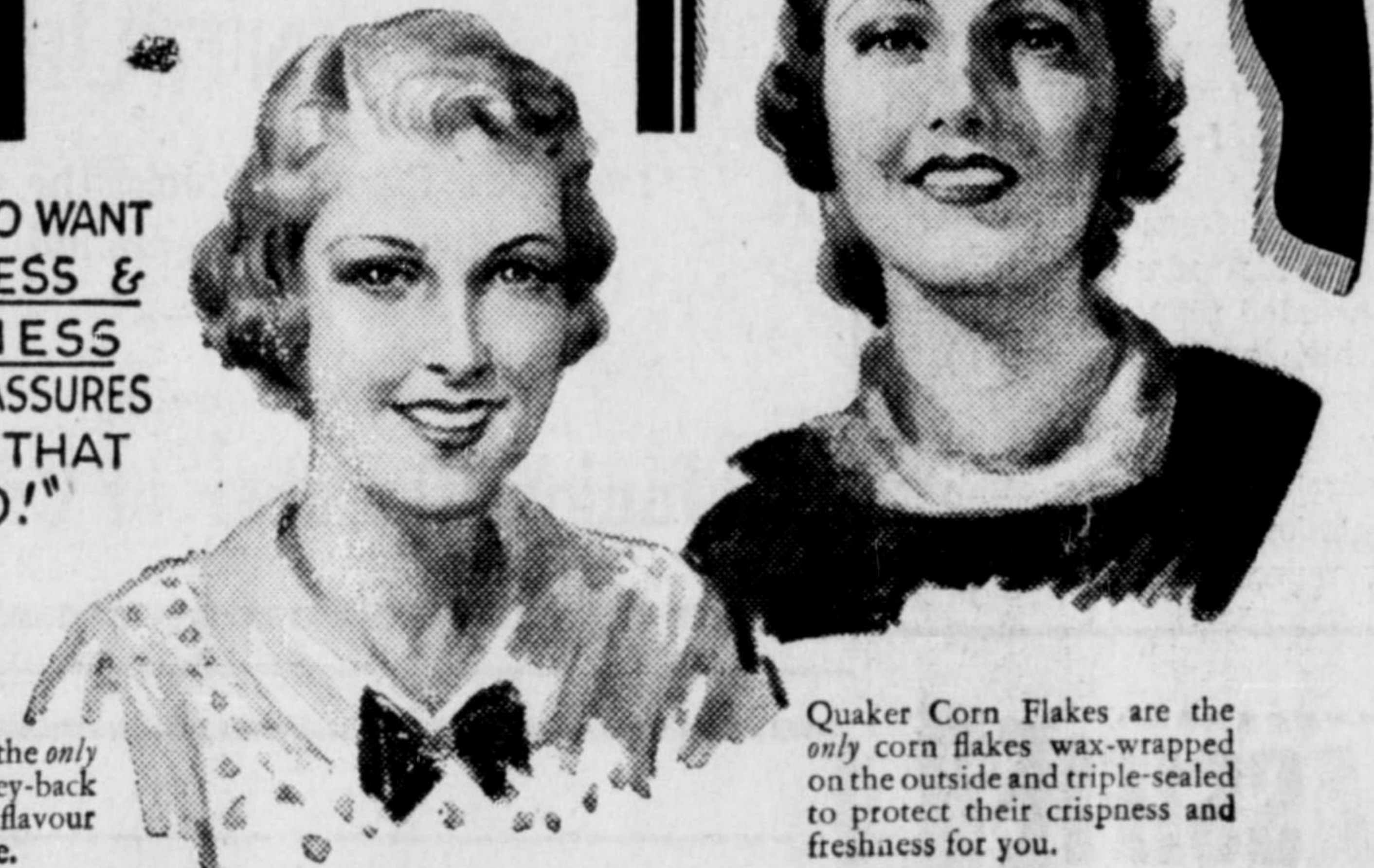
Quaker Corn Flakes are the only corn flakes with a money-back guarantee of better flavour printed on every package.

"YOU ALSO WANT FRESHNESS & CRISPNESS QUAKER ASSURES YOU OF THAT TOO!"