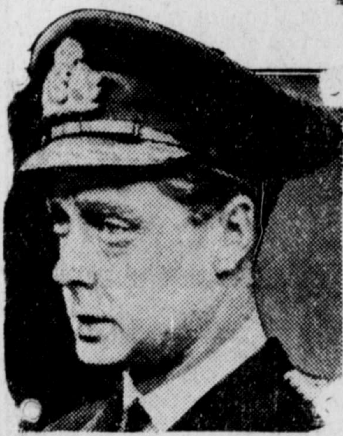
KING EDWARD VIII