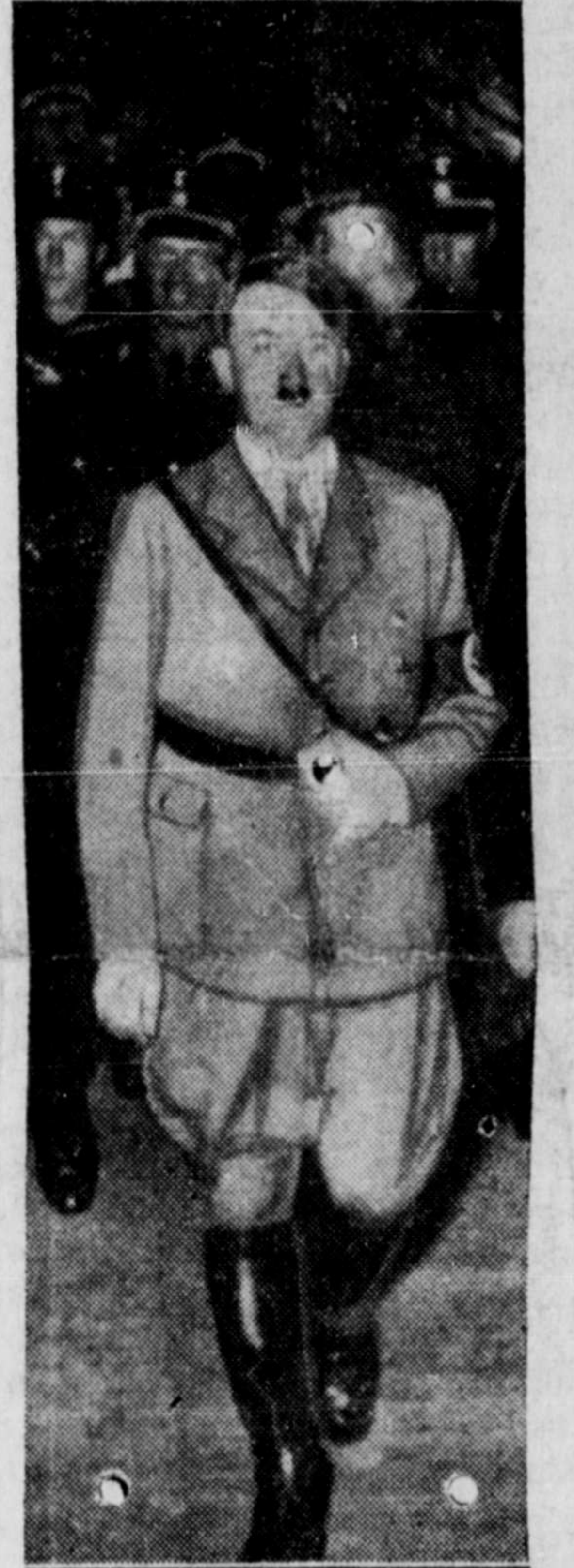
Who denounced Locarno and Versailles treaties today and sent German armies into Rhineland.