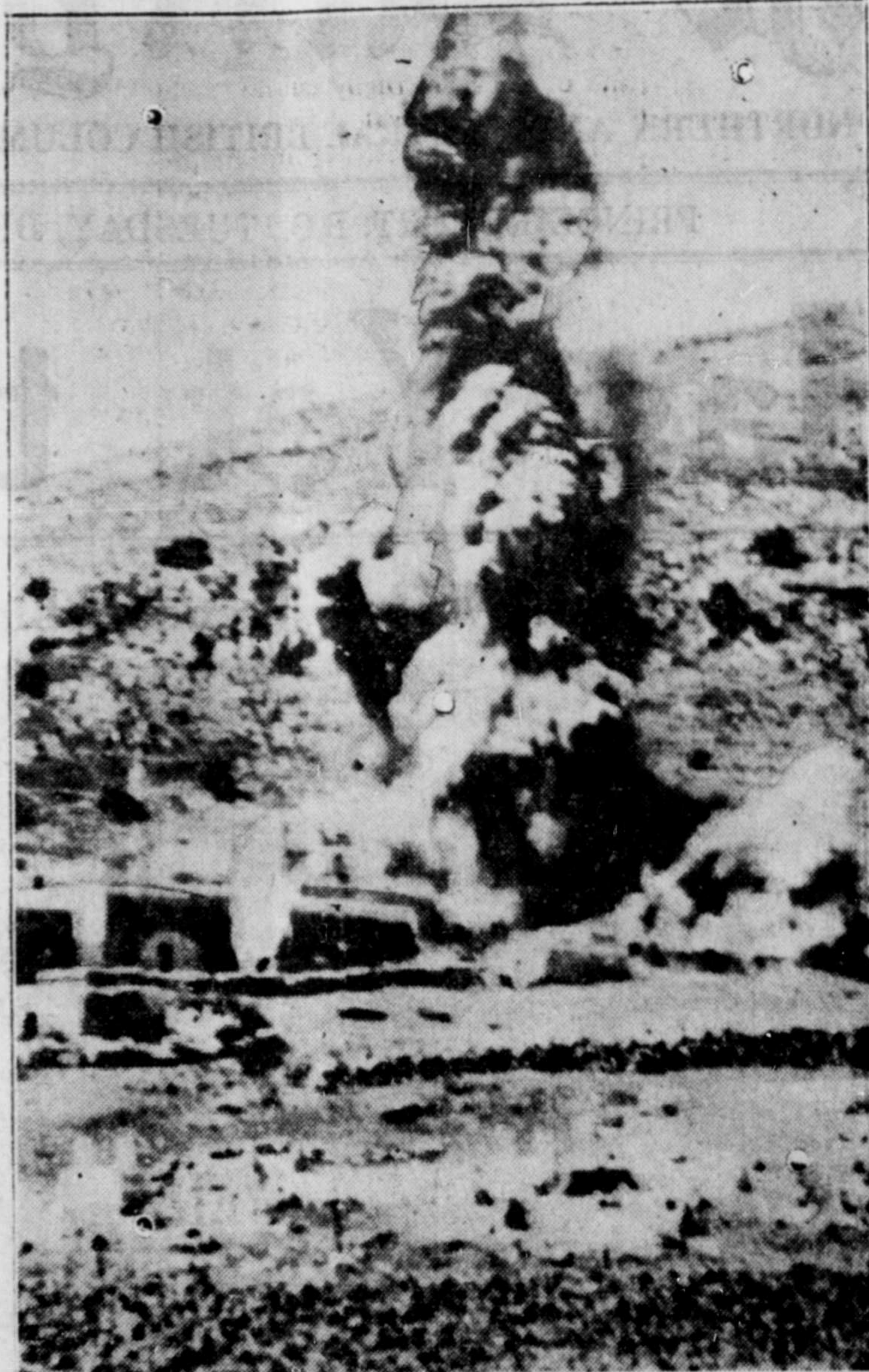
This graphic picture shows the actual blowing up of an Arab village near Tel Aviv, Palestine, by British forces. The huge column of smoke in centre marks the spot where a giant bomb was detonated to wreck the village as a reprisal for its people having joined Arab terrorist gangs in overt acts against Palestine Jews.