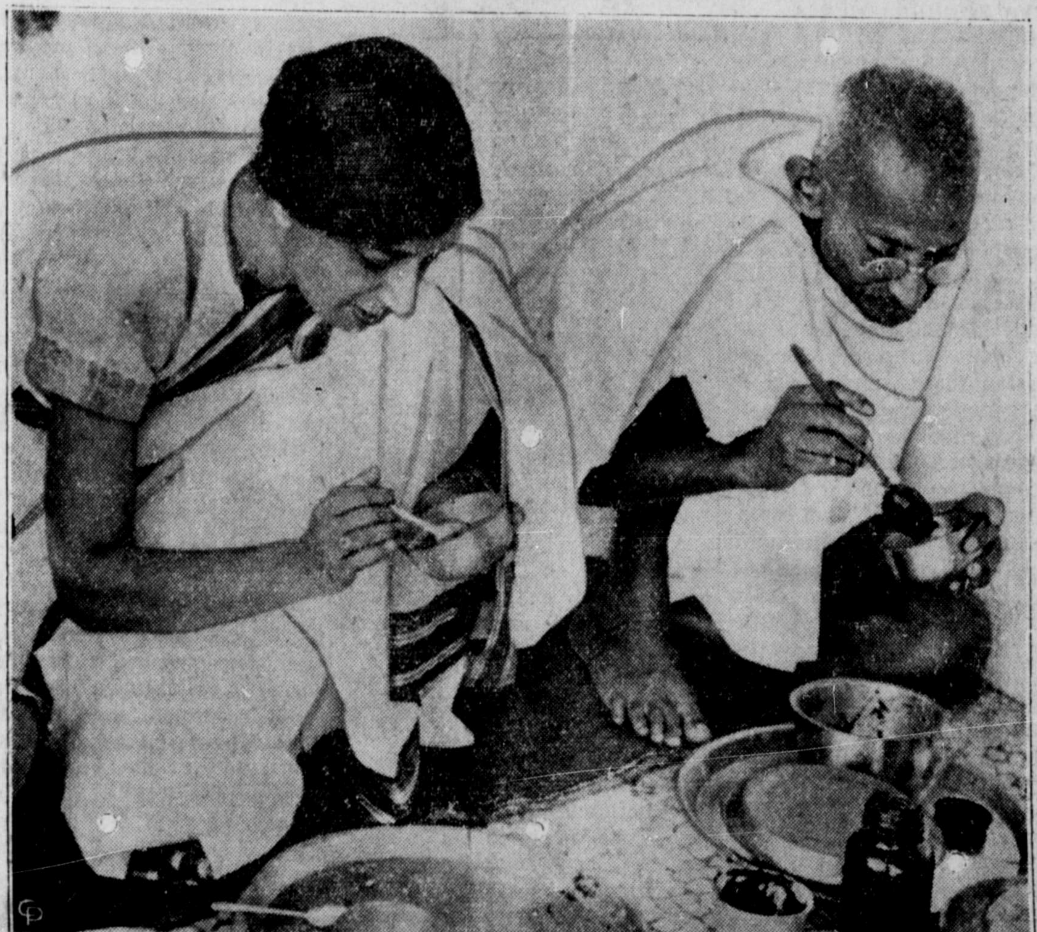
Life for Mahatma Gandhi goes on as he continues his chosen work of seeking liberation for millions of Indians from the yolk of religious oppression. The famed leader is shown here entertaining a guest at a frugal supper.

Regrettable That Former Monarch Should Have Sought Happiness in Manner So Inconsistent With Christian Principles