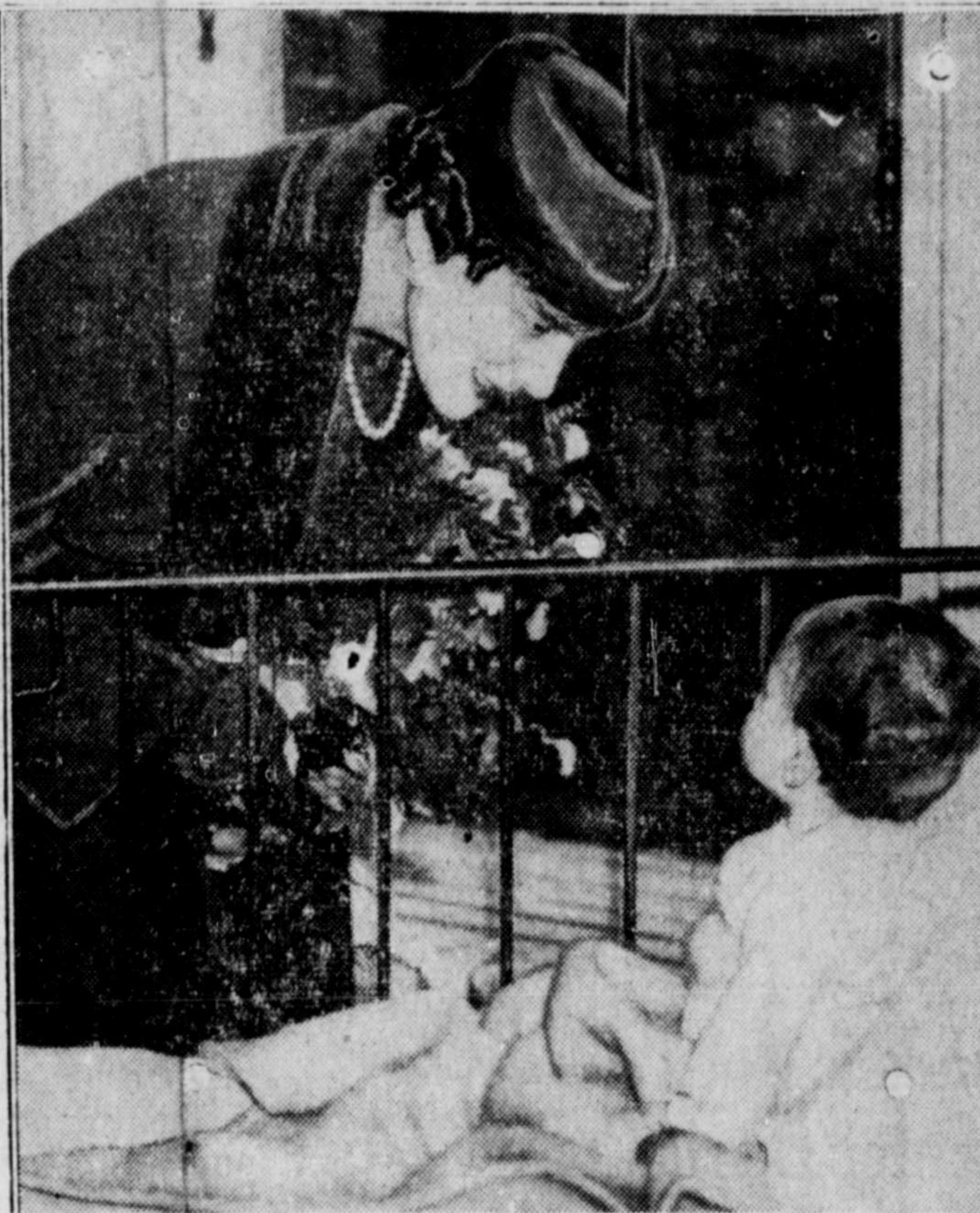
Here is a delightful study of the Duchess of Kent as she visited the Hampstead Children's Hospital on her first official engagement since the birth of her son, Prince Edward.