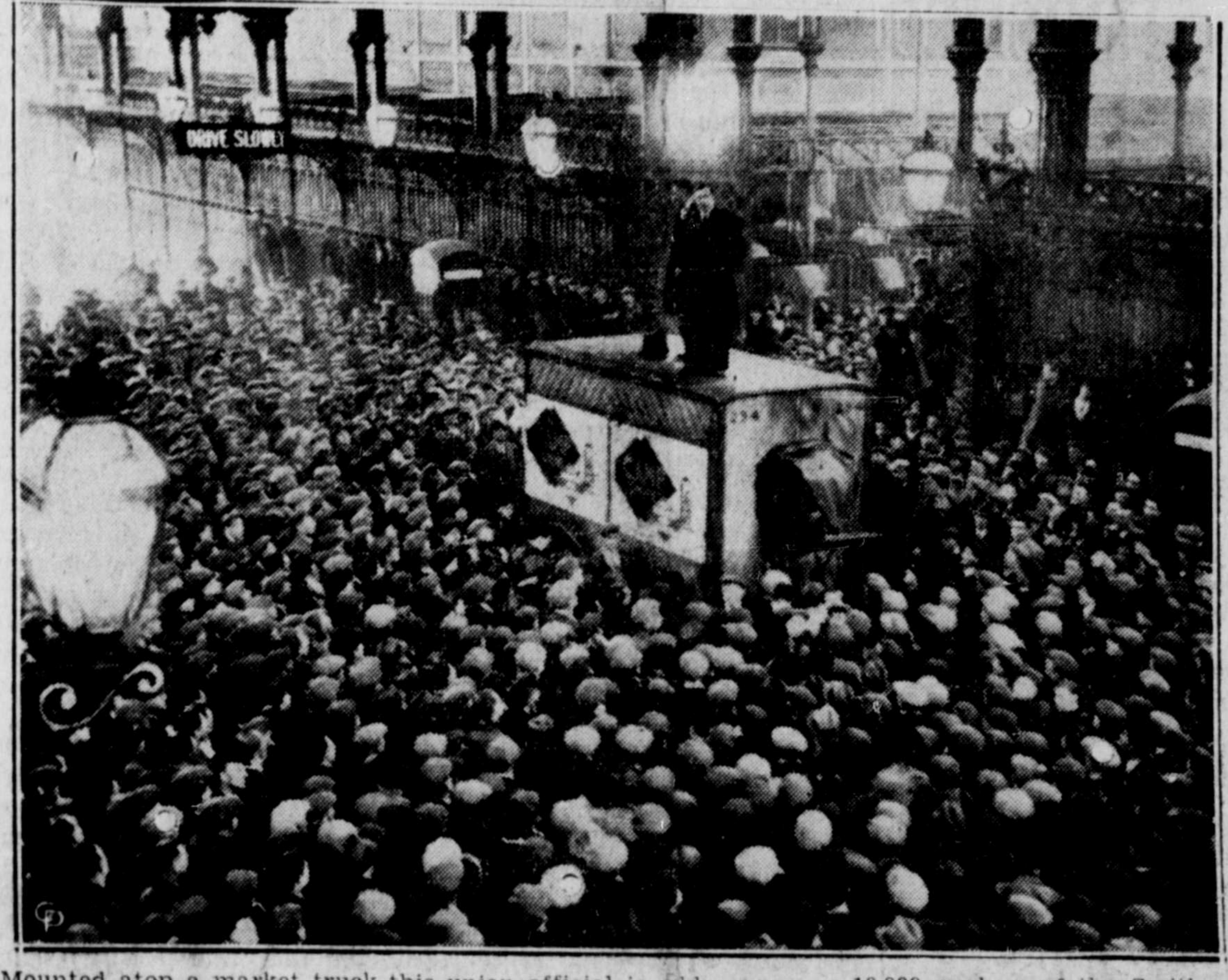
Mounted atop a market truck this union official is addressing the 10,000 workers of the Smithfield market who went out on strike.