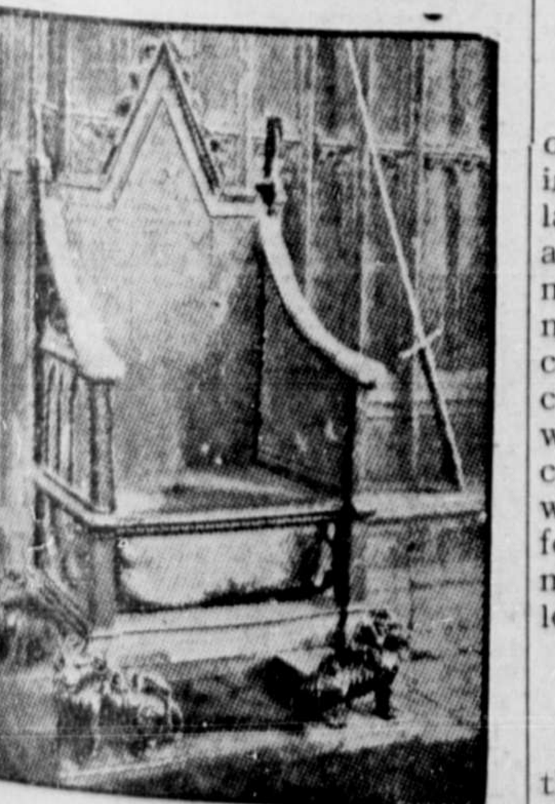
CORONATION CHAIR AND STONE

Tomorrow night at 8 o'clock in the Carpenters' Hall there will be a meeting of the St. Andrew's Society to make arrangements for St. Andrew's Night, November 30th. All Scotsmen desirous of becoming members are invited to be present.