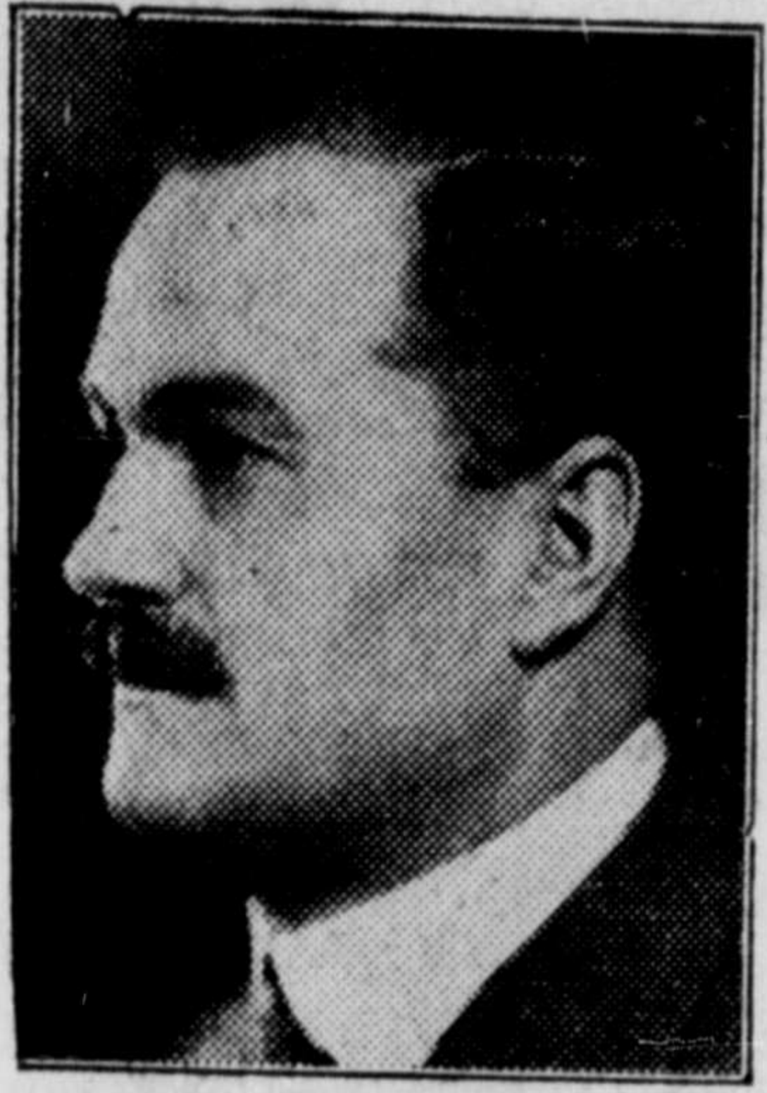
Hon. Charles A. Dunning, minister of finance.