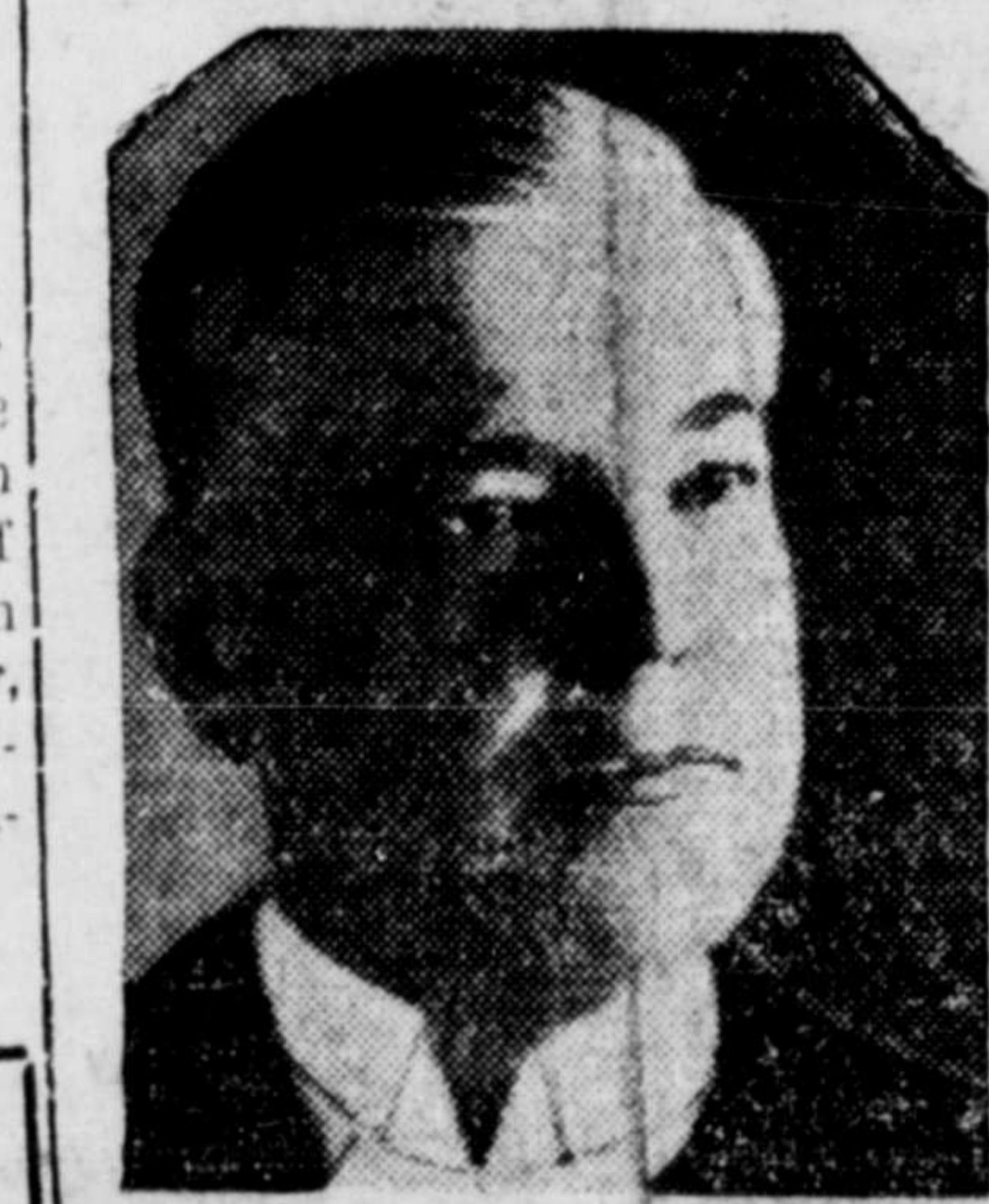
SENATOR RODOLPHE LEMIEUX

yesterday at his home here after a five-day illness. He was seventy-one years old.