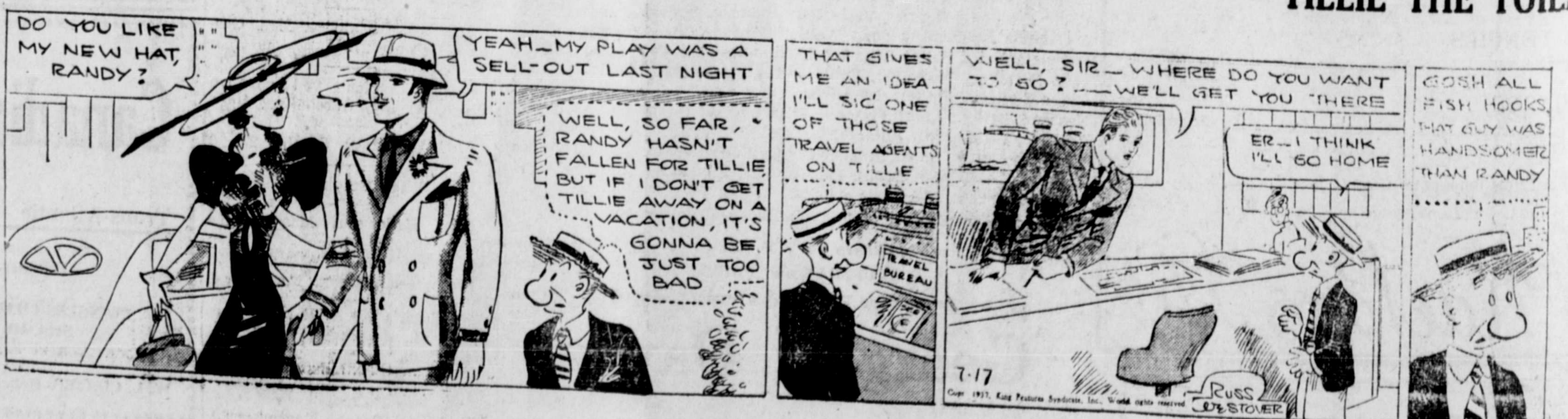
"TILLIE THE TOILER"