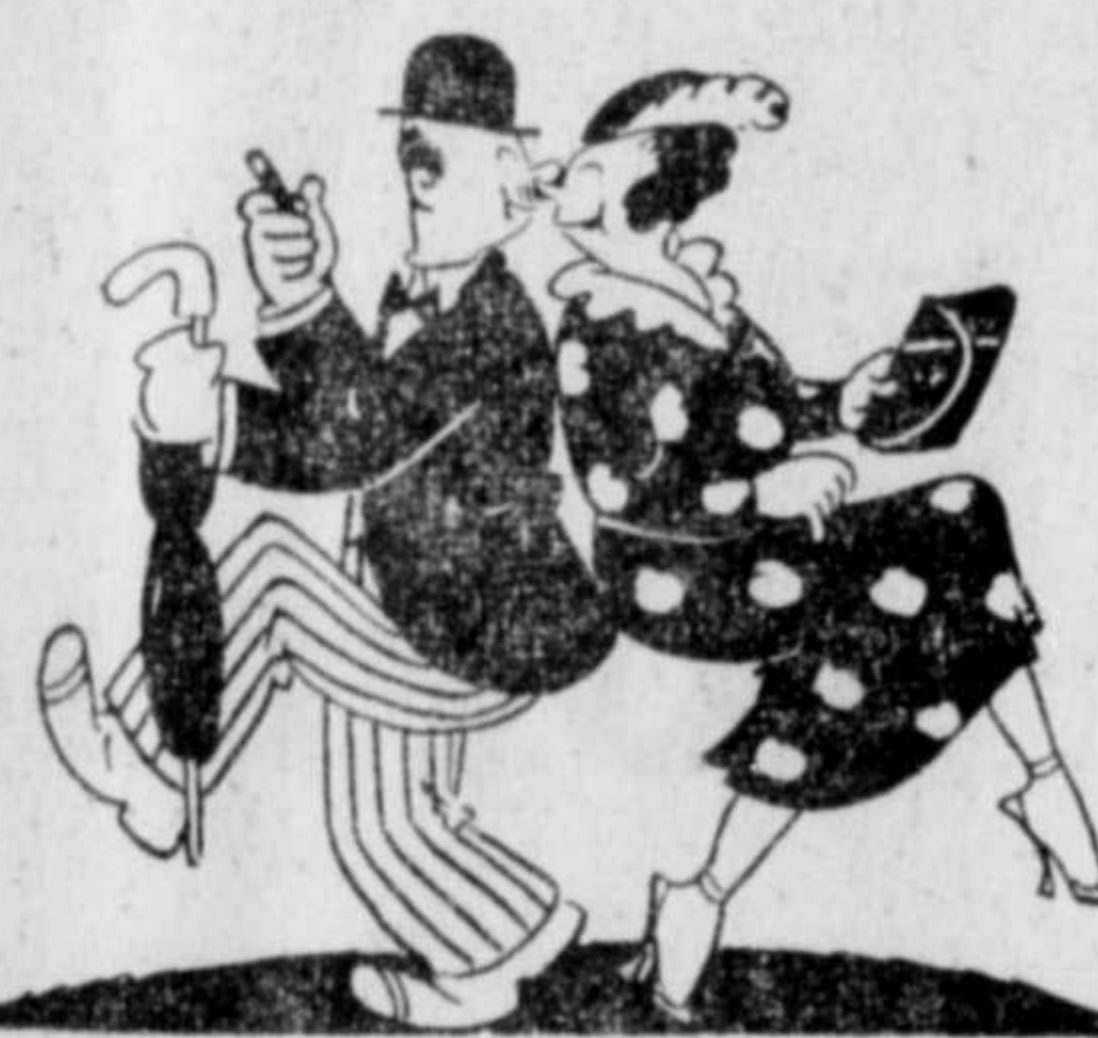
The Morning After Taking Carter's Little Liver Pills

TORONTO, Feb. 15: (CP)—Federal commission investigating the penal system, after public sittings here which started last week, will inspect Kingston penitentiary and Ontario Reformatory, Guelph, and then go west to Manitoba, Saskatchewan and British Columbia prisons.