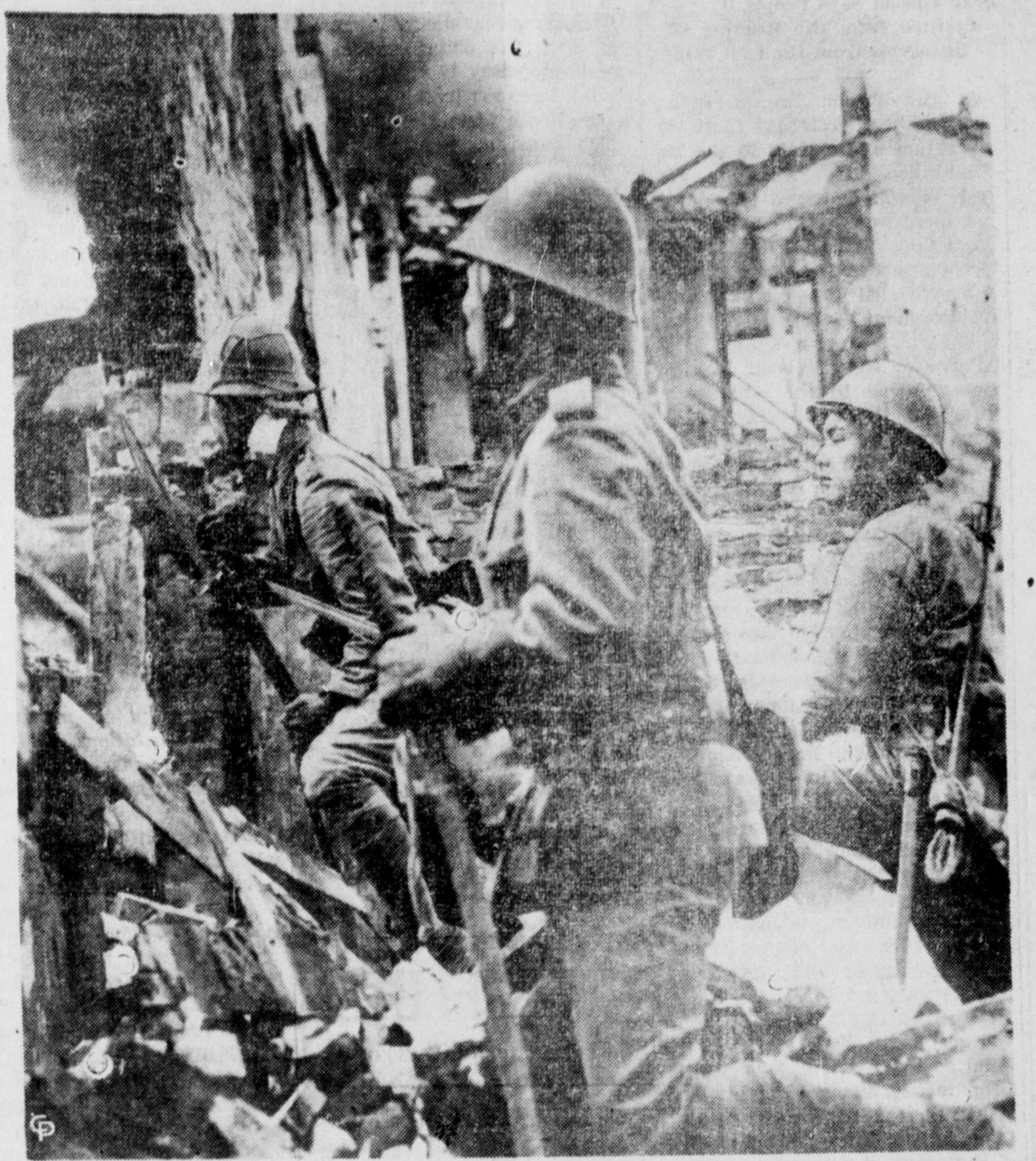
The photographer took his life in his hands to secure this excellent photo of Japanese "mopping up" operations in the Chapel district of Shanghai.