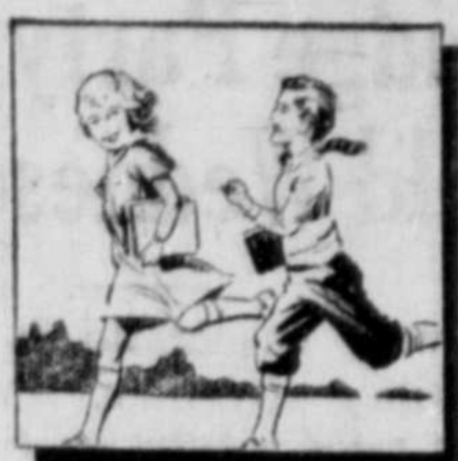
Going to School