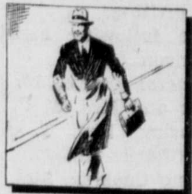
Going to Work