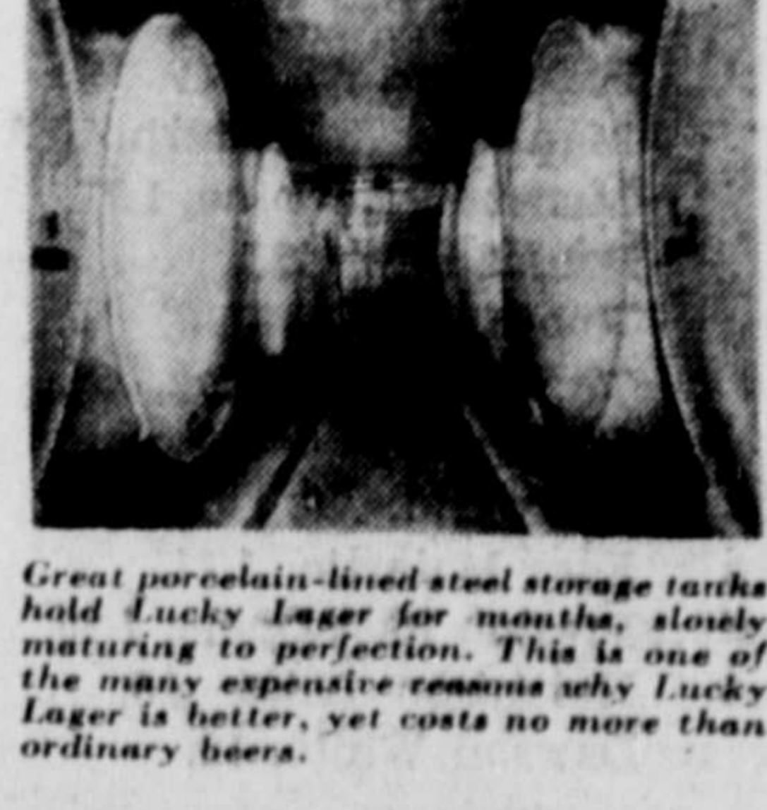
Great porcelain-lined steel storage tanks hold Lucky Lager for months, slowly maturing to perfection. This is one of the many expensive reasons why Lucky Lager is better, yet costs no more than ordinary beers.

This advertisement is not published or displayed by the Liquor Control Board or by the Government of British Columbia.