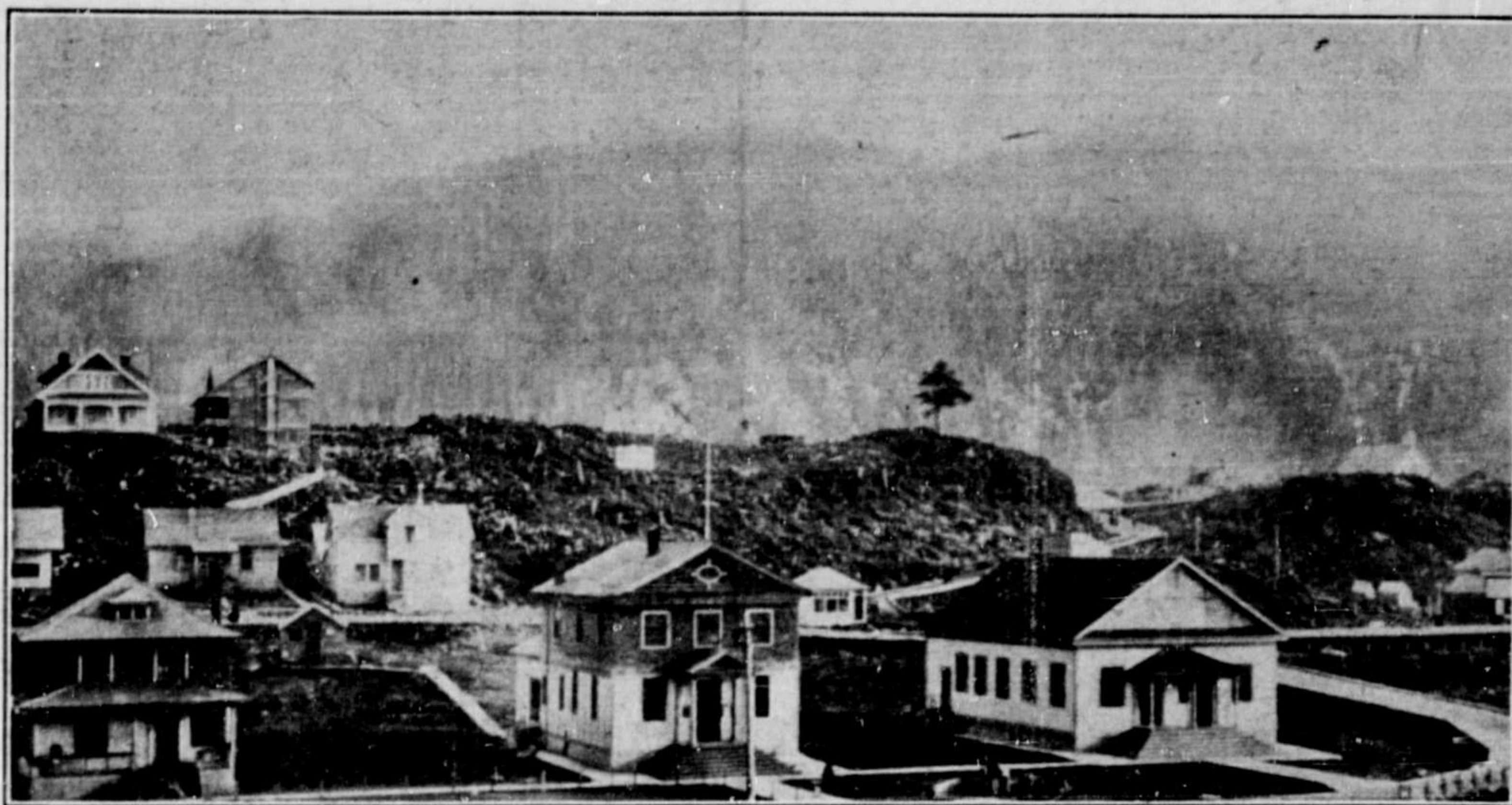
THE GOVERNMENT BUILDINGS The building on the right is the one that was destroyed by fire today

Hundreds of citizens deserve thanks for the way in which they turned in to help. Had it not been for the segregated character of the Government Buildings, a disastrous fire that would have swept the townsite would have ensued.