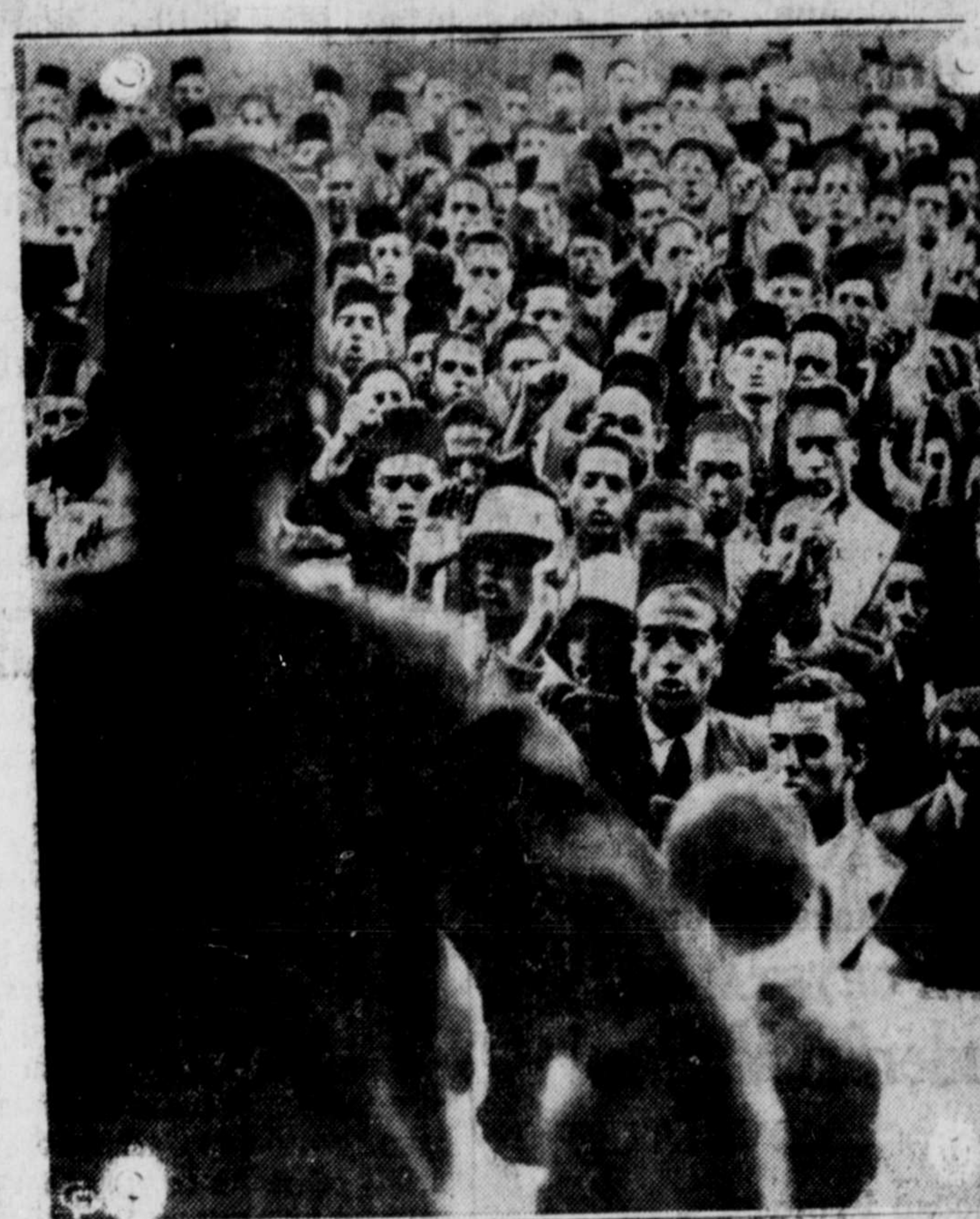
A huge meeting of demonstrators is shown being addressed by one of the leaders in the recent anti-government rioting among students of Cairo, Egypt. Police fired into the mob of rioters, and 60 were injured before troops restored order.

little Prince Edward and tiny Princess Alexandria of Kent he will bring them matching toys. When their mother goes shopping she buys two at a time. "I must have one for each," she tells the waitresses. Among presents she has bought for her friends are dainty little chintz cases filled with cotton wool for removing make-up and made to hang beside the dressing table.