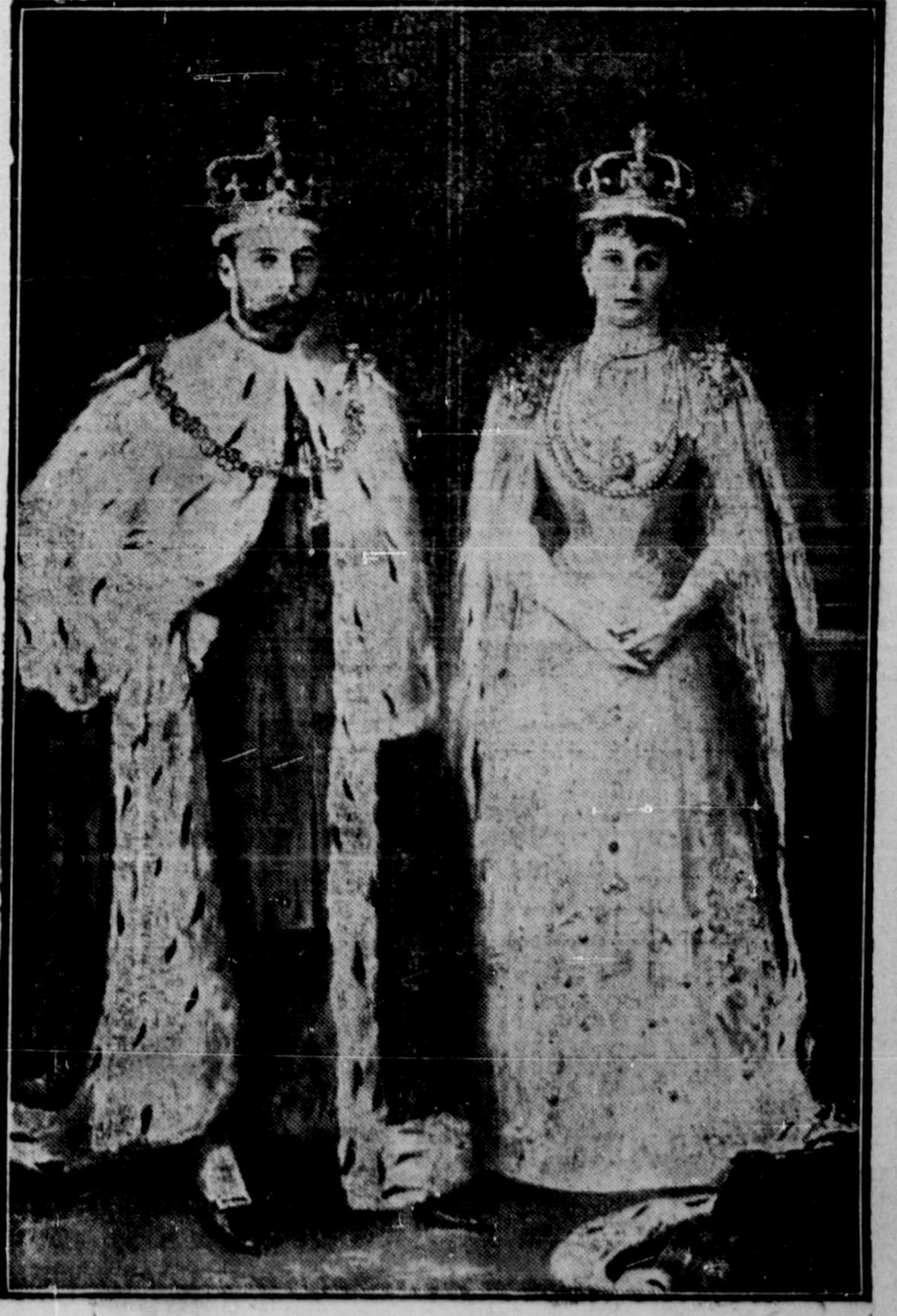
KING GEORGE AND QUEEN MARY Who have reached Bombay, India.

A gift that always pleases—beautiful Chinaware. Many things from the celebrated potteries of Europe.—Wallace's