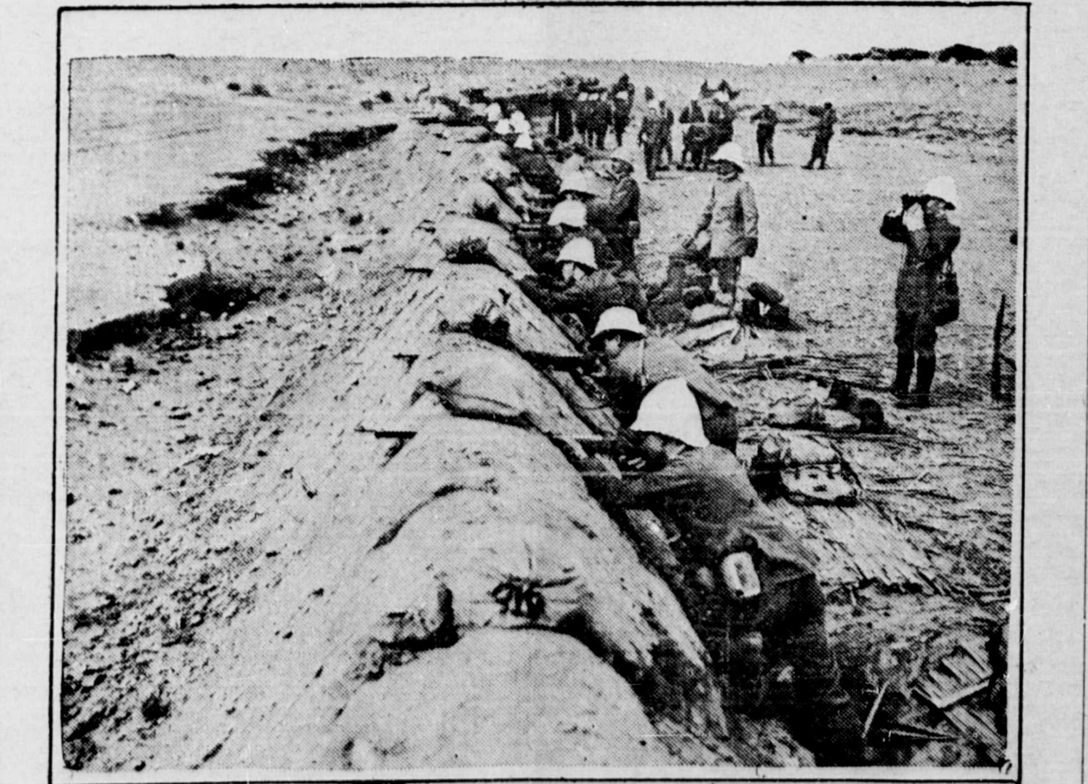
This photograph was taken in the Bumeliana, the Italians' most advanced point in Tripoli. The Italians were entrenched and the Turks attacked them and were repulsed with heavy loss.