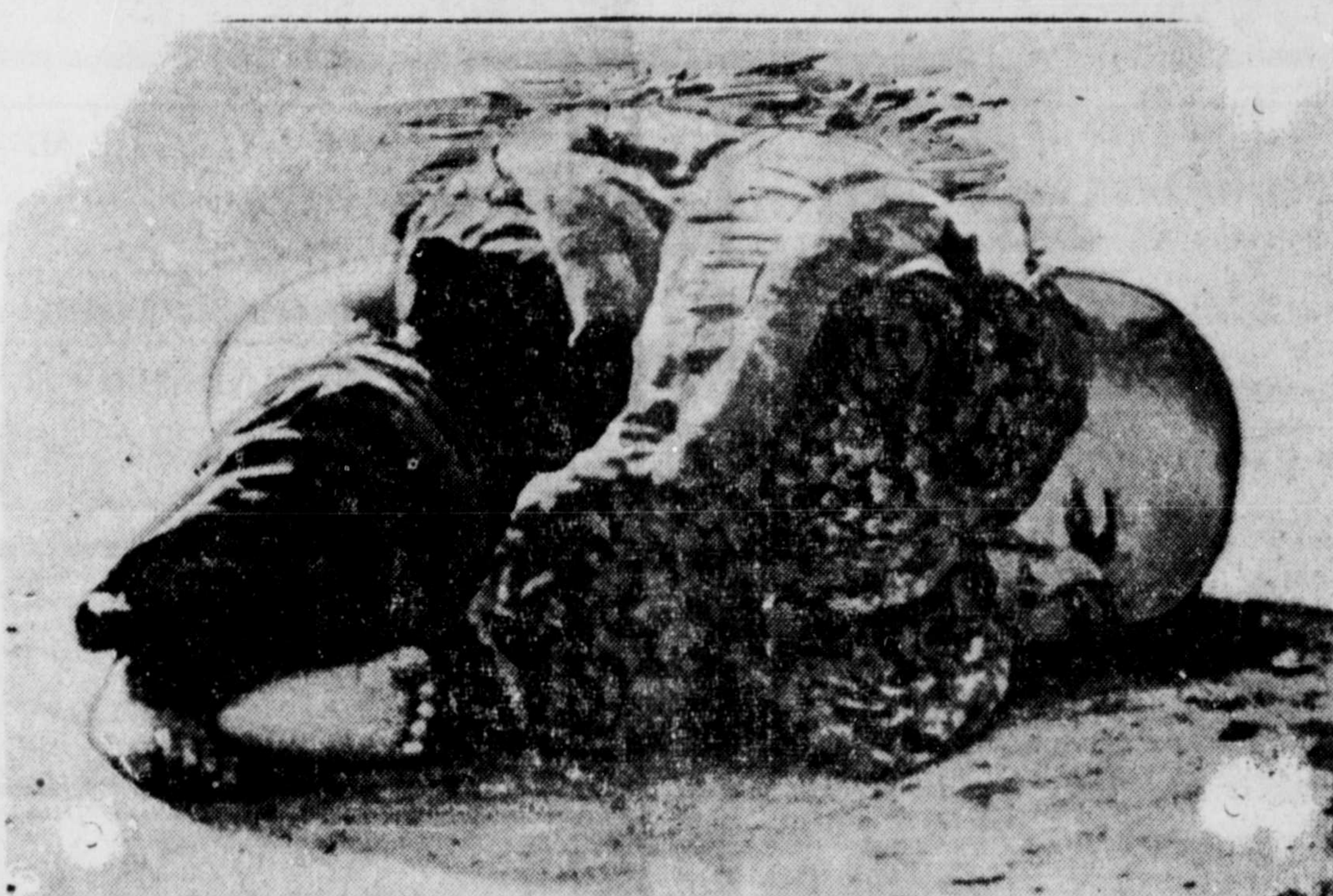
Huddled in terror against the unyielding pavement of a Shanghai street as Japanese war-aeroplanes roar overhead and bursting bombs and the shells from big guns turn his world into a holocaust, this little Chinese baby walls pitifully for the mother who was struck down by an invader's bullet. Many hours he lay unnoticed on this road near the Jessfield railway bridge while men talked in Brussels and a bloody bat leaped unchecked—one little peace-seeker in a city gone mad with war.