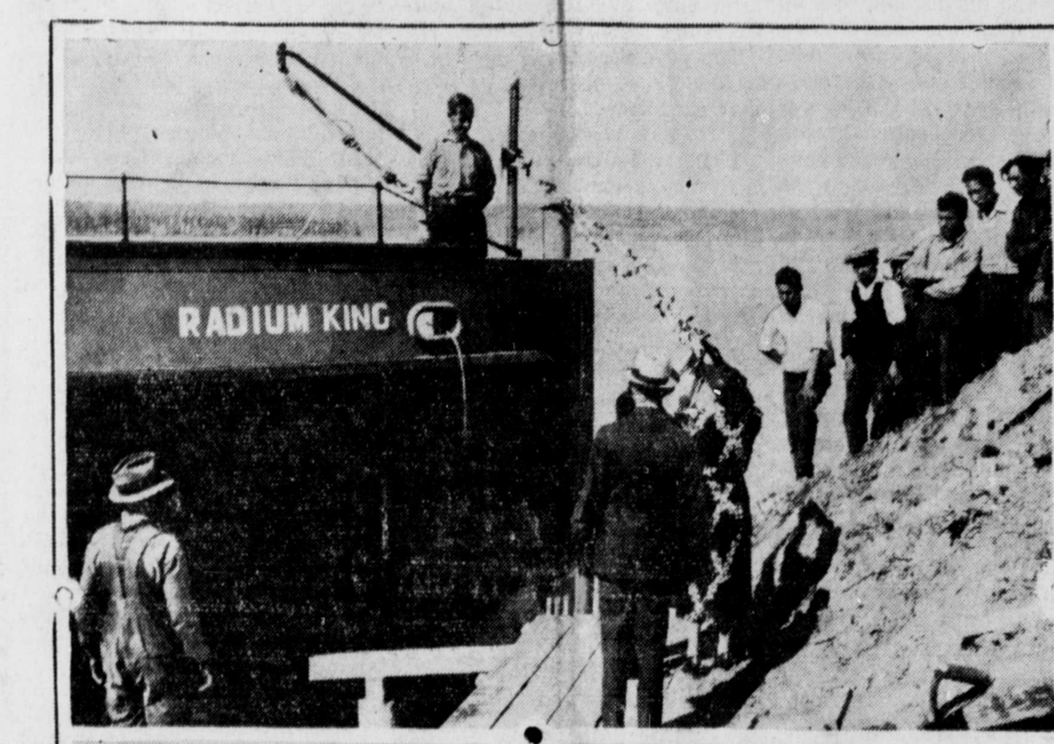
ALL-STEEL VESSEL TAKES TO WATER IN SUB-ARCTIC

Big Increase In Lumber Exports Shipments from Province This Year Are Far Ahead Of 1936