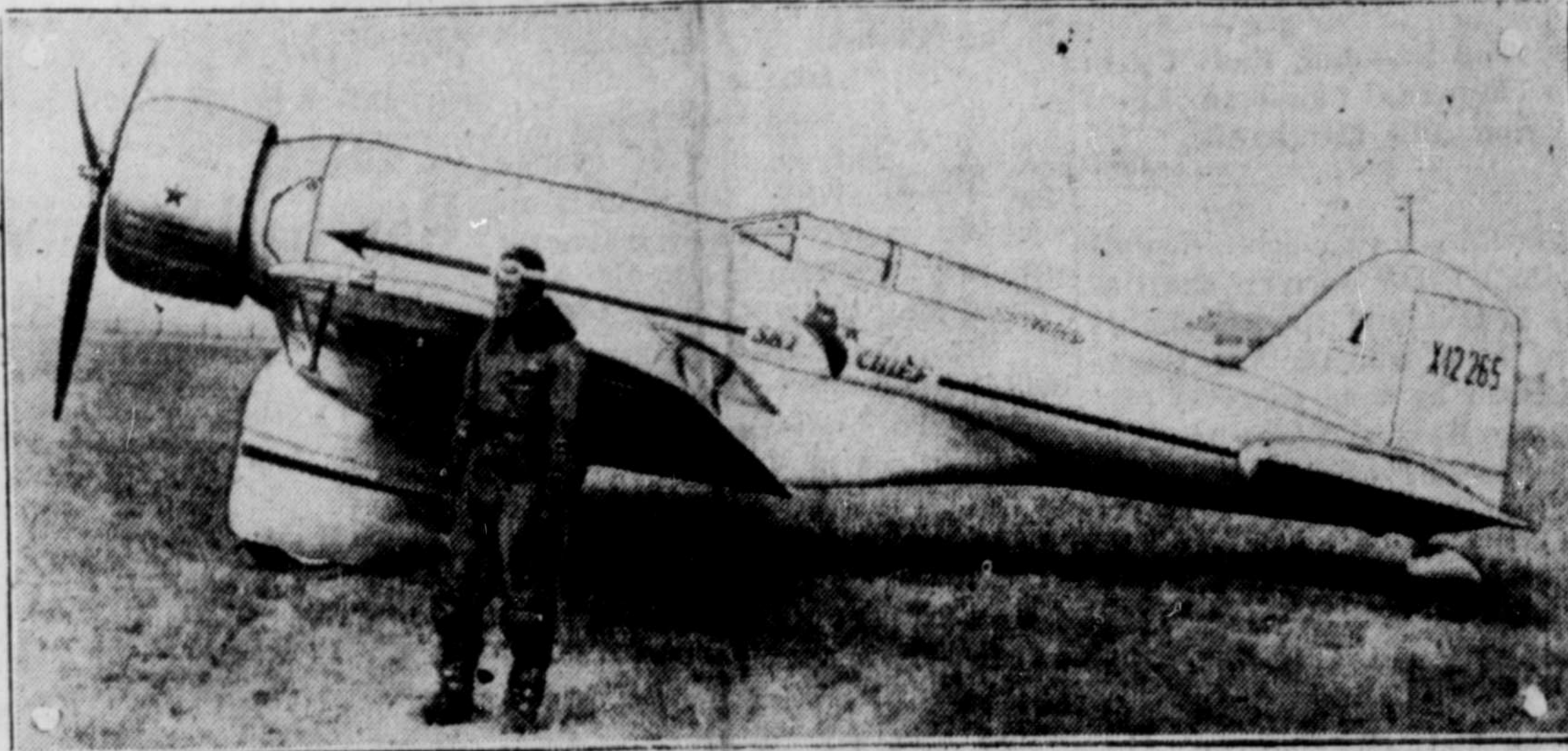
CAPT. FRANK HAWKS

EAST AURORA, New York August 24: (CP)—Capt. Frank Hawks, noted American speed flier, who was well known throughout the country for his many aerial exploits was fatally injured yesterday when his plane hit a high tension wire line and crashed in flames. His companion suffered injuries and burns which proved fatal. The bodies of the two men were dragged from the burning wreckage by horrified onlookers. Hawks was immediately taken to Buffalo where he was to have met his wife on her return from a trip to Florida.