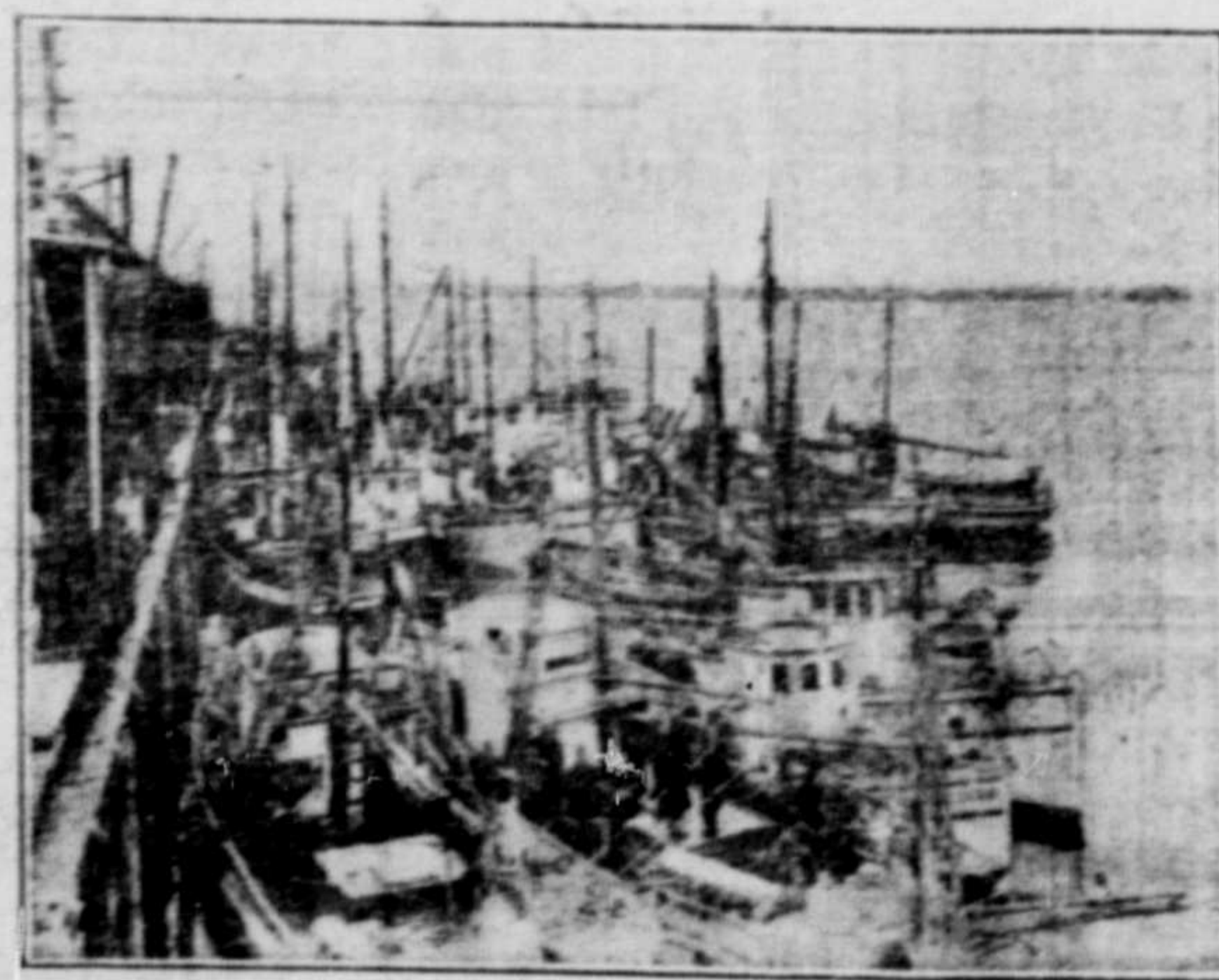
A daily scene at Prince Rupert during the fishing season.